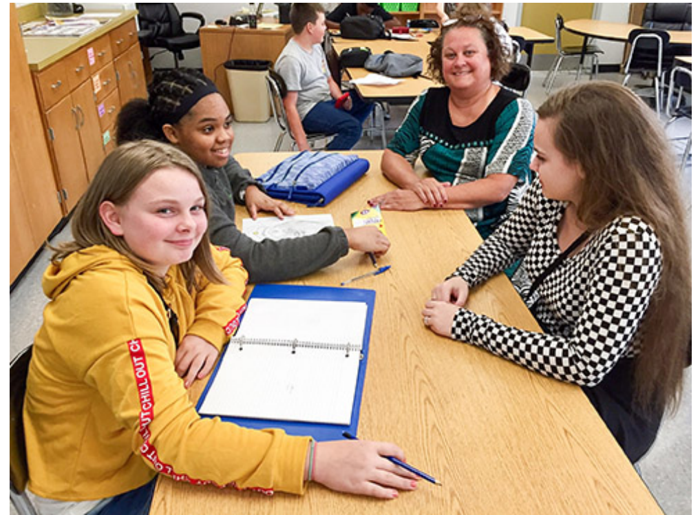
The Phoenix School of Discovery