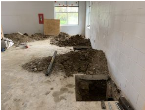
2020.05.14 – River Ridge Media Center