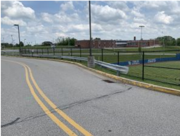
2020.05.14 – SK fencing