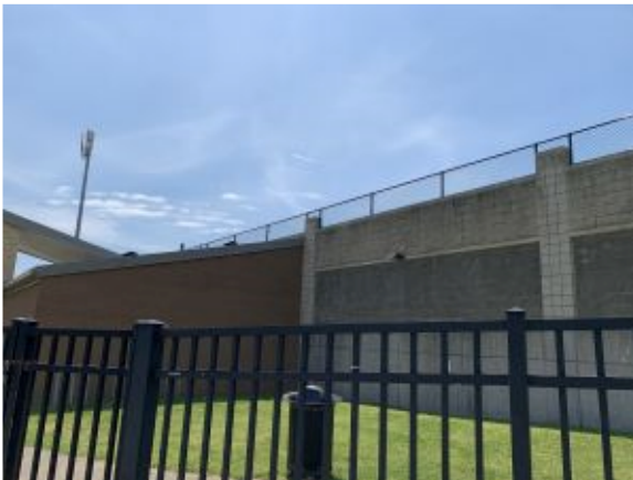
2020.05.14 – Dixie visitor bleacher fall protection