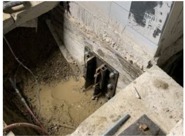
2020.05.14 – River Ridge Media Center push pier bracket