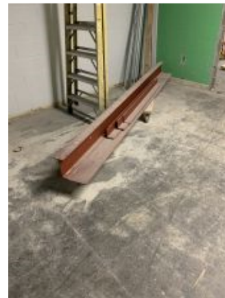
2020.05.14 – River Ridge lintel awaiting installation