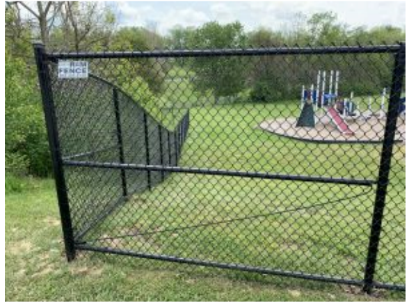
2020.05.14 – Kenton fencing