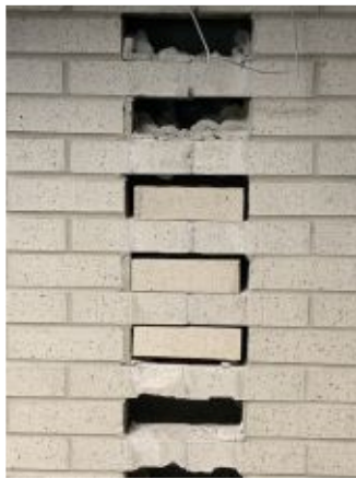
2020.05.06 – River Ridge brick samples