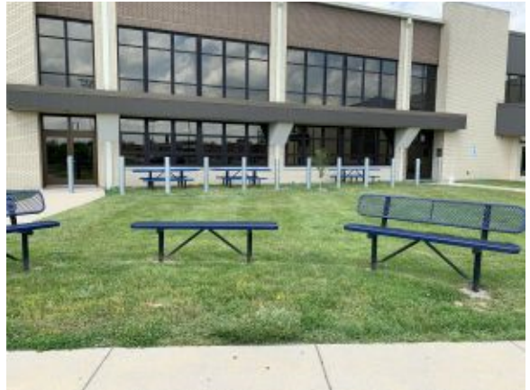
2020.05.14 – SK bollards