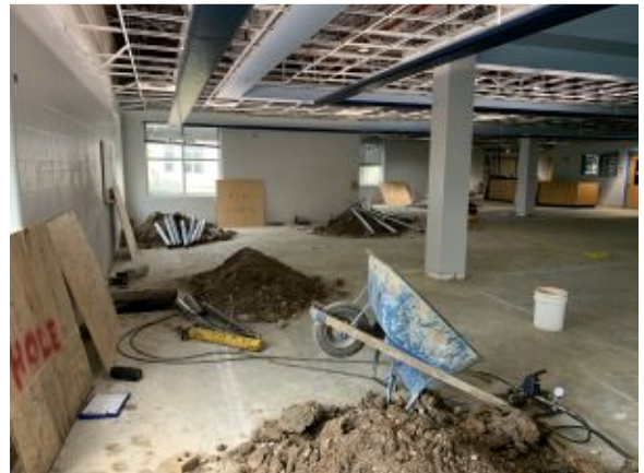
2020.05.14 – River Ridge Media Center