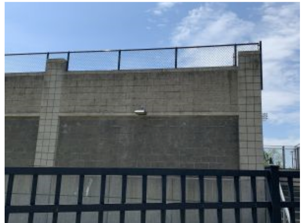
2020.05.14 – Dixie visitor bleacher fall protection