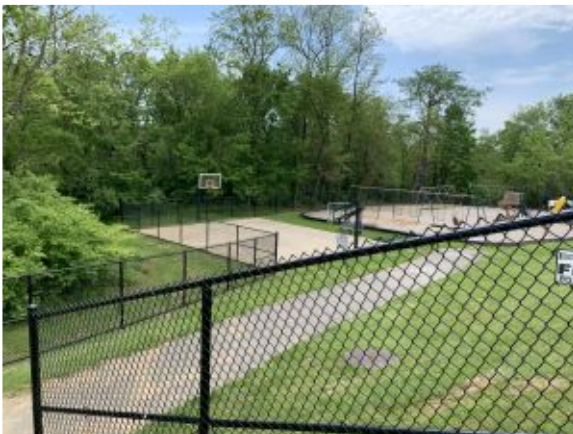
2020.05.14 – Taylor Mill fencing