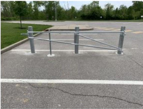
2020.05.14 – Woodland traffic control gate