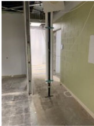
2020.05.14 – River Ridge plumbing rough-in