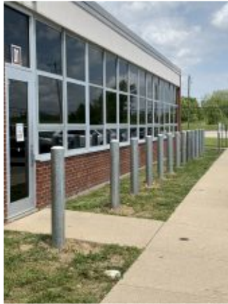
2020.05.14 – Kenton bollards