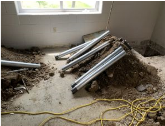
2020.05.14 – River Ridge Media Center push pier sections