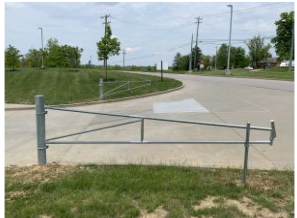
2020.05.14 – Scott traffic control gate