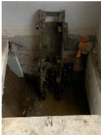
2020.05.14 – River Ridge Media Center push pier installation prep