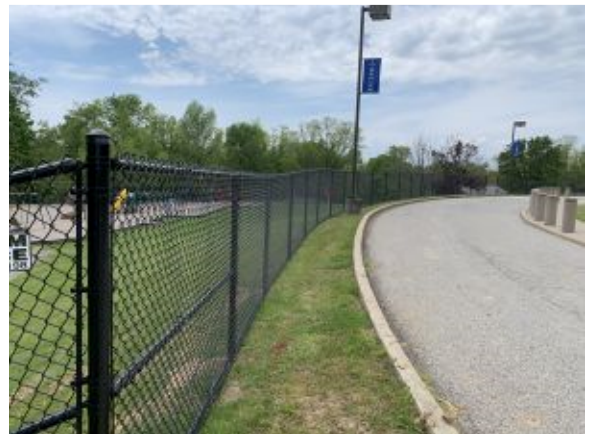
2020.05.14 – Taylor Mill fencing