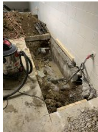
2020.05.14 – River Ridge Media Center