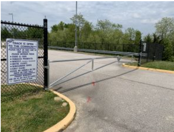
2020.05.14 – Scott traffic control gate