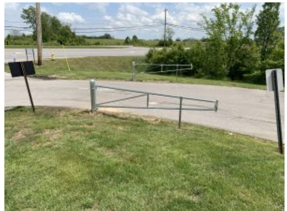
2020.05.14 – Kenton traffic control gate