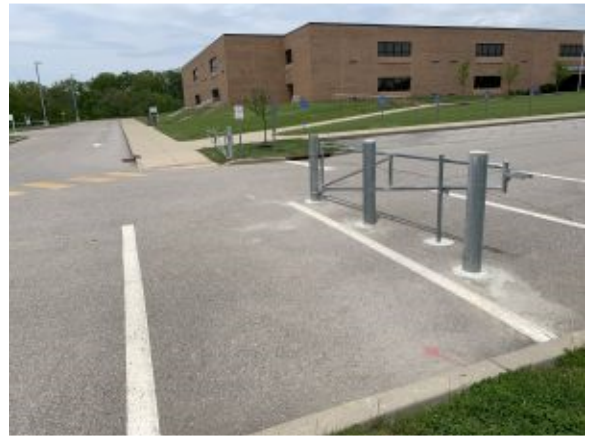
2020.05.14 – Woodland traffic control gate