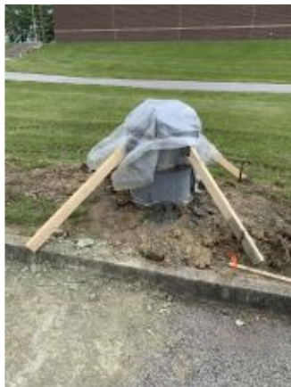
2020.05.14 – White's Tower light pole base