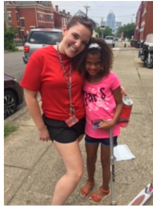
Home Visit Day with an upcoming 3 rd Grade Student