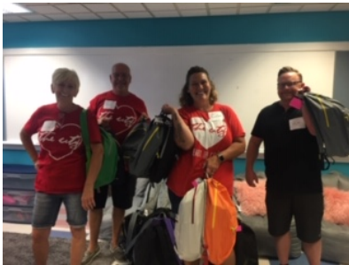
7 Hills Church's Backpack Donation