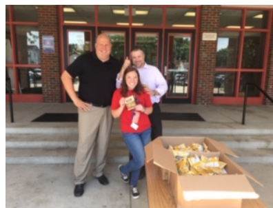
Harlow HRK handing out snacks on Fridays