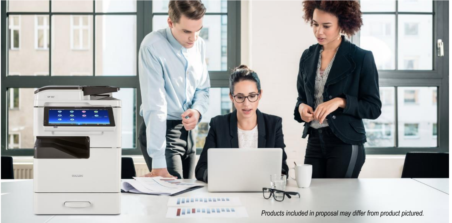
Products included in proposal may differ from product pictured.