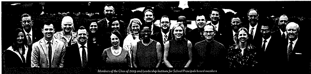
Members of the Class of 2019 and Leadership Institute for School Principals board members

In March, the Leadership Institute for School Principals held a graduation ceremony for the Class of 2019 at the Governor's Mansion. Governor Matt Bevin and Kentucky Education Commissioner Wayne Lewis attended as well as Leadership Institute board members, donors, and many Kentucky business leaders.