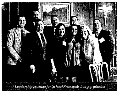
Leadership Institute for School Principals 2019 graduates