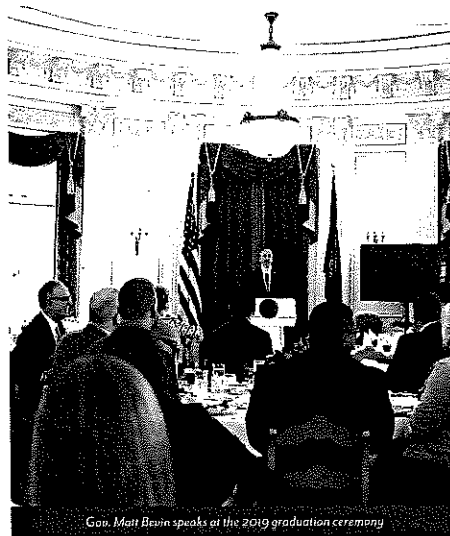
Gov. Matt Bevin speaks at the 2019 graduation ceremony