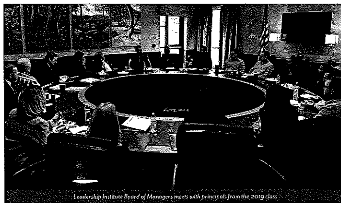
Leadership Institute Board of Managers meets with principals from the 2019 class