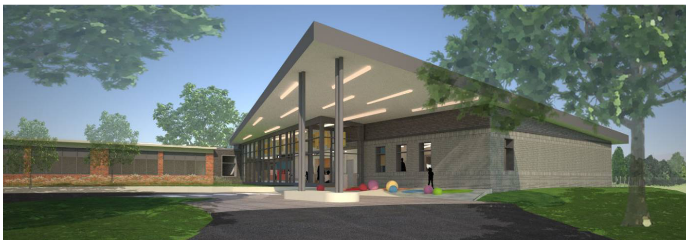
Hogsett Primary School

In 2017 we began design of the renovation and additions to the former Hogsett Elementary in Danville for use as the newly organized Mary G Hogsett Primary School, a preschool through 1 st grade facility. As with the Moorman School and the EdHub before it, this project – now under construction – involved a re-thinking of how the whole facility could be organized to allow for break-out spaces, special focus areas, and flexible collaborative space.