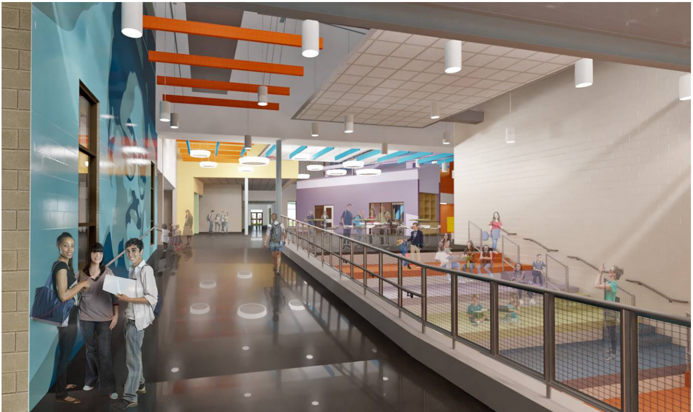
Marnel C Moorman School – The central circulation space, with adjacent presentation space

Our specific involvement with Early Learning curriculum over the last few years has also been an exploration of how the learning spaces can best serve those programs. After the overwhelming success of Studio Kremer’s facility for Bardstown’s Early Childhood program, Nelson County engaged Studio Kremer to adapt their former Central Office/warehouse into a new central Early Learning Center.