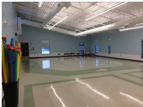
Nelson County Early Learning Center