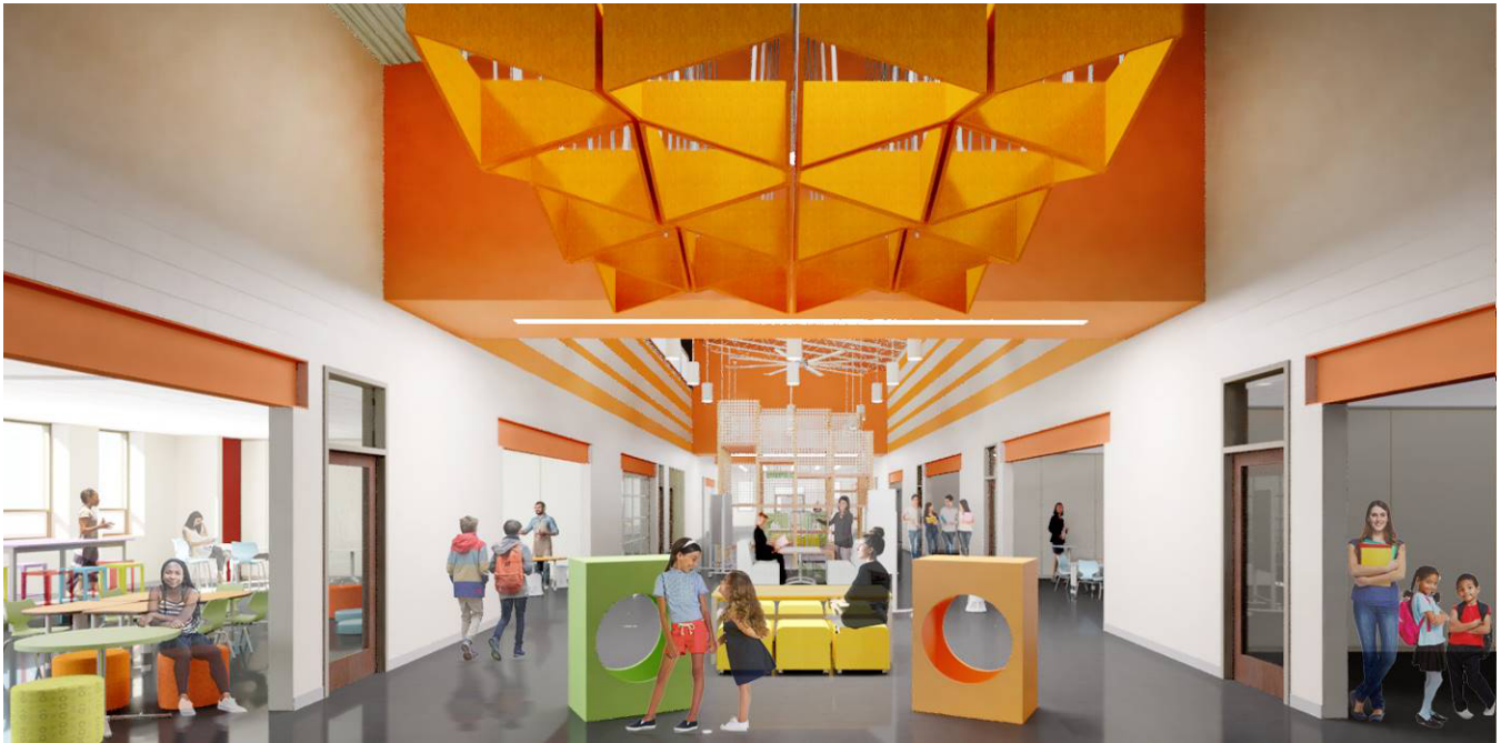
Marnel C Moorman School – The central collaboration/presentation space in one of the 3 classroom ‘neighborhoods’

project-based/peer presentation models, requiring that the facilities be configured to support a different kind of student interaction.