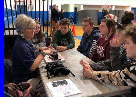
Students on the Move Drunk Driving Program