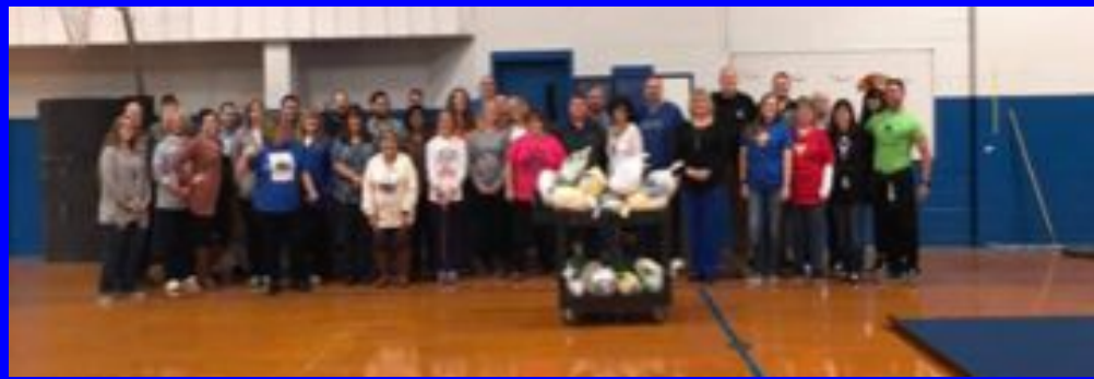
BLHS 1st Annual Turkey Bowl

We have maintained at least 94% for the past 3 years and have maintained 1st place in attendance for high schools for the last 10 years!!!