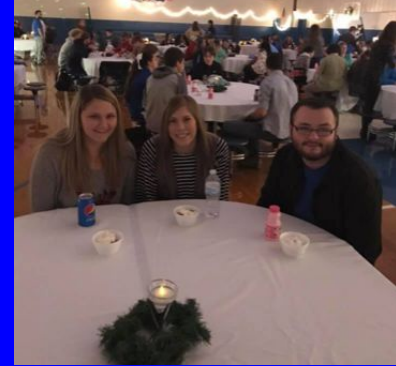
Christmas Dinner (NHS and Beta Club)