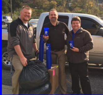
Working with our feeder schools