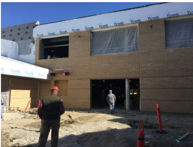
2018.10.23 – Brick at courtyard.