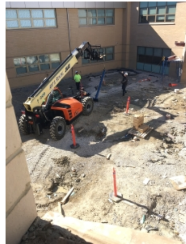
2018.10.23 – Shade canopy column being installed.