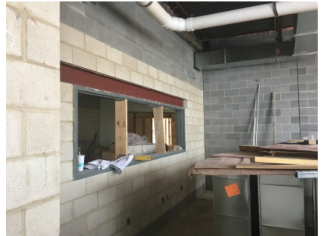
2018.10.02 – Interior window – courtyard side classroom.