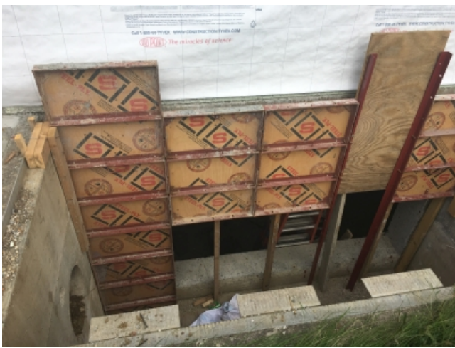
2018.10.02 – Formwork at area well infill.