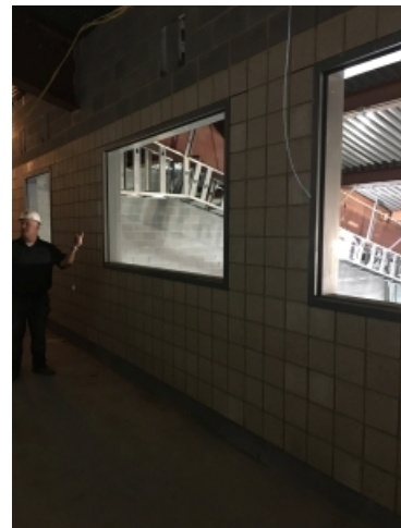
2018.09.25 – Upper level corridor into multipurpose room.