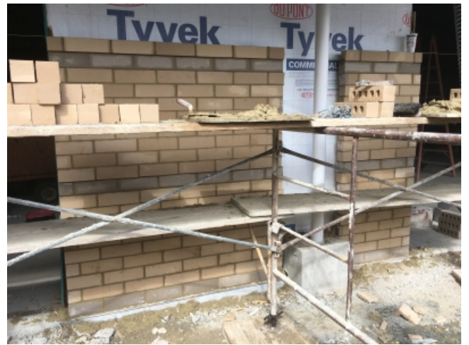
2018.10.11 – Brick installation at courtyard.