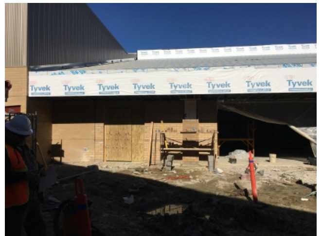
2018.10.23 – Brick at courtyard.