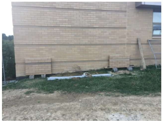
2018.10.02 – Second and third mock-up panels.