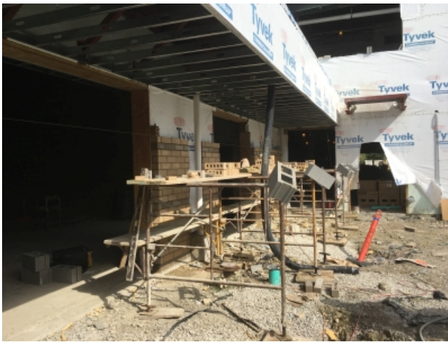
2018.10.11 – Brick installation at courtyard.