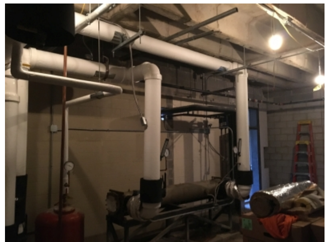
2018.10.09 – Insulated piping at Beechgrove chiller barrel.