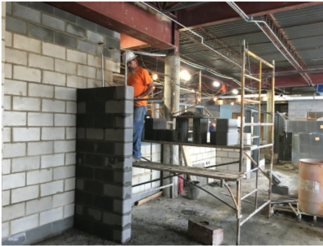
2018.09.25 – Upper level masonry installation.