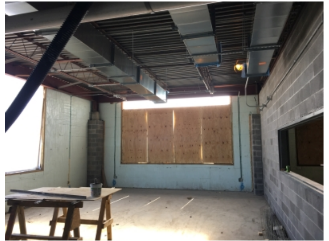
2018.10.23 – Upper level corner classroom.