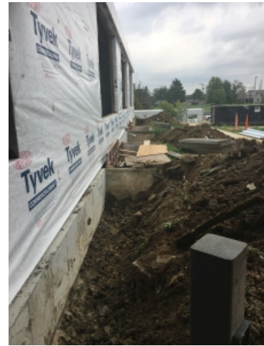
2018.10.02 – Brick ledge along south wall.