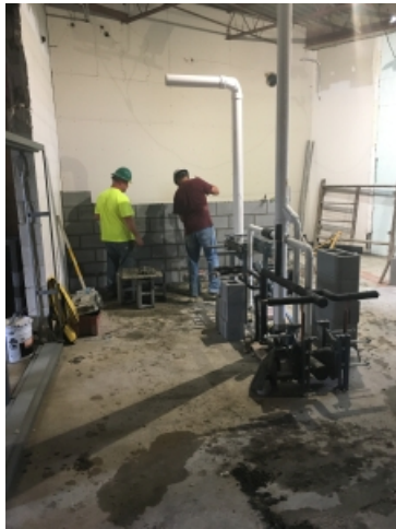
2018.10.02 – Masonry installation at staff restrooms.