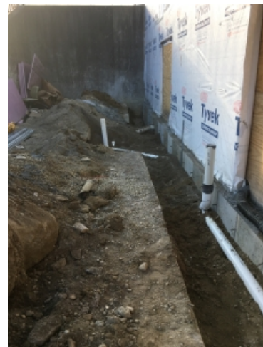
2018.10.09 – Downspout collector – east wall.