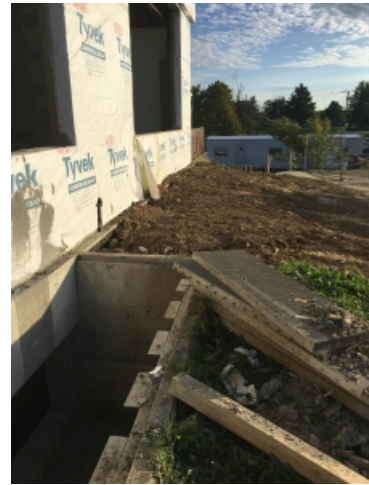
2018.10.09 – Backfill along south wall.