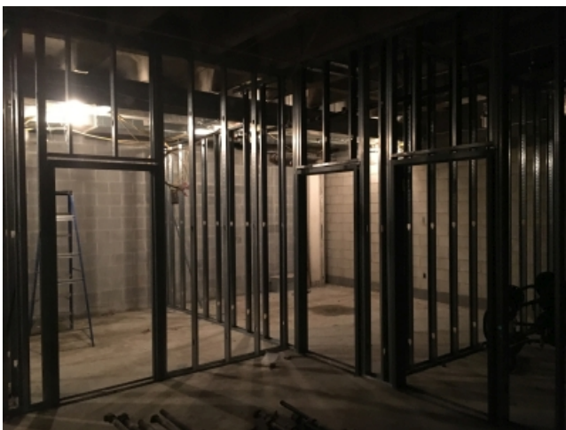
2018.10.09 – Career center framing.