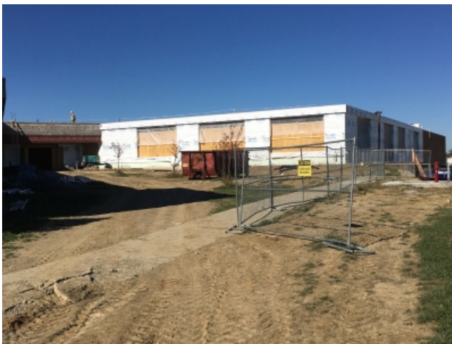
2018.10.23 – Temporary infill at window openings.