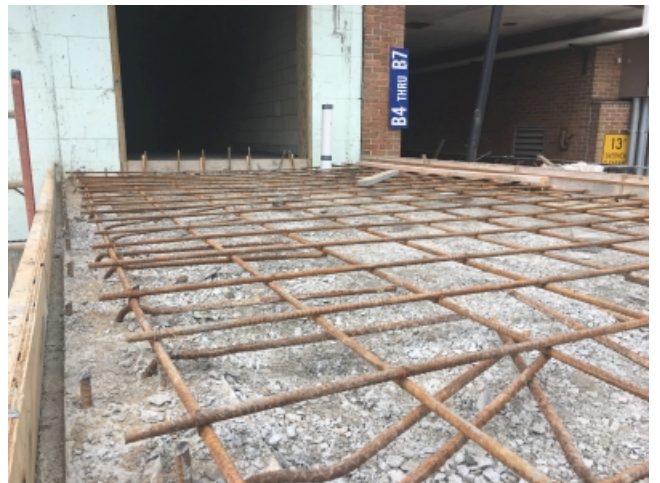
2018.10.02 – Reinforcing at east exterior exit landing.