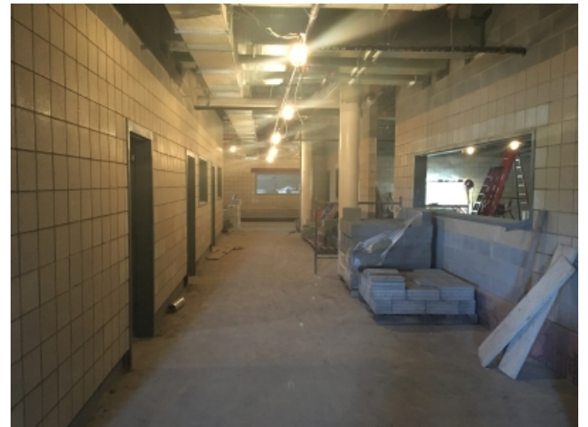
2018.10.02 – Upper level, north corridor.