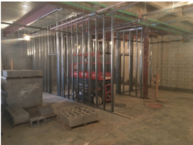
2018.10.02 – Framing at student resource area.