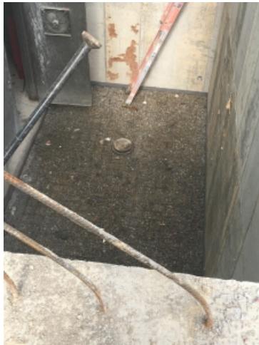
2018.10.02 – Basement access area well.