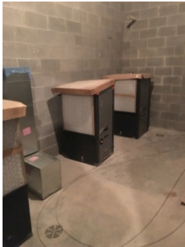
2018.10.23 – Upper level mechanical room.