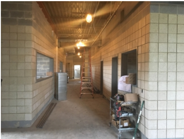
2018.10.02 – Upper level, south corridor.