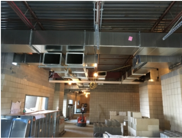
2018.10.23 – Upper level west corridor.