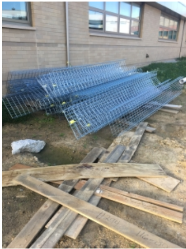
2018.10.09 – Cable tray delivery.