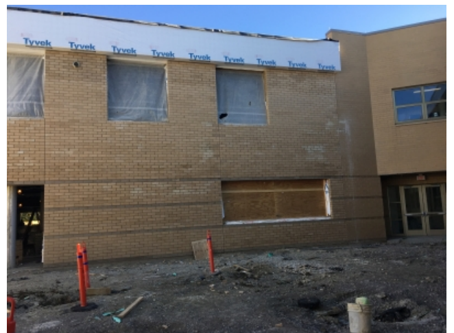
2018.10.23 – Brick at courtyard.