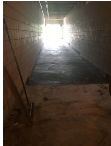
2018.10.02 – Band corridor ramp.