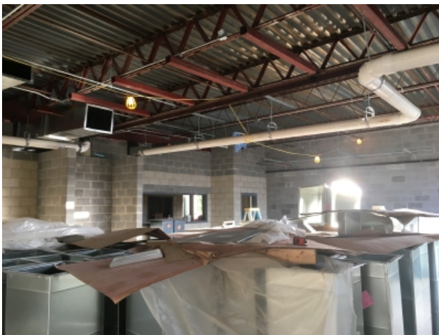
2018.10.09 – Roof overflow pipe installed.