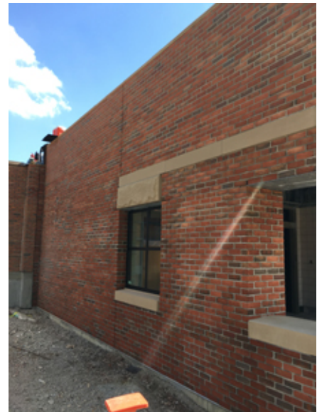
2018.10.08 – View of the north wall of the addition.