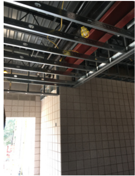
2018.10.08 – View of ceiling framing near the display case.