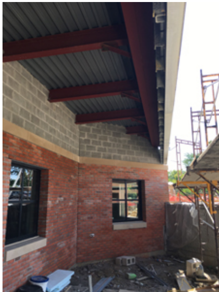
2018.10.01 – View under the entry canopy.