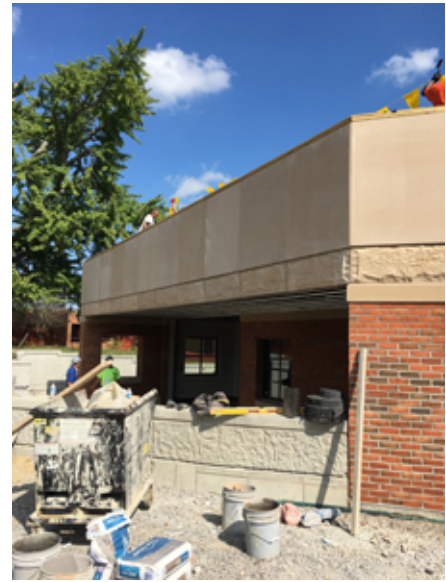
2018.10.08 – View of cast stone over the main entry canopy.