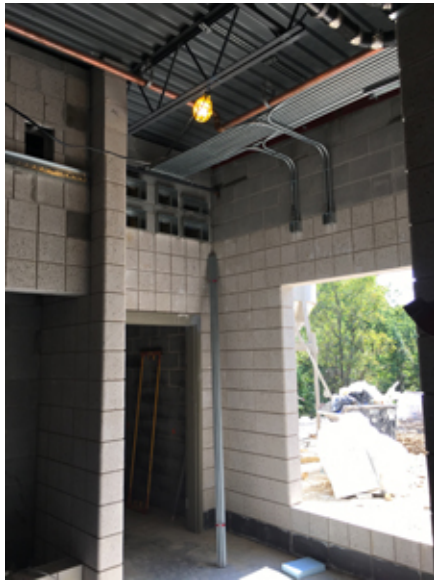
2018.10.01 – View of the Lobby Area near the Mechanical Room.