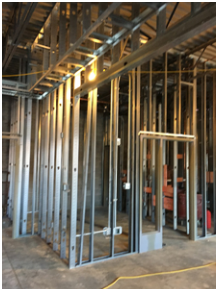
2018.10.01 – View of metal stud framing within the Office Area.