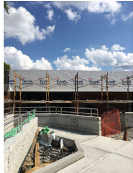
2018.10.01 – The framing and weather barrier has been installed at the entry canopy.