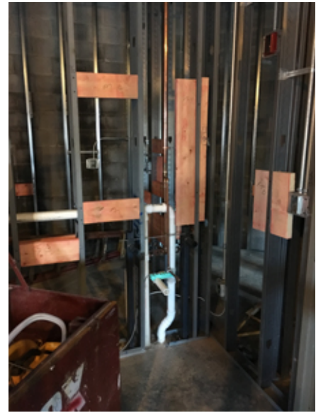
2018.10.01 – View of metal stud framing within the Office Area.