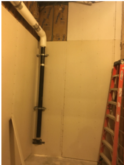
2018.10.23 – Insulation of the plumbing piping is in progress.