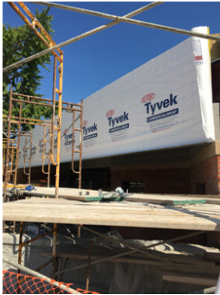
2018.10.01 – The framing and weather barrier has been installed at the entry canopy.