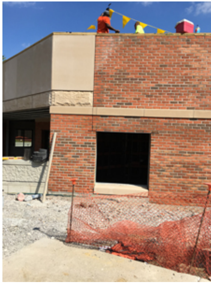
2018.10.08 – View of cast stone over the main entry canopy.