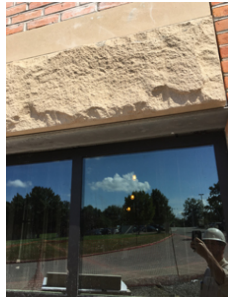
2018.10.01 – Detail of the cast stone over the Conference Room window.