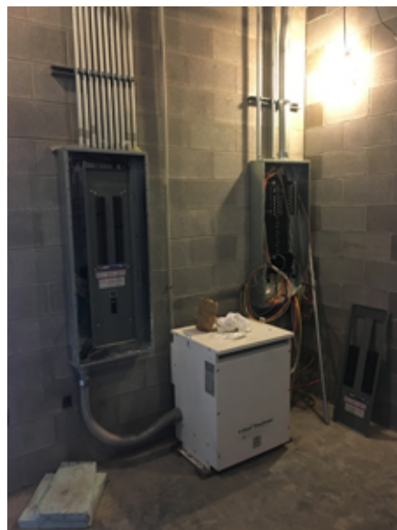
2018.10.23 – The electric panels and transformer have been installed.