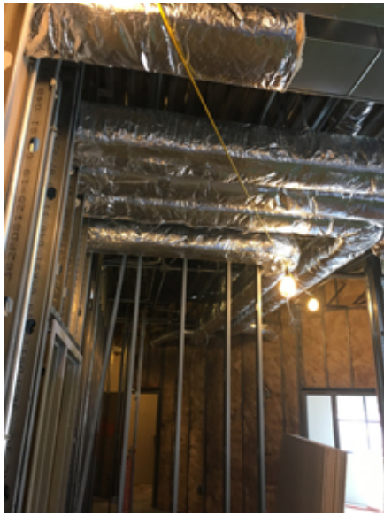
2018.10.23 – View of insulated ductwork installed in the office area.