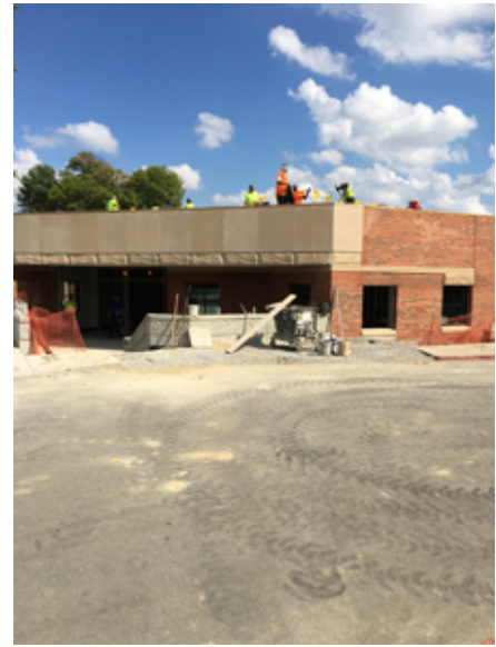
2018.10.08 – View of the addition as seen from the loop drive.