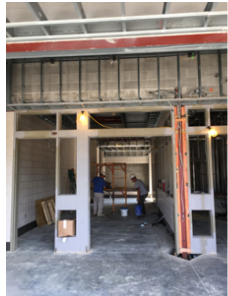
2018.10.08 – View of secure vestibule from the exterior.