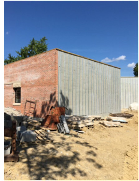
2018.10.01 – Installation of the exterior masonry is nearly complete.