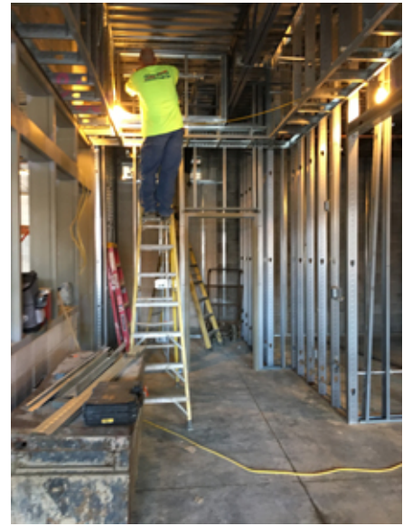
2018.10.01 – View of metal stud framing within the Office Area.