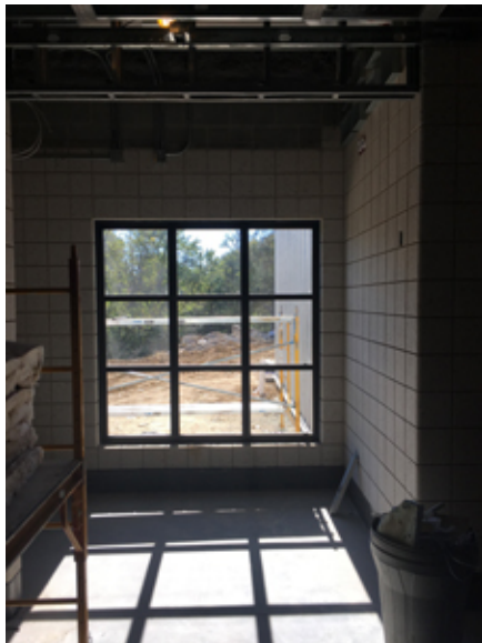
2018.10.23 – View of window at south elevation as seen from the display case.