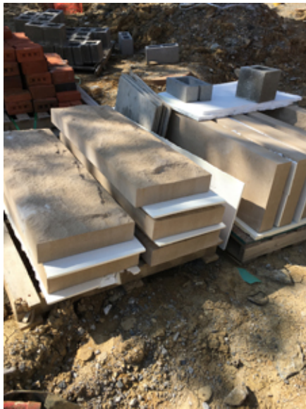
2018.10.01 – Cast stone for installation over the entry canopy.