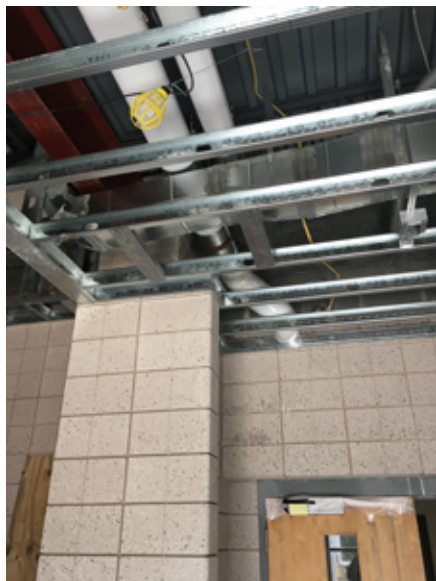
2018.10.23 – View of ceiling framing near the display case.