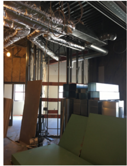
2018.10.23 – View of insulated ductwork installed in the office area.