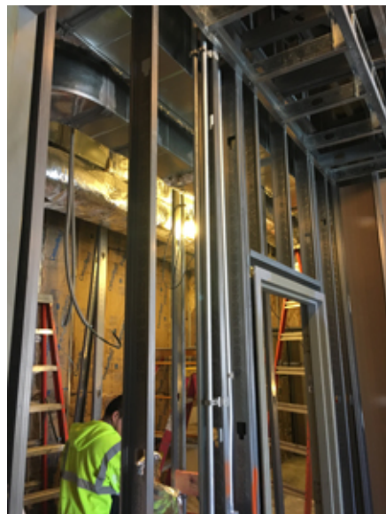
2018.10.23 – View of insulated ductwork installed in the office area.