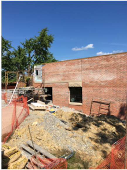
2018.10.01 – Installation of the exterior masonry is nearly complete.