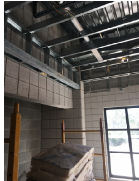
2018.10.23 – View of ceiling framing at the display case.