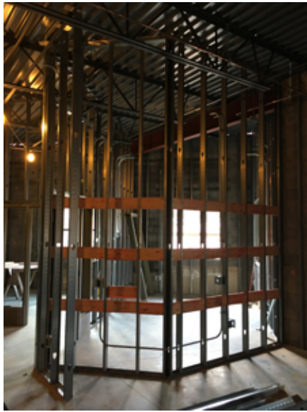
2018.10.01 – View of metal stud framing within the Office Area.