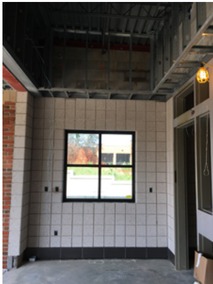
2018.10.08 – View looking north from the Secure Vestibule