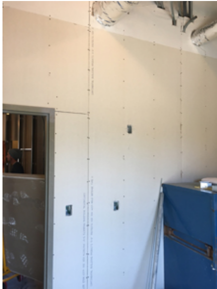
2018.10.23 – Installation of gypsum board has started.