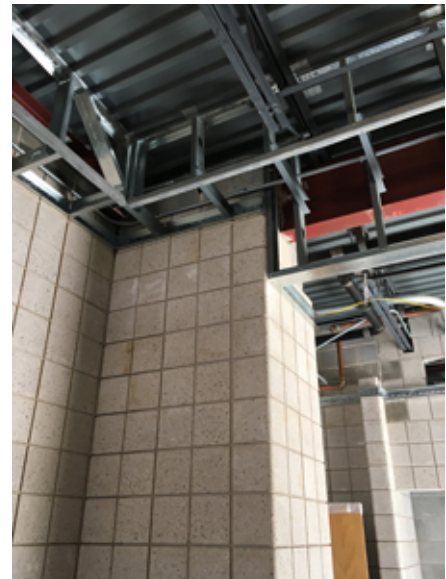
2018.10.01 – View of bulkhead in the Lobby area.