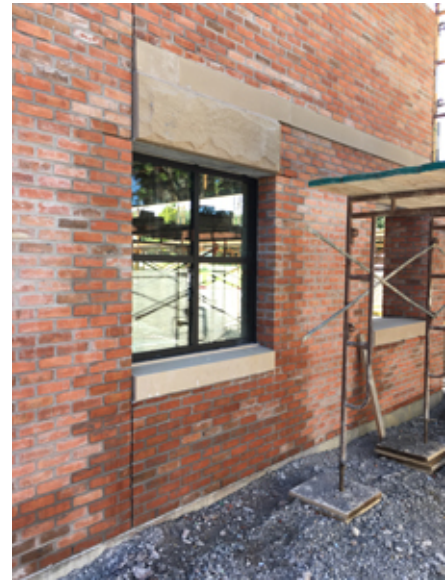
2018.10.01 – View of the masonry on the north side of the building.