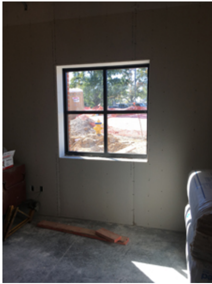
2018.10.23 – Installation of gypsum board has started.