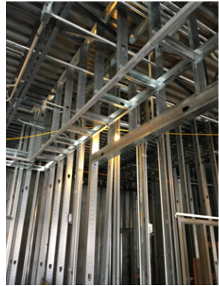
2018.10.08 – Installation of the office framing continues.