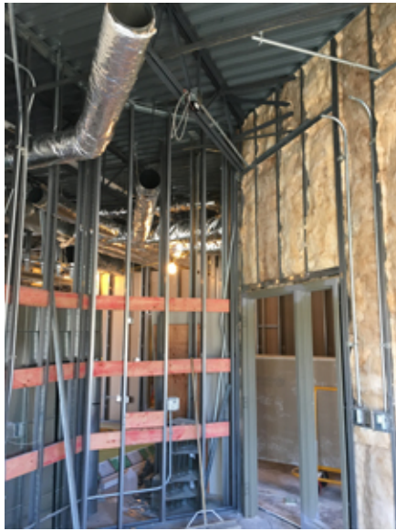
2018.10.23 – View of the ductwork and sound attenuation insulation.