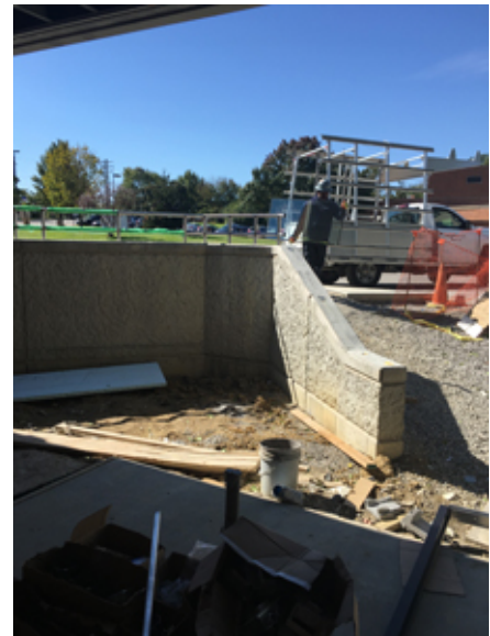
2018.10.23 – Installation of the stainless steel handrails continues.