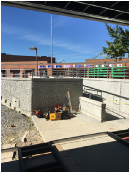
2018.10.23 – Installation of the stainless steel handrails continues.