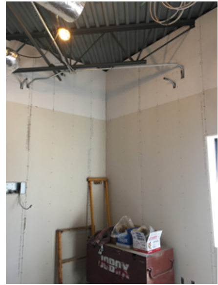
2018.10.23 – Installation of gypsum board has started.