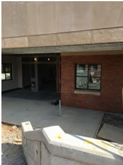
2018.10.08 – View of cast stone over the main entry canopy.