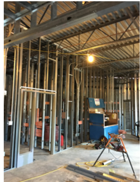
2018.10.01 – View of metal stud framing within the Office Area.