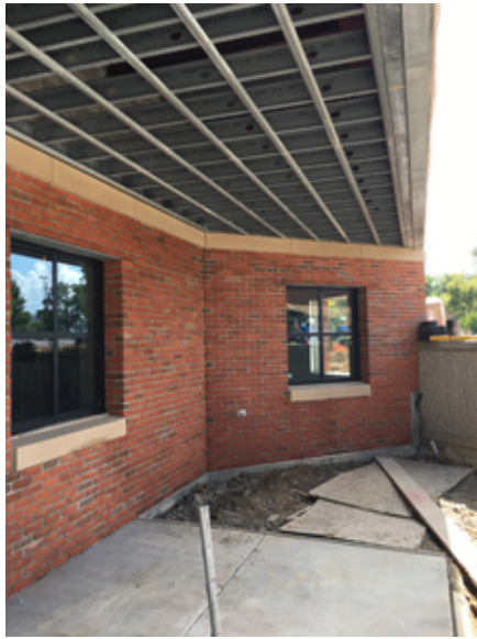
2018.10.08 – View of soffit framing at main entry canopy.