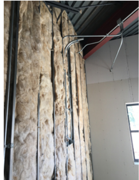
2018.10.23 – Sound attenuation insulation has been installed.