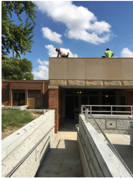
2018.10.08 – View of the new entrance as seen from the ADA accessible ramp.