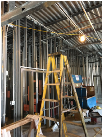
2018.10.08 – Installation of the office framing continues.