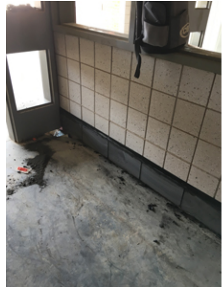
2018.10.08 – Installation of the structural glazed tile base in the Lobby Area is in progress.