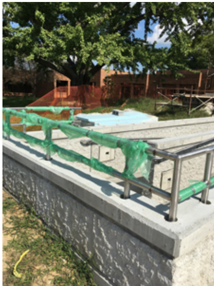
2018.10.01 – Installation of the stainless steel handrails and guards has started.