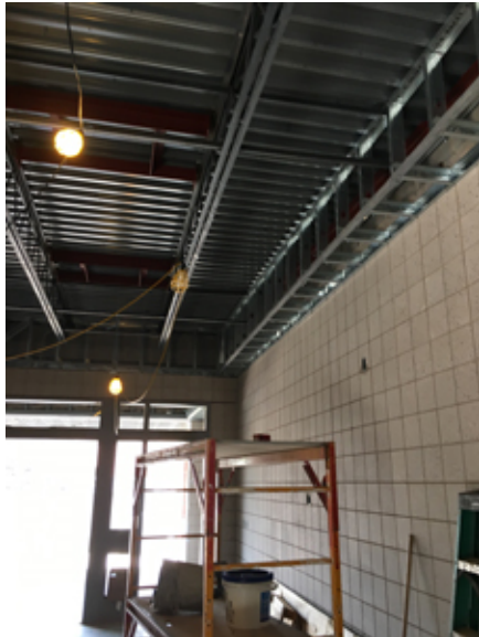
2018.10.08 – View of bulkhead framing in the Lobby Area.