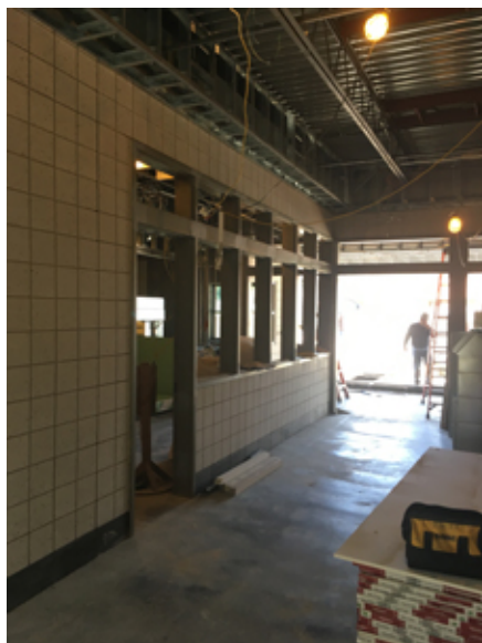
2018.10.23 – View of Lobby Area looking towards the entry area.