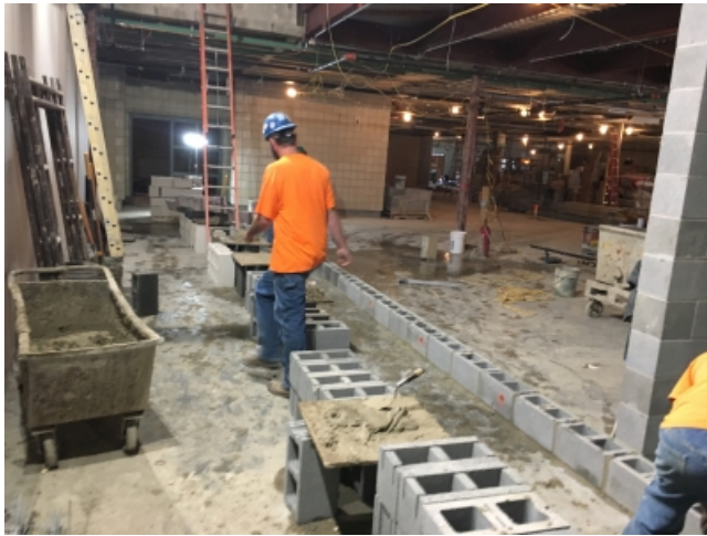
2018.09.11 – South wall of monumental stair.