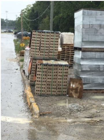
2018.09.17 – Delivered brick.