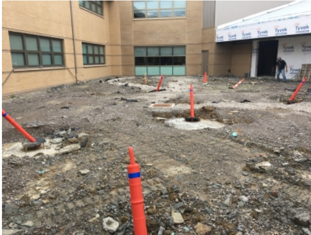
2018.09.11 – Shade canopy footings.

32.01: 2018.09.17 – Stained concrete sample panels were on-site for consideration.