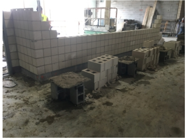
2018.09.17 – East corridor at upper level.