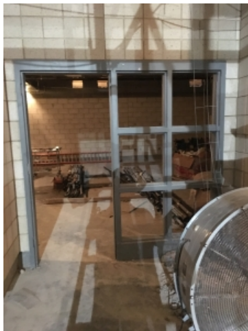
2018.09.17 – Career Center entrance.