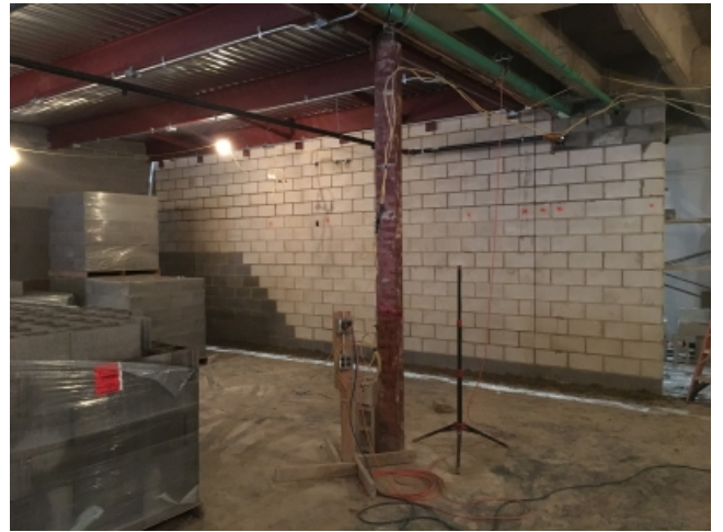
2018.09.17 – South wall of monumental stair.