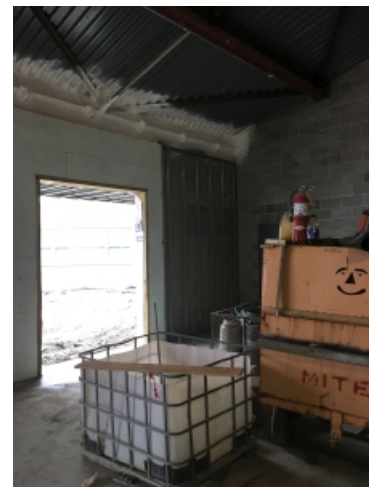
2018.09.17 – Intumescent coating on spray insulation.