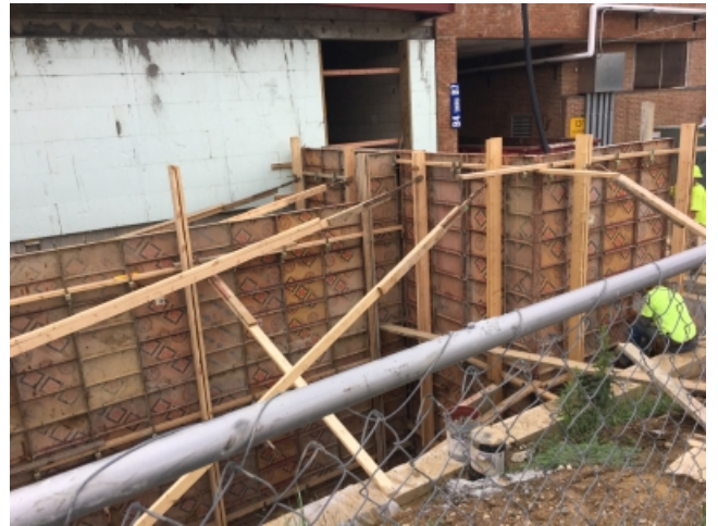
2018.09.11 – Forms at exterior steps.