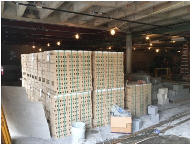
2018.09.17 – Brick staged for courtyard installation.