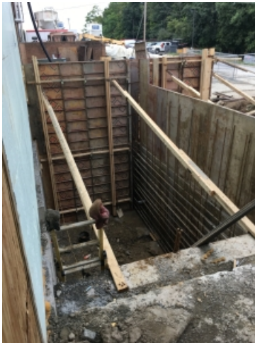
2018.09.11 – Forms at exterior steps.