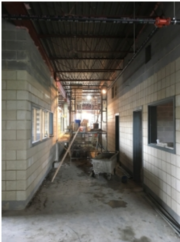
2018.09.17 – South corridor at upper level.