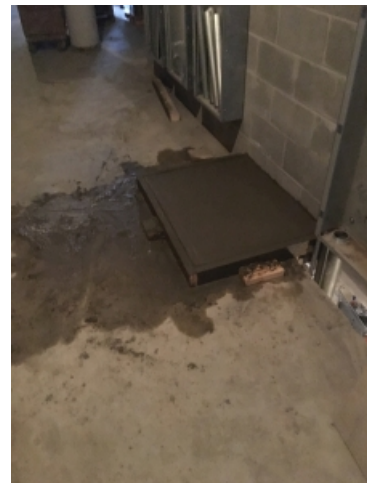
2018.09.17 – Housekeeping pad at upper level.