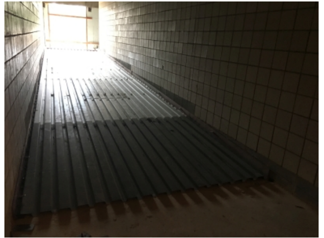
2018.09.11 – Ramp outside band room.