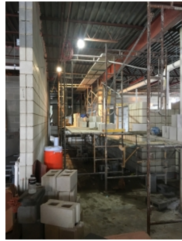
2018.09.17 – South corridor at upper level.