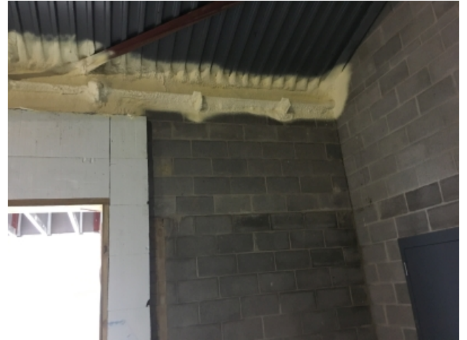
2018.09.11 – Spray insulation at multi-purpose room.