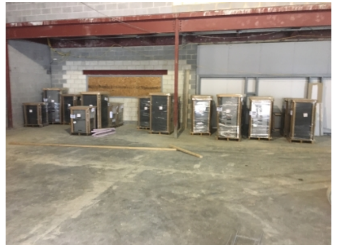
2018.09.11 – Staged heat pumps.