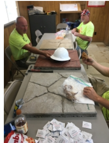
2018.09.17 – Stamped concrete samples.