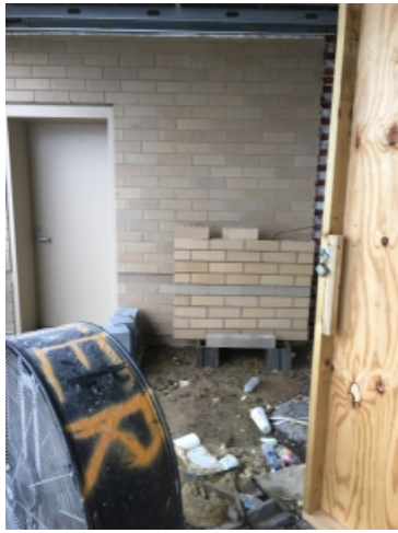
2018.09.17 – Brick mock-up panel.