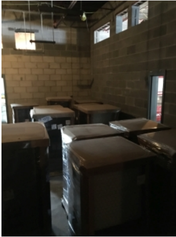
2018.09.17 – Heat pumps staged at upper level.