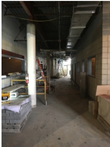
2018.09.17 – North corridor at upper level.