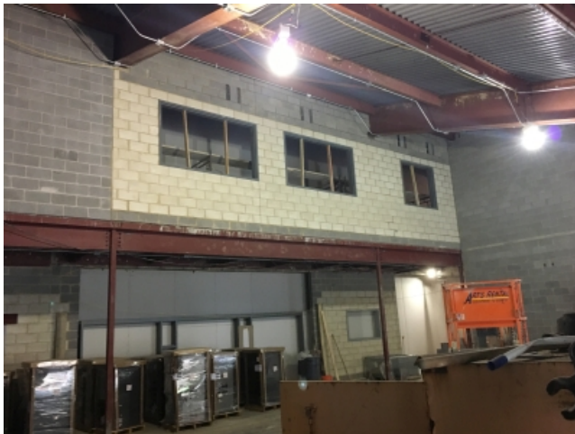
2018.09.11 – Masonry at multi-purpose room.