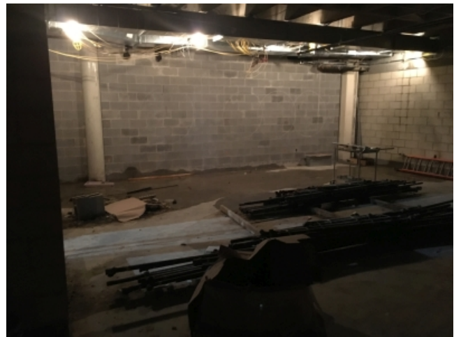
2018.09.17 – Career Center.