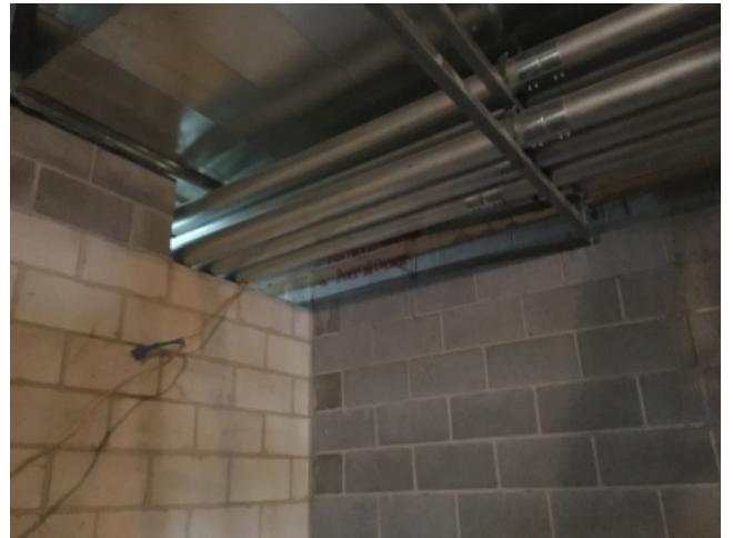
2018.09.17 – Bus duct repair.