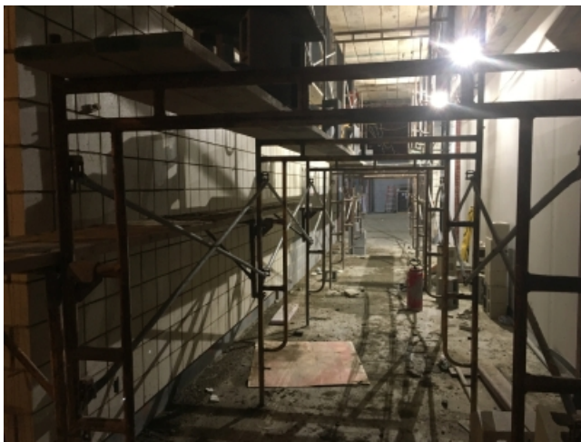
2018.09.17 – South wall of monumental stair.