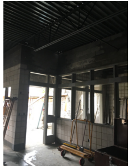
2018.09.10 – View from the future office area.