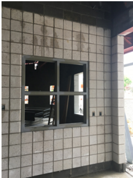
2018.09.10 – View from vestibule