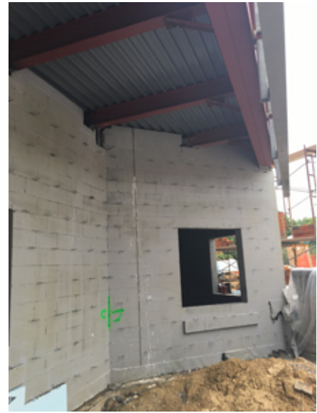
2018.09.10 – The exterior concrete masonry units were coated a second time with the air and moisture barrier after it was determined the initial coating was too thin.