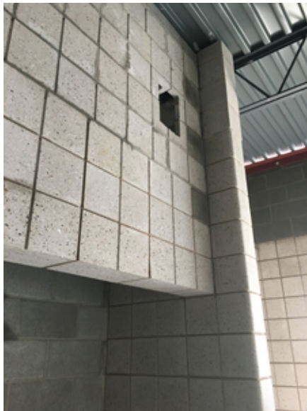
2018.09.10 – Masonry work continues on the interior

16.01: 2018.09.10 – Rough-in work continues throughout.