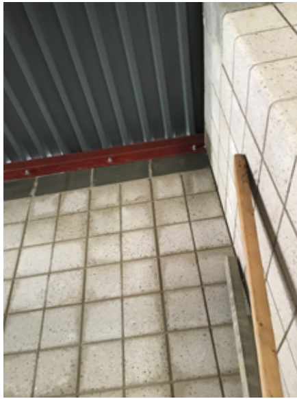
2018.09.10 – View of roof deck and perimeter support angle.