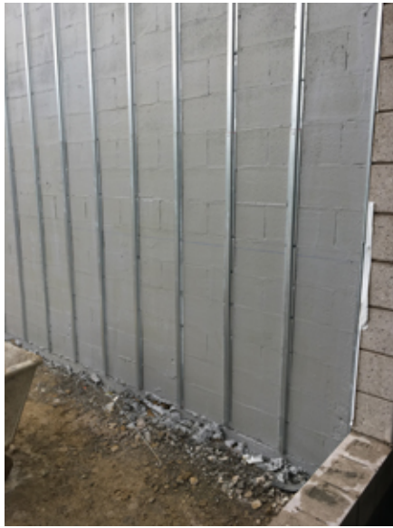
2018.09.10 – Metal furring has been installed for the prefinished metal siding.