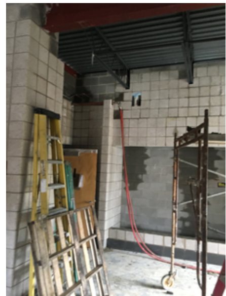
2018.09.10 – View of the lobby looking towards the display case.