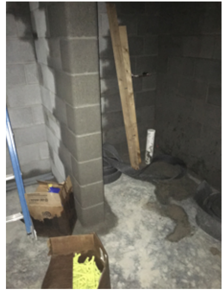
2018.09.10 – View of mechanical room at location of janitor's sink area.