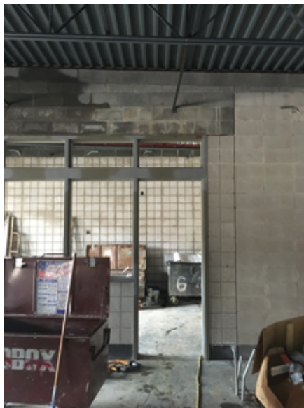
2018.09.10 – Interior view of the office area.