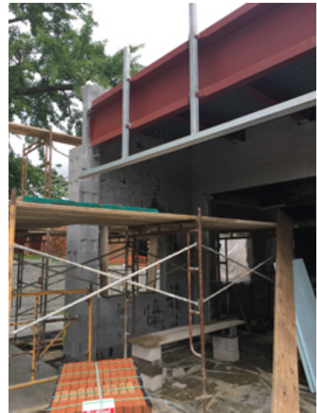
2018.09.10 – Support framing for the cast stone over the entry has been installed.