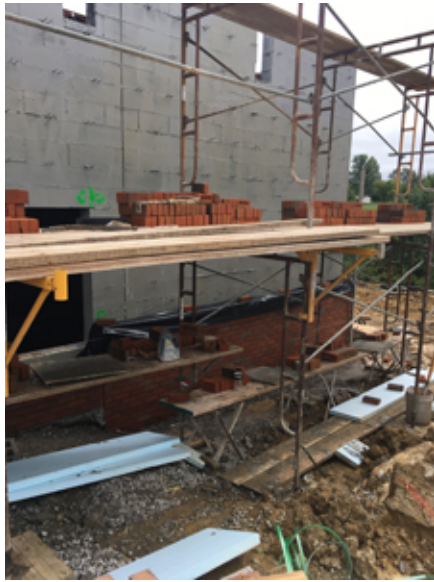
2018.09.10 – Installation of the face brick has started.