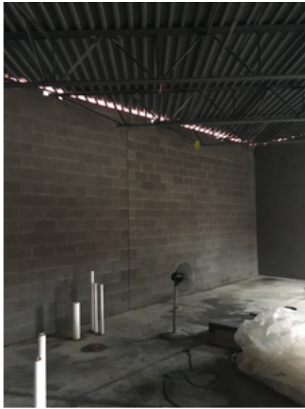
2018.09.10 – Interior view of the office area.