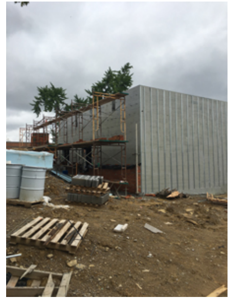
2018.09.10 – Metal furring has been installed for the prefinished metal siding.