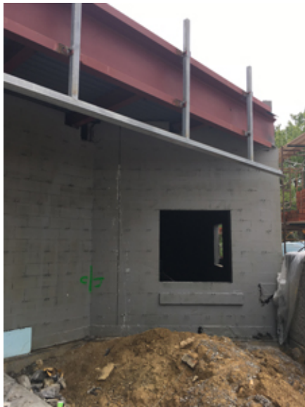
2018.09.10 – Support framing for the cast stone over the entry has been installed.