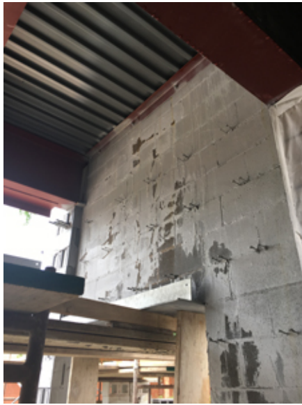
2018.09.10 – The second coat of the air and moisture barrier washed off due to a sudden rain. The contractor stated this would be recoated.