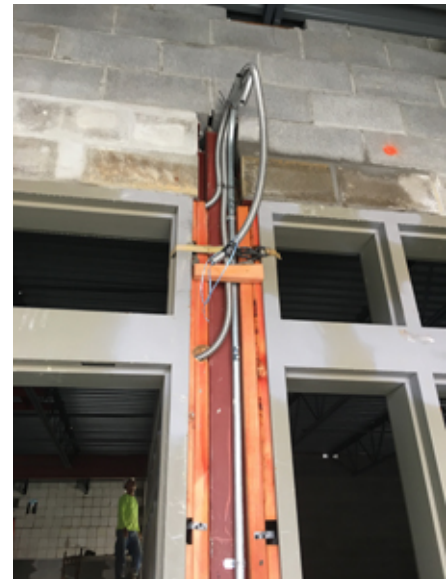
2018.09.10 – Electrical rough-in continues throughout the building.