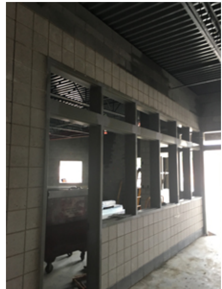
2018.09.10 – View of the lobby with the roof decking installed.