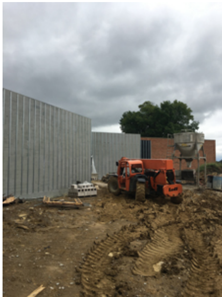
2018.09.10 – Metal furring has been installed for the prefinished metal siding.