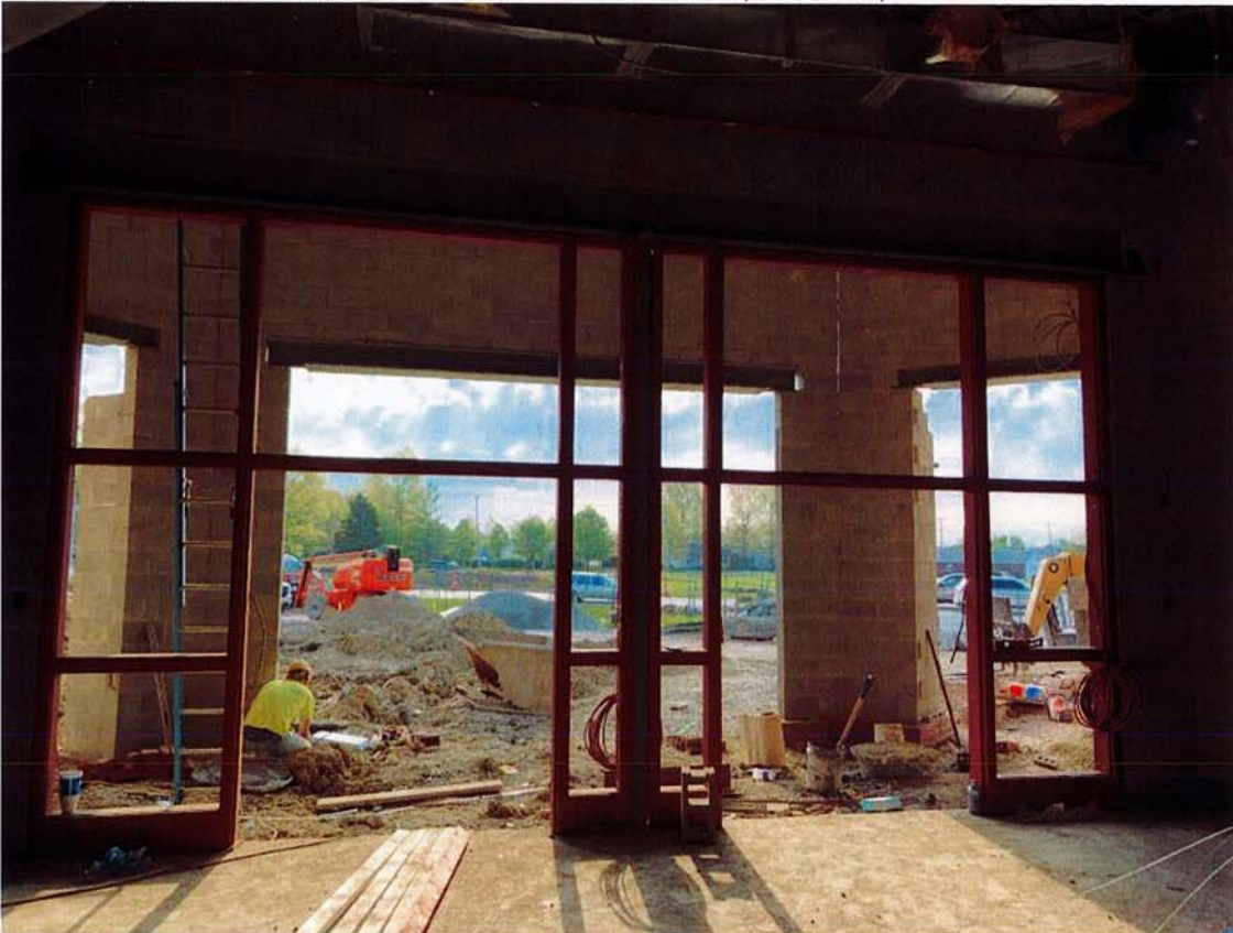
New main entrance door frames. (5-2-2018)