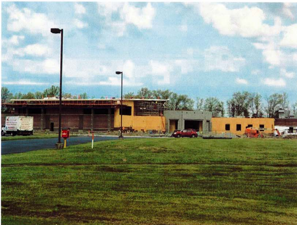
Gymnasium and Entrance Addition taking shape. (5-2-2018)