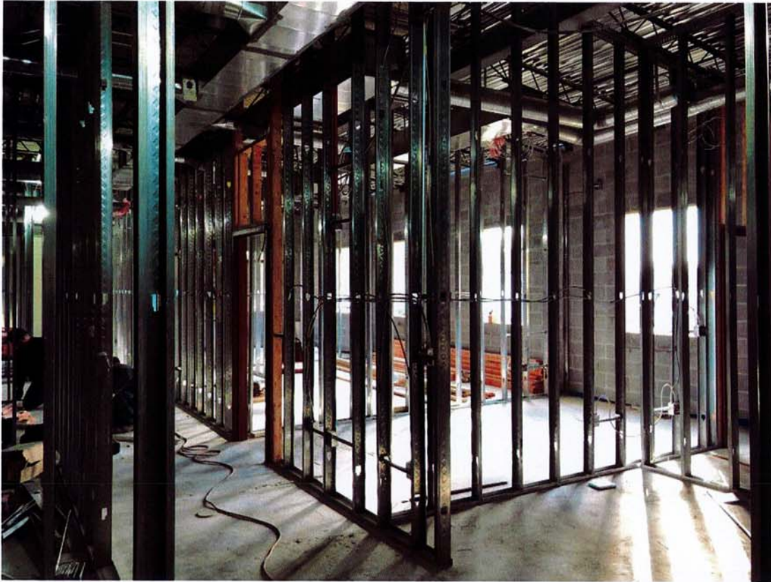
New wall framing at Expanded Administration Suite. (5-2-2018)