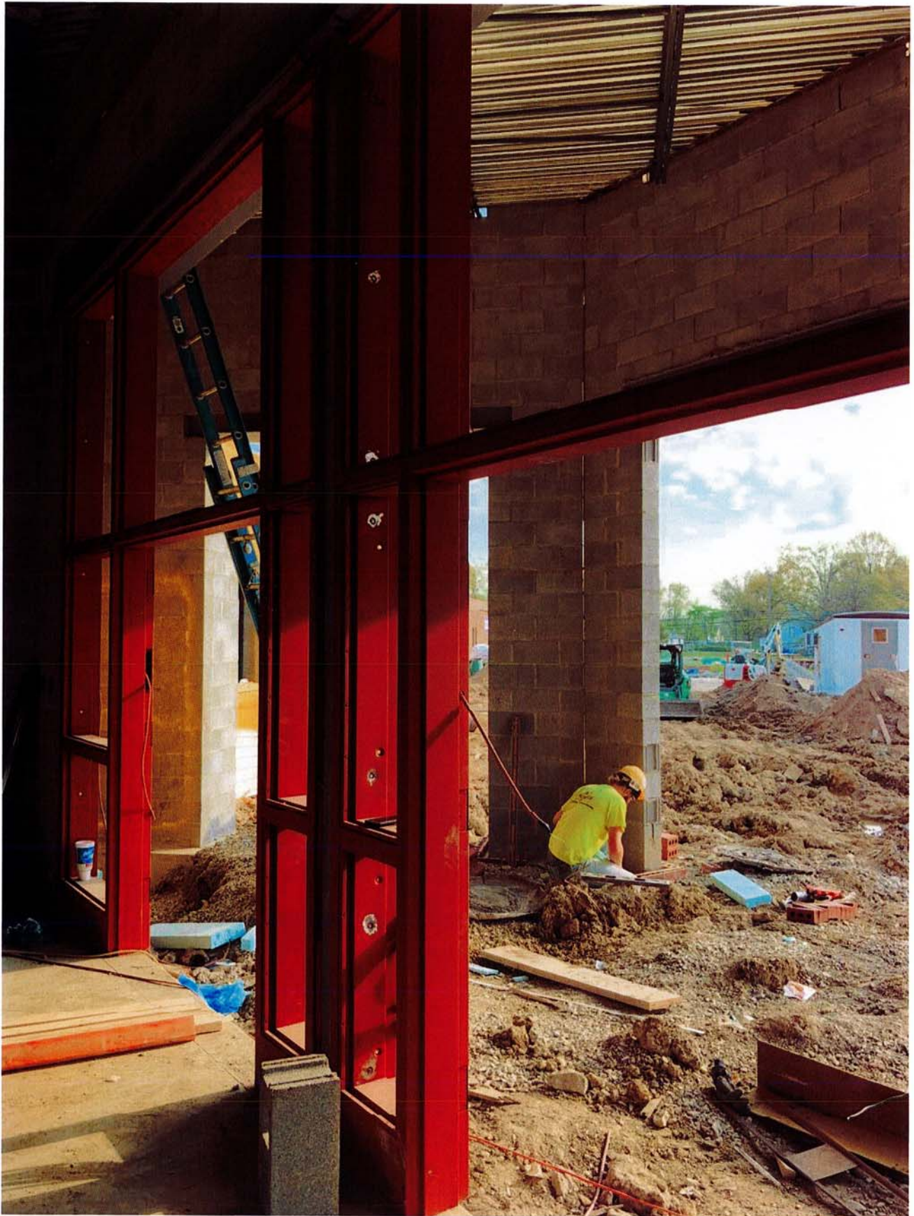
View out new main entrance doors to covered exterior vestibule. (5-2-2018)