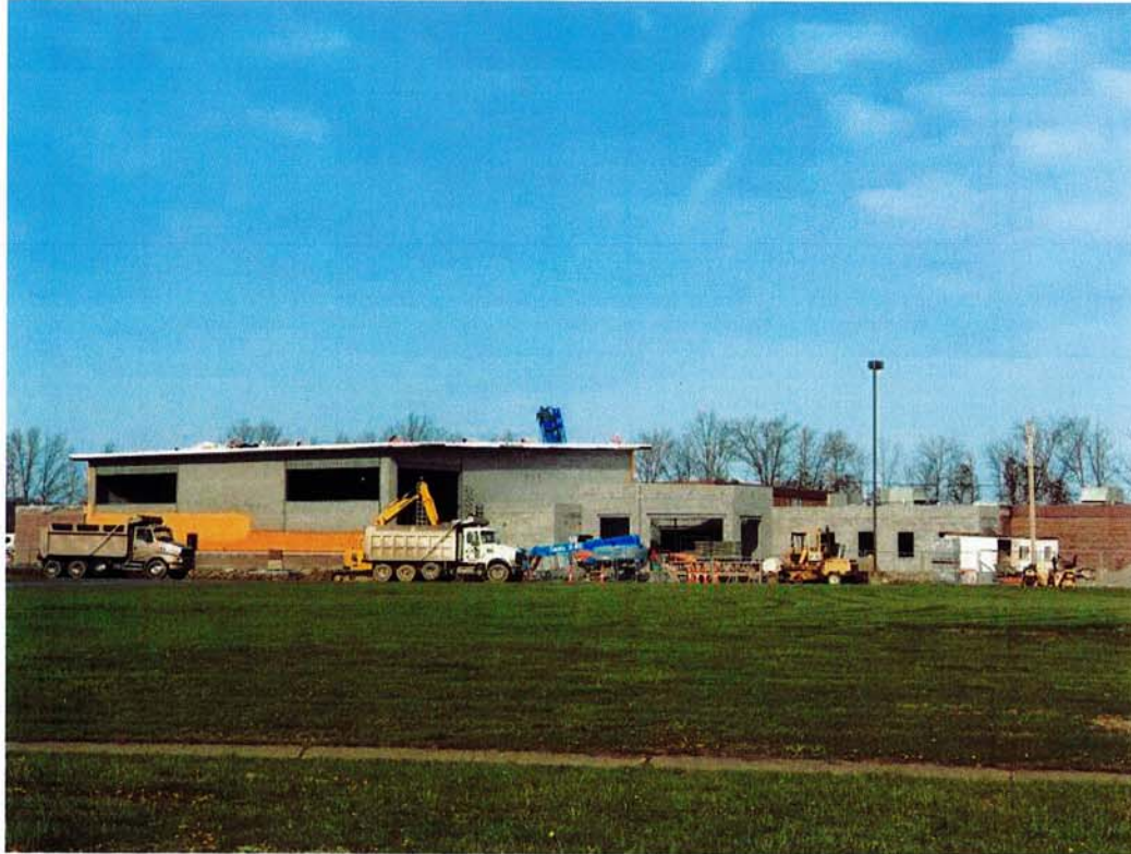
Gymnasium and Entrance Addition taking shape. (4-6-2018)