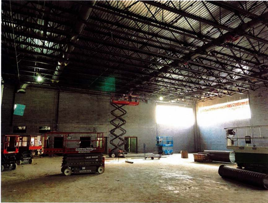
Interior View of New Gym. (5-2-2018)