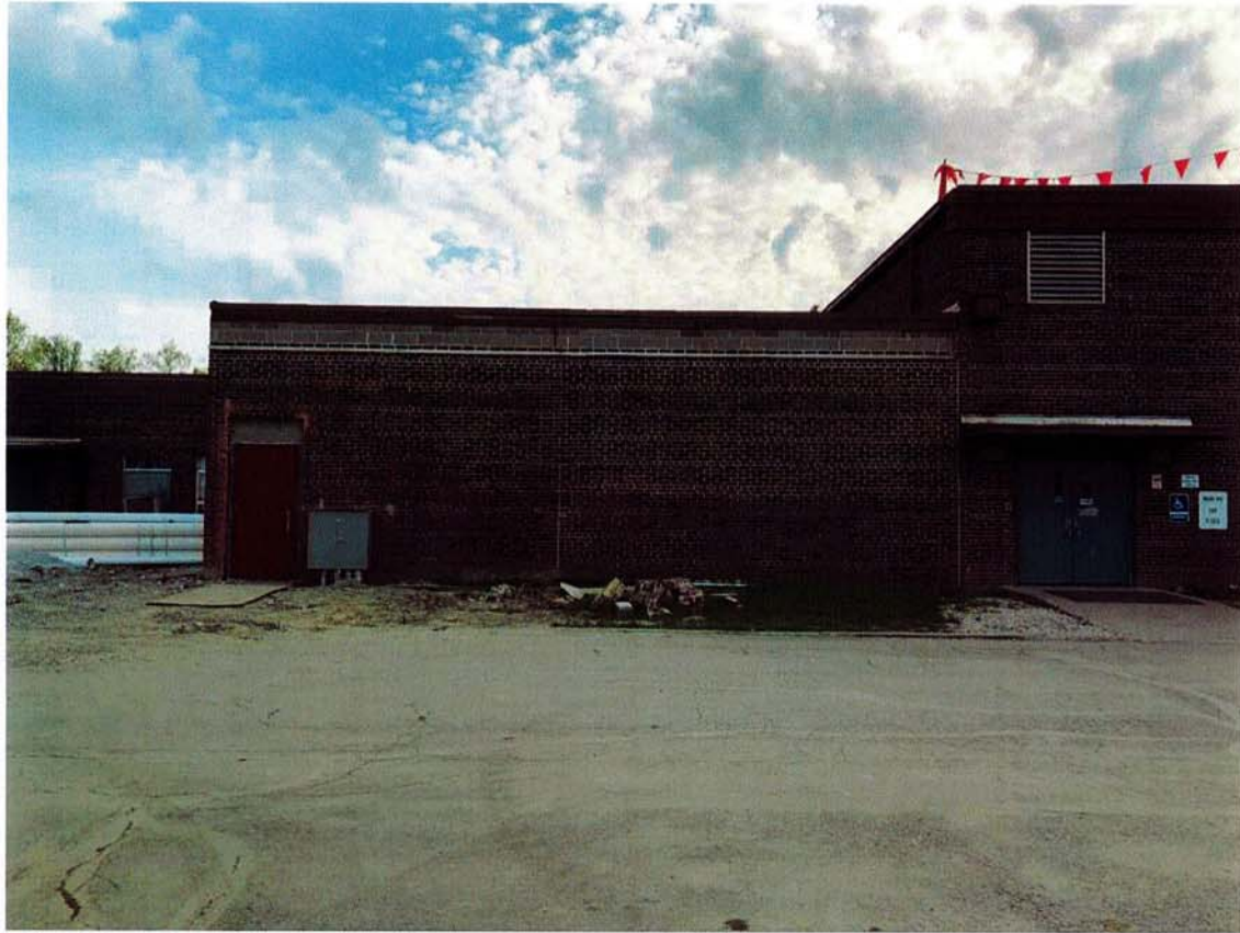
West Elevation of school – EH test area of new Brick Veneer Cornice. (5-2-2018)