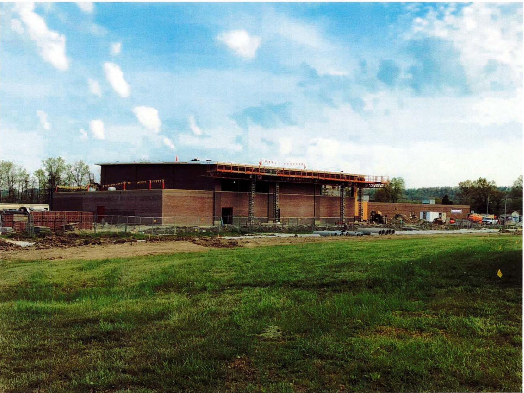
South West Elevation of Gymnasium Addition. (5-2-2018)