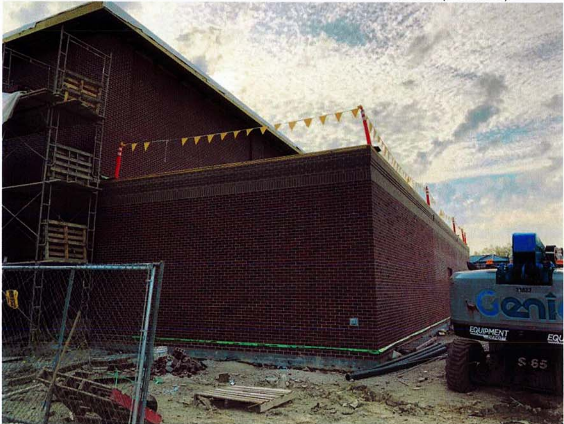
Closer view of locker room addition off new Gym (5-2-2018)