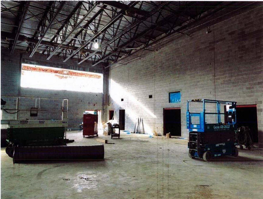
Interior View of New Gym. (5-2-2018)