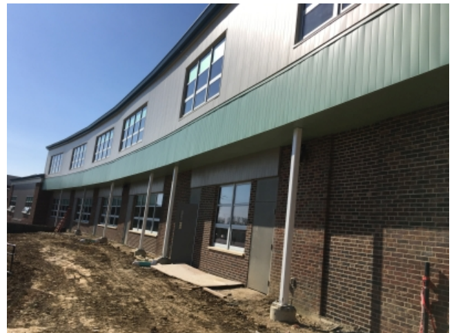
2018.03.12 – East elevation.