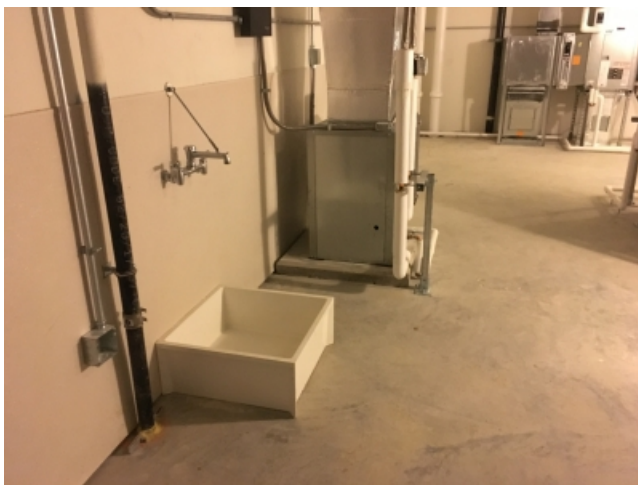
2018.03.12 – Second floor mech room mop sink.