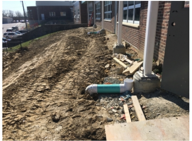
2018.03.12 – Downspout collector at East elevation.