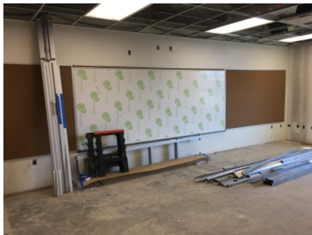
2018.03.12 – White board and tack boards.