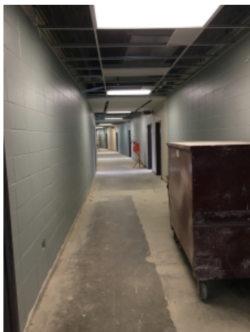
2018.03.12 – Corridor lights.