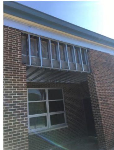
2018.03.12 – Outside of middle stair awaits siding.