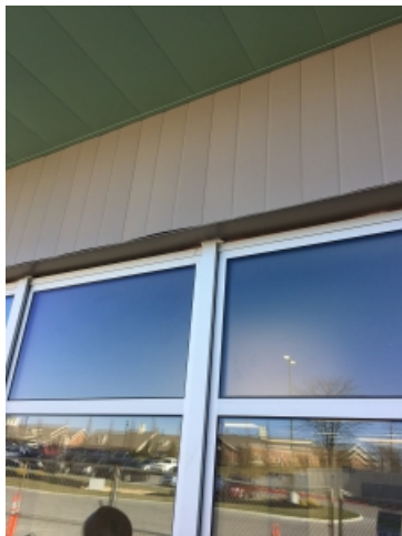
2018.03.12 – Unacceptable undulation at siding.