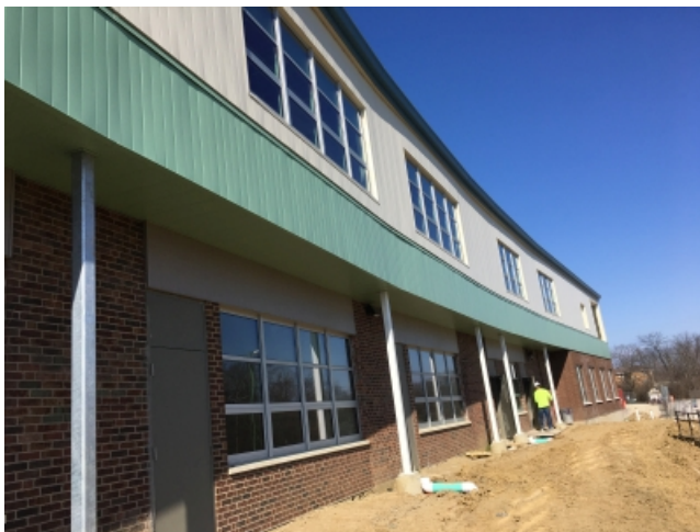
2018.03.12 – East elevation – North end.