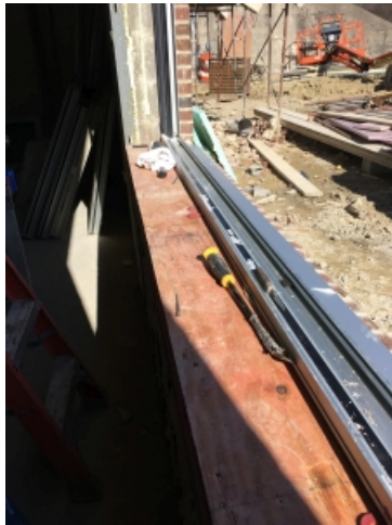
2018.03.12 – Start of final window installation.