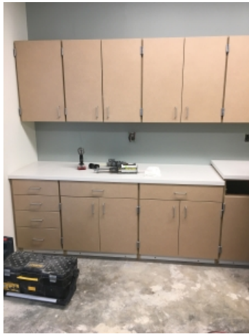
2018.03.15 – Casework at work room.