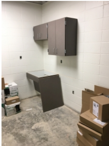
2018.03.15 – Resource classroom casework.