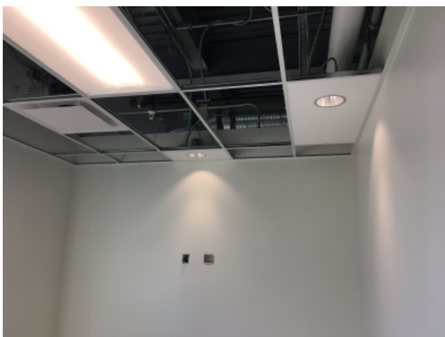
2018.03.12 – Conference room lights.

31.01: 2017.03.12 – The east classroom walk-out area was rough-graded.