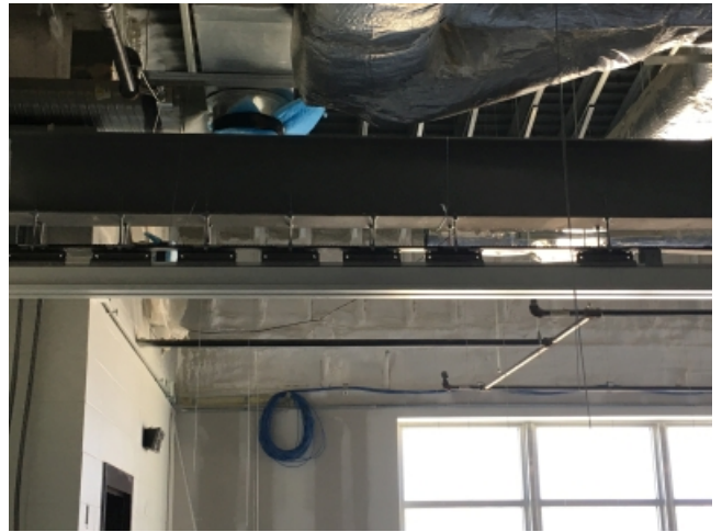
2018.03.15 – Operable partition track.