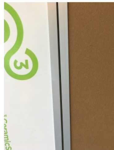
2018.03.12 – Gap between display boards.