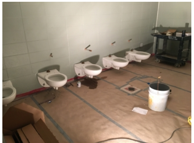
2018.03.12 – Second floor toilet fixtures.