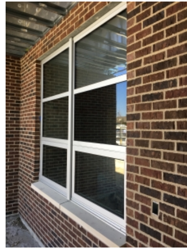
2018.03.12 – Window outside middle stair.