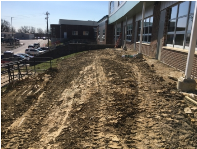
2018.03.12 – Grading along East elevation.