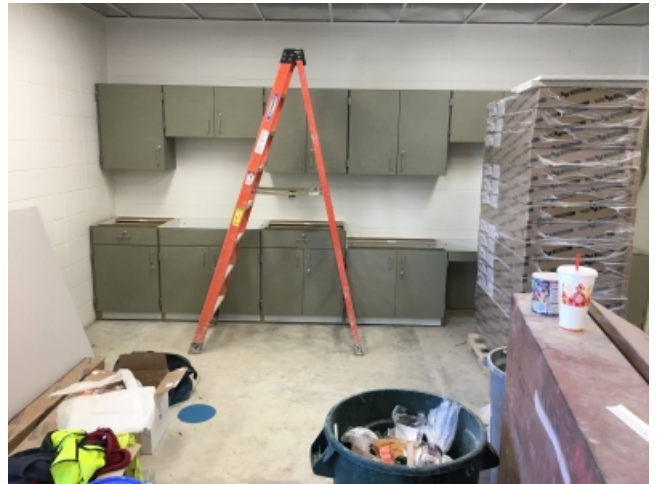
2018.03.15 – Science classroom casework.