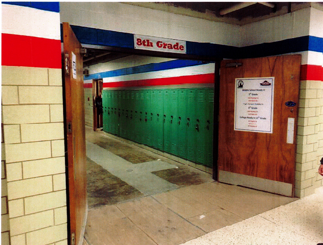
Concrete has been poured at trenches at corridors and exploratory work at modified fire wall. (2-7-2018)