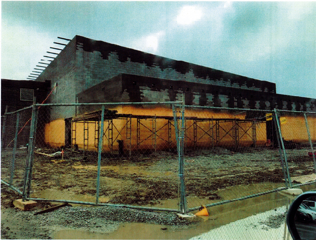
North/West corner of Gymnasium & Locker Room Addition in progress. (2-7-2018)