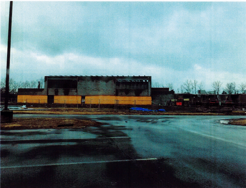
South Elevation of Gymnasium & Locker Room Addition in progress. (2-7-2018)