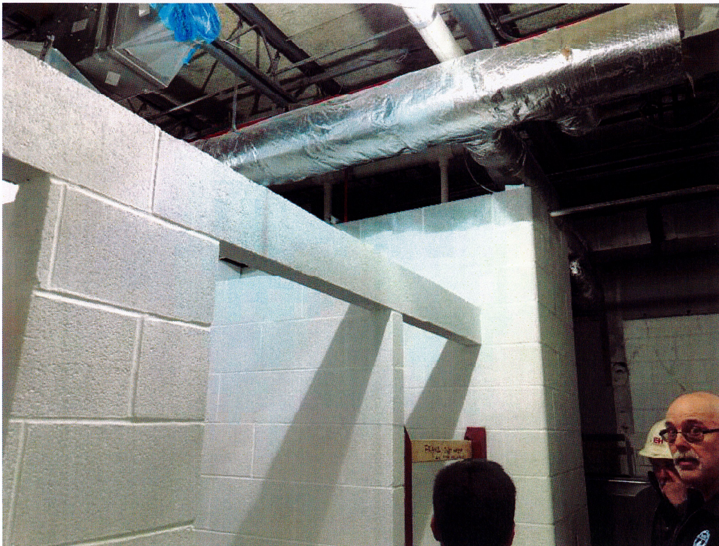
Interior View of Arts Corridor Restroom in progress. (2-7-2018)