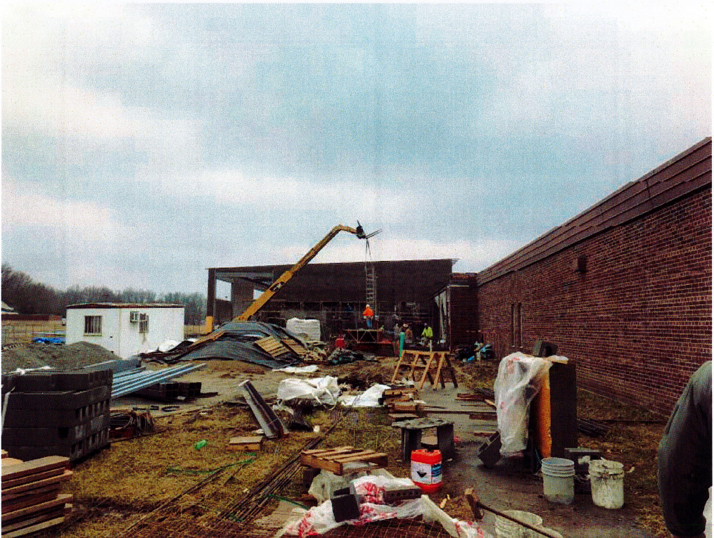
East Elevation of Gymnasium Addition in progress. (2-7-2018)