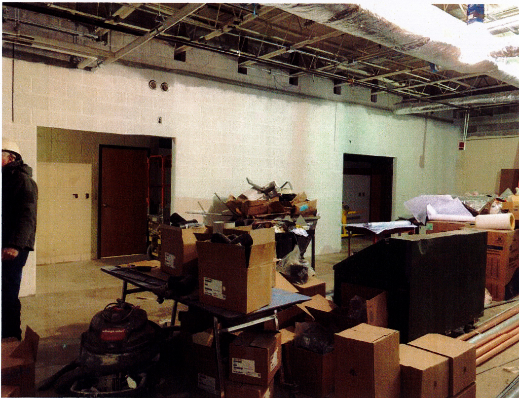
New Project Lead the Way Lab 508 in progress. (2-7-2018)