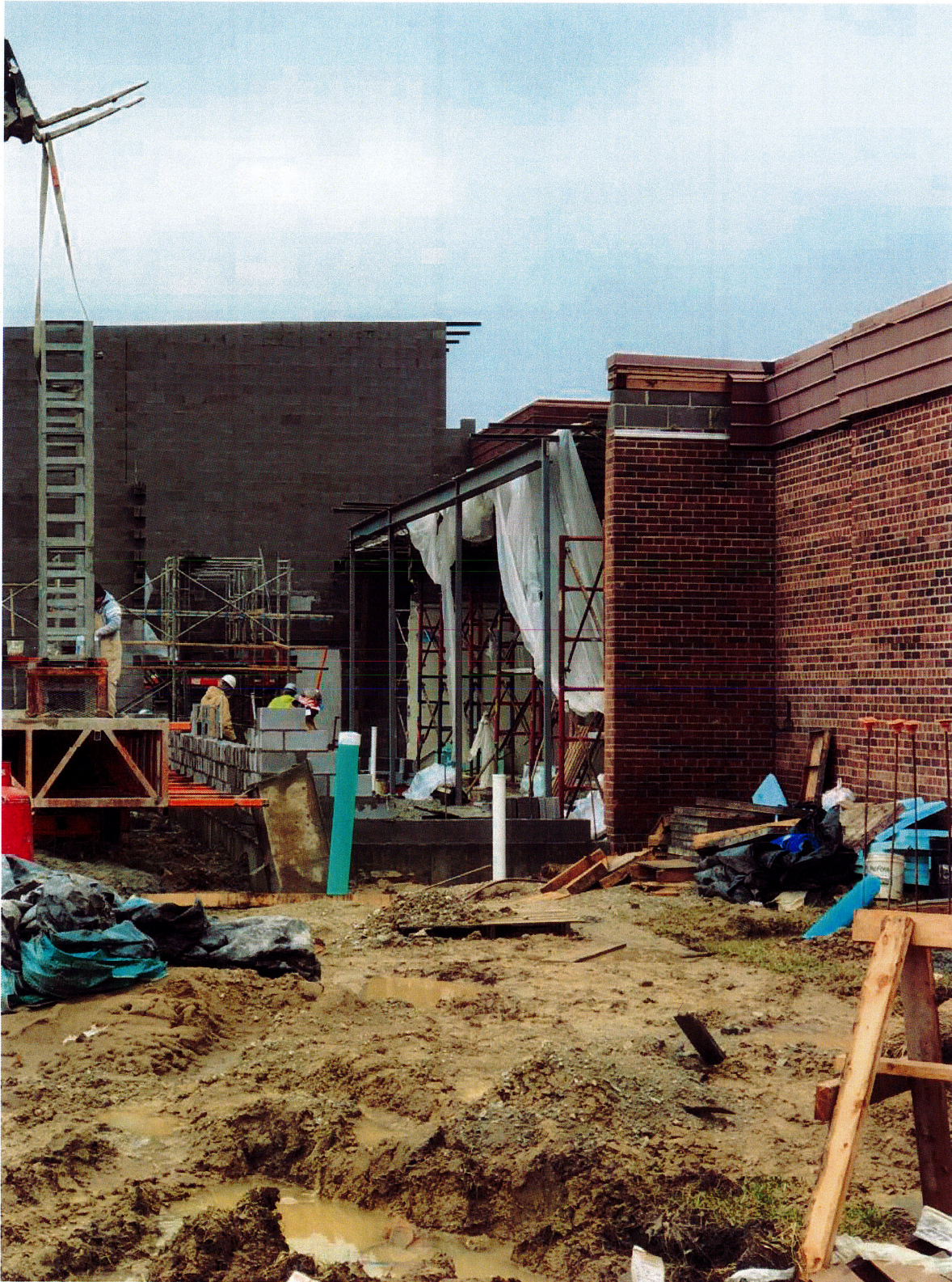
Administration Suite expansion – masonry work and steel erection in progress. (2-7-2018)