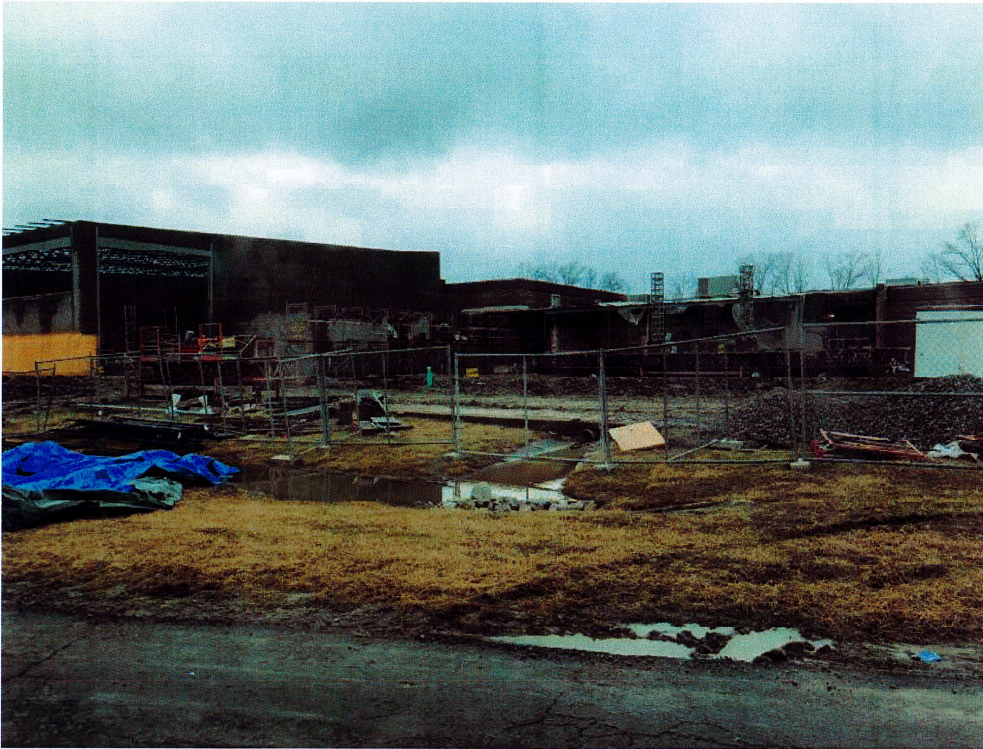
South/East view of Gymnasium Addition and Front Entrance in progress. (2-7-2018)