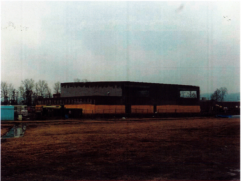
South/West corner of Gymnasium & Locker Room Addition in progress. (2-7-2018)