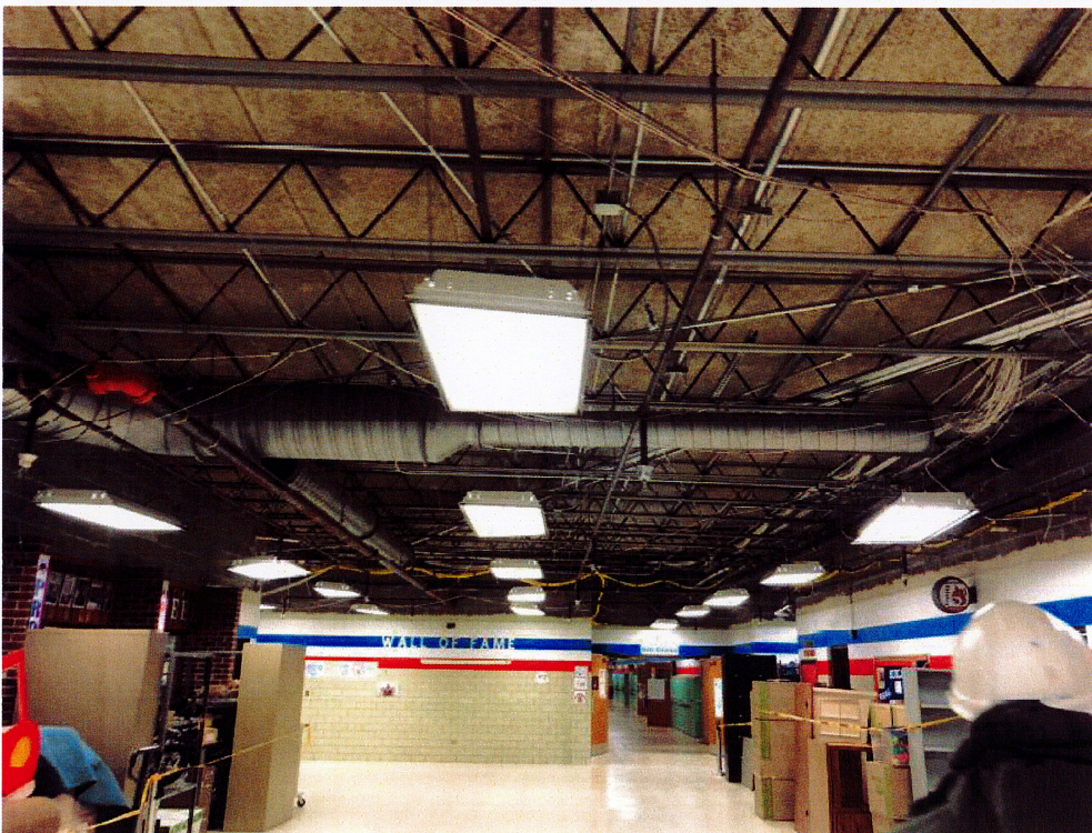
Interior View of The Commons – Ductwork Routing is being installed above corridors. (2-7-2018)