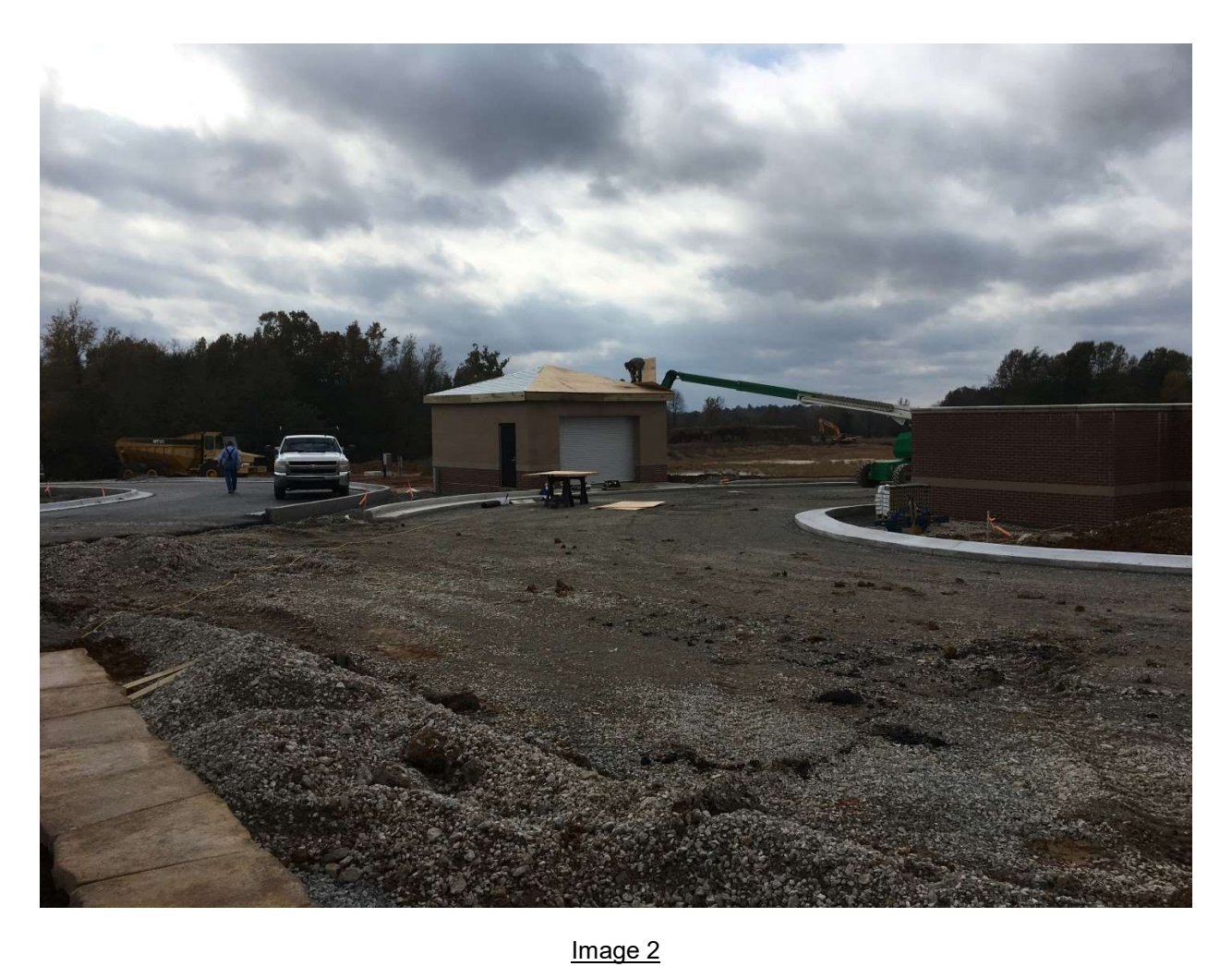
Roofing work at the exterior storage building is ongoing.