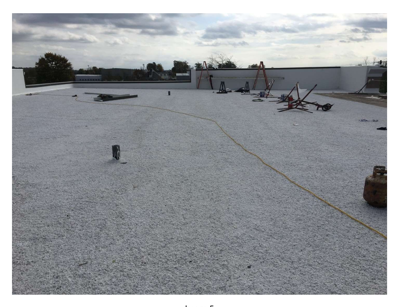
\underline{\text{Image 5}} Roofing work at parpet caps and installation of roof ballast is ongoing.