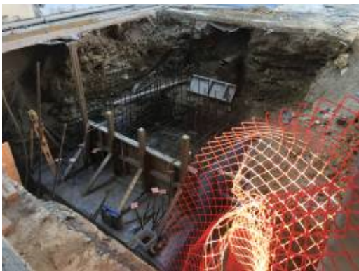
2017.09.28 – Formwork and reinforcing at west end of basement stairs