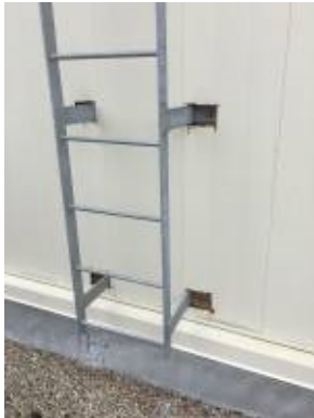
2017.10.12 – Improper ladder installation at new gym wall panels