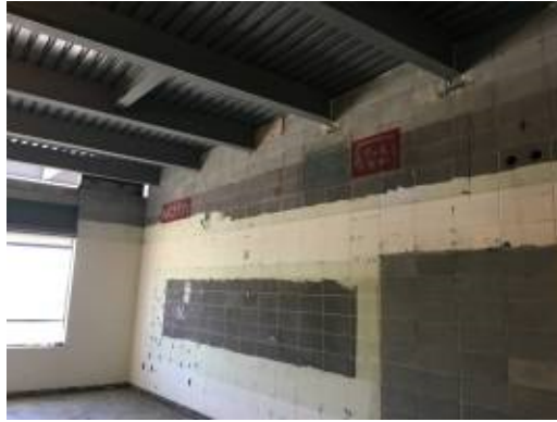
2017.09.28 – Layout of duct penetrations at existing classroom wall