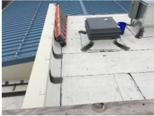
2017.10.12 –Needed cleanup at Phase 1 roof