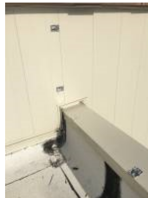
2017.10.12 – Incomplete Phase 1 lightning protection