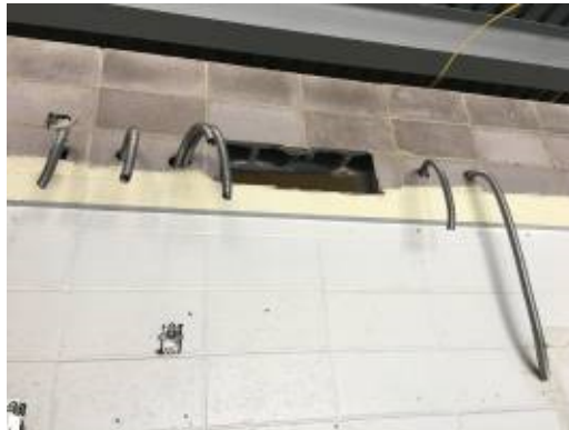
2017.09.28 – New electrical conduit in existing CMU classroom wall