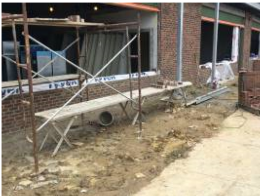
2017.10.12 – Brick infill below window opening in existing wall