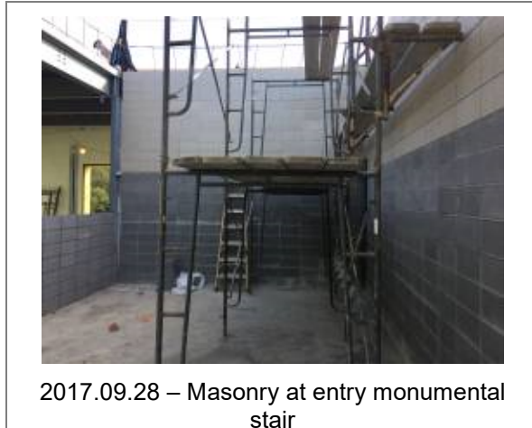
2017.09.28 – Masonry at entry monumental stair