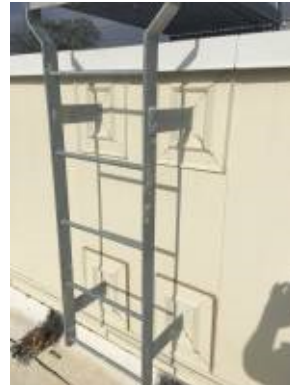
2017.10.12 – Proper ladder installation at new gym wall panels