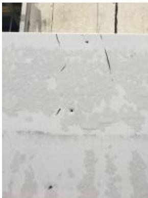
2017.10.12 – Holes in exg coping potentially allowing water into new wall insulation