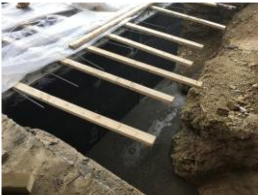
2017.10.05 – Flowable fill and waterproofing at basement stairs