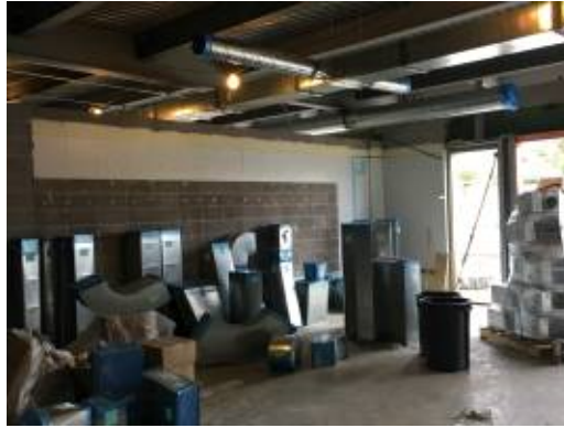
2017.10.12 – Ductwork at 1 st floor