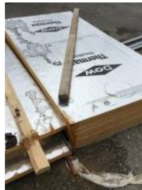
2017.10.12 – Rejected insulation sheathing