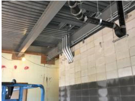
2017.10.12 – Conduit and plumbing below 2 nd floor mechanical room