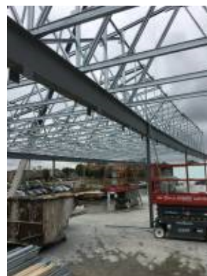
2017.10.12 – Installed roof trusses