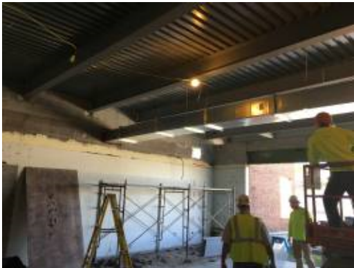
2017.09.28 – Active ductwork installation in 1 st floor classroom