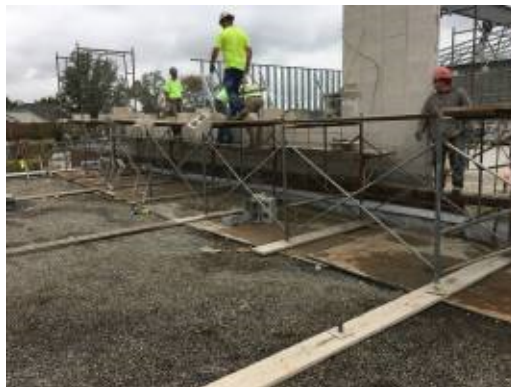
2017.10.12 – Masons at 2 nd floor, south end of Phase 2