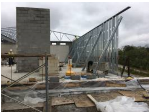
2017.10.12 – Stud framing and completed elevator shaft