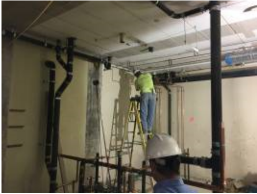
2017.09.28 – Plumber working at underside of 1 st floor slab.