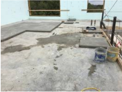
2017.10.12 – Housekeeping pads at 2 nd floor