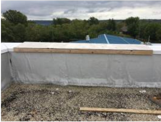
2017.10.12 – Incomplete Phase 1 coping