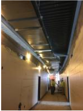
2017.09.28 – Ductwork installed in corridor