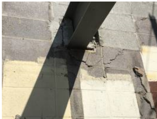
2017.09.28 – Damaged beam bearing to be repaired