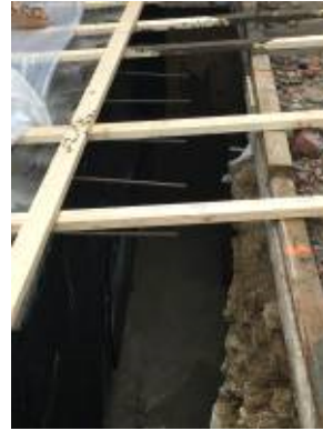
2017.10.05 – Flowable fill and waterproofing at basement stairs