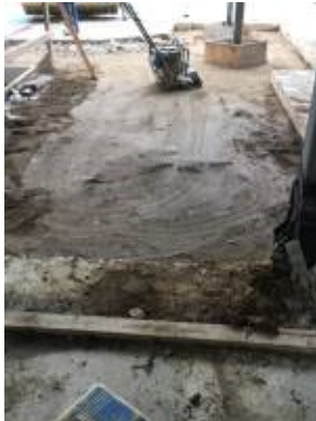
2017.10.12 – Infill slab prep at 1 st floor