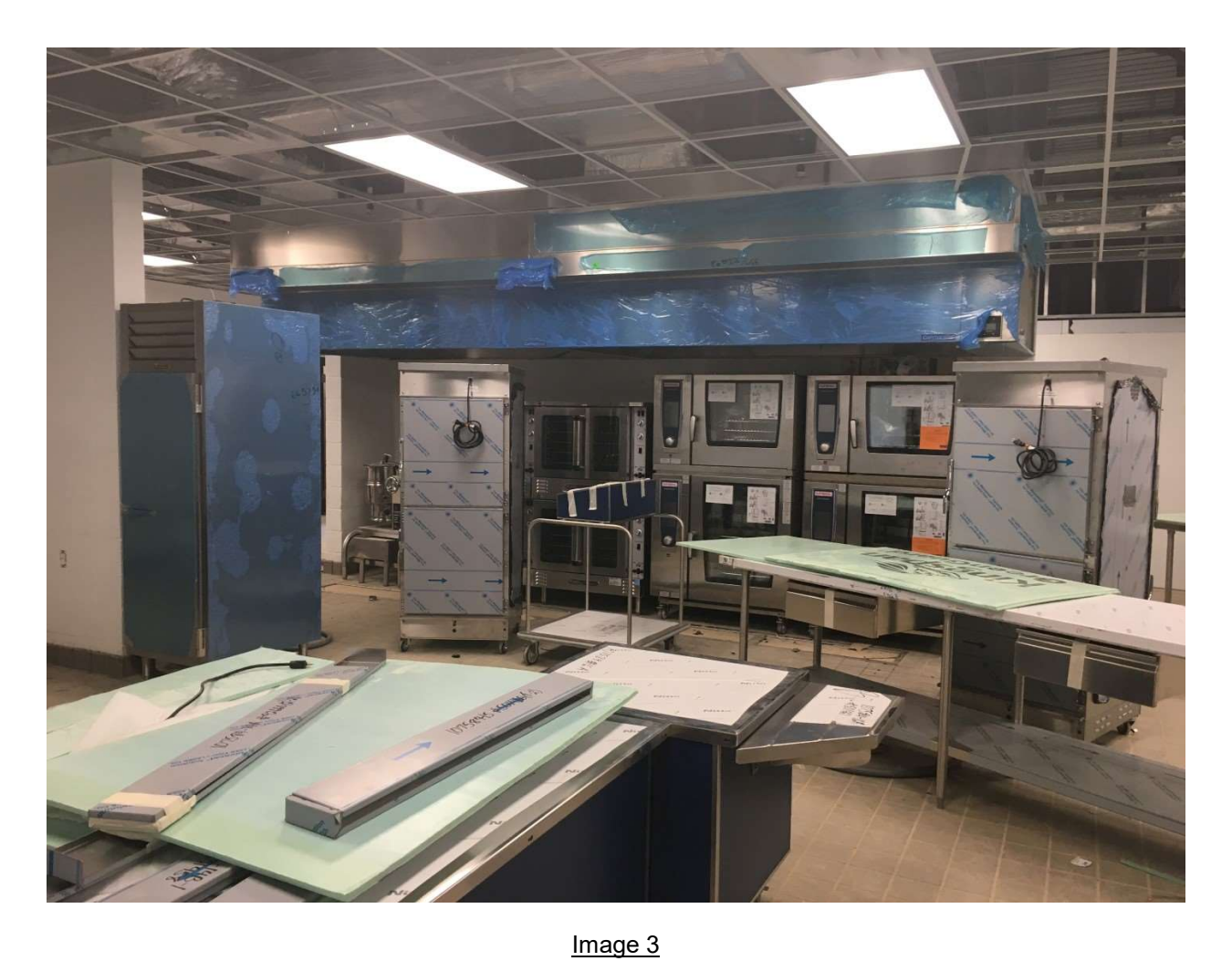
Kitchen equipment installation is ongoing.