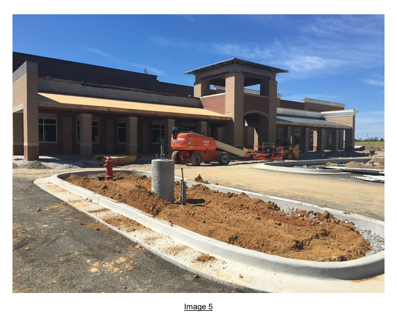
Front entry canopy roofing work is ongoing.