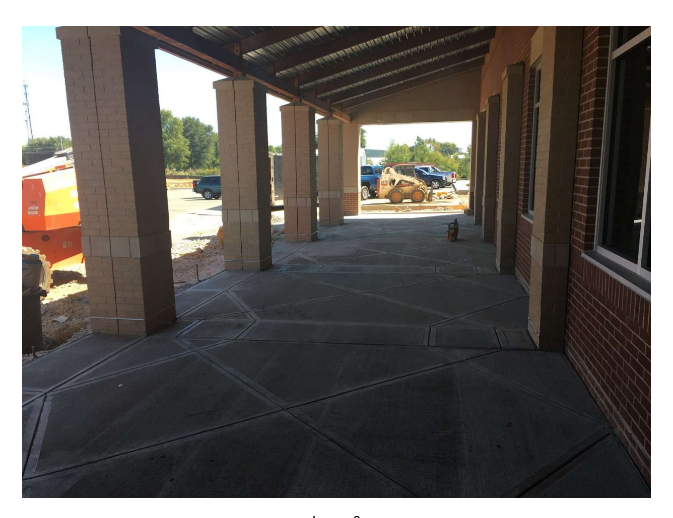
\underline{\text{Image 8}} Concrete work is being completed below the front entry canopy.