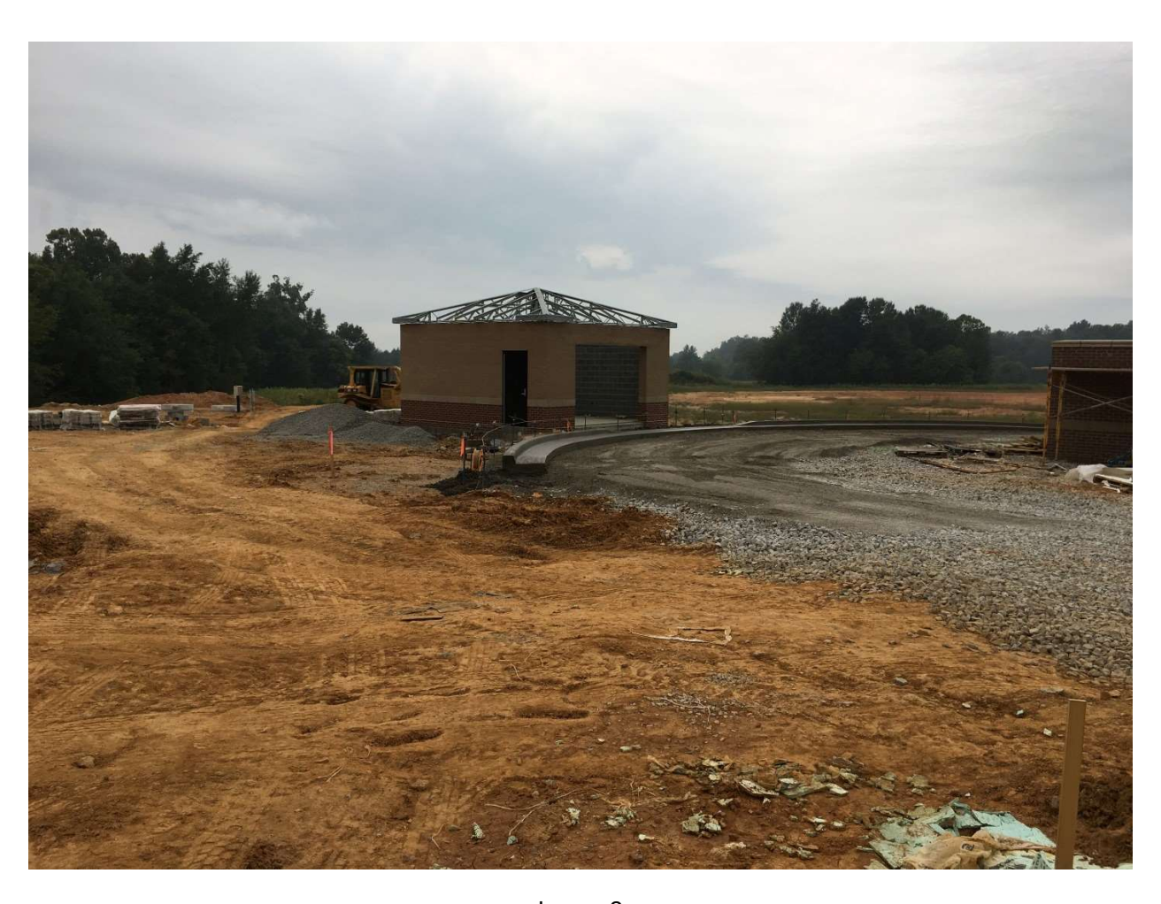
\underline{\text{Image 2}} Storage building walls and roof structure are complete.