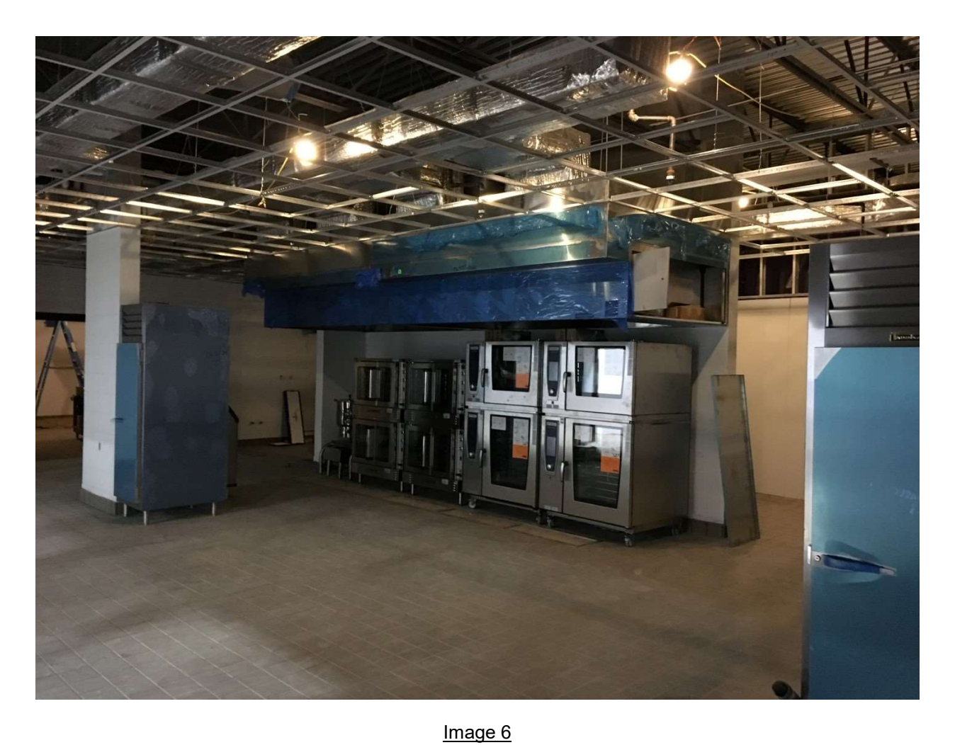
Kitchen equipment installation is underway.