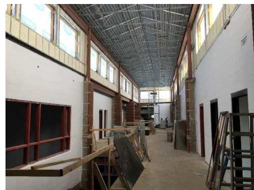
Floor Lobby / Clerestory Interior