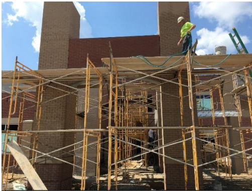
Central Tower at Front Canopy (Main Entry Behind)