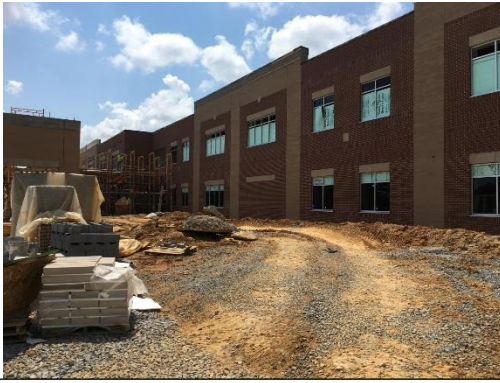
North End of Front Canopy / Main Entry (Behind Scaffold) / North Wing