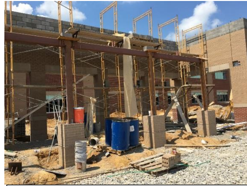
South End of Front Canopy / Central Tower at Front Canopy