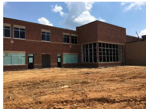
Preschool Classrooms / Media Center