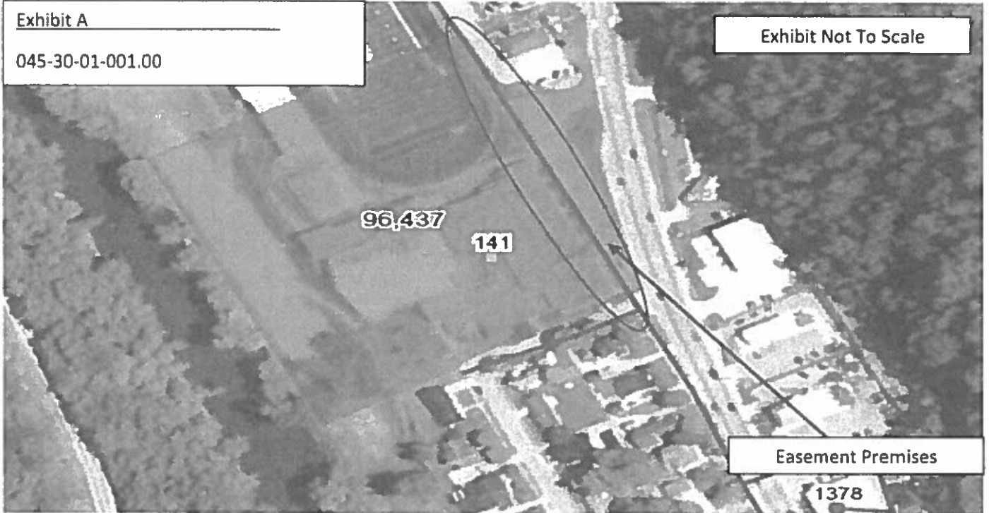
Exhibit Not To Scale