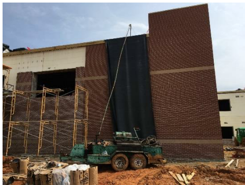
Gym / Art beyond