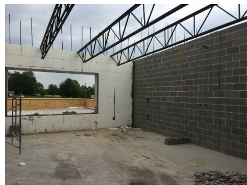
2 nd Floor Classroom