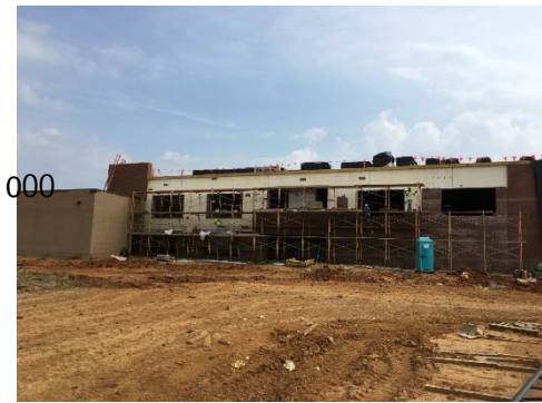
Cafeteria / Entry / Gym