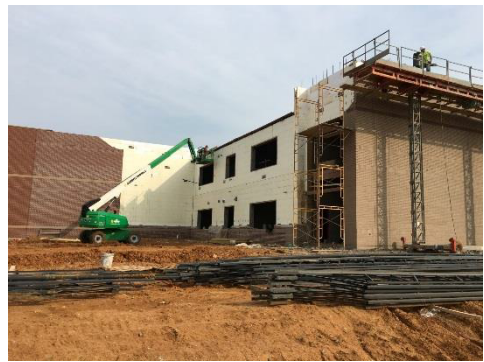
Gym / Art / FMD / Stair "B"