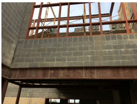
Entry Vestibule at Front