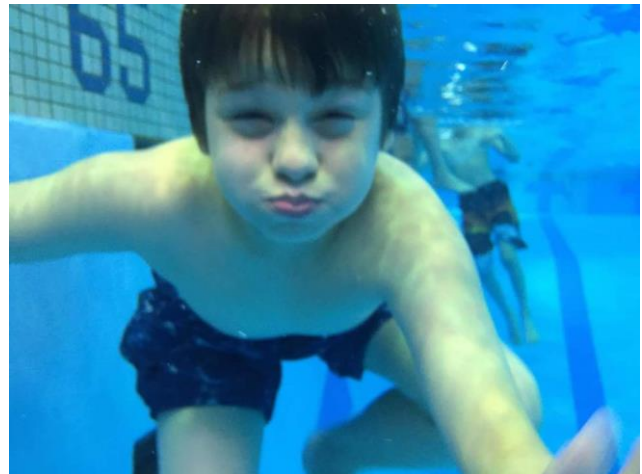
KSD Pool Opening

Other excitement included prom on May 13. Both residential and day students attended this year's "Mardi Gras" themed prom. Staff and community generously helped students to make this a memorable evening by providing tuxes and formal dresses for all those who attended.