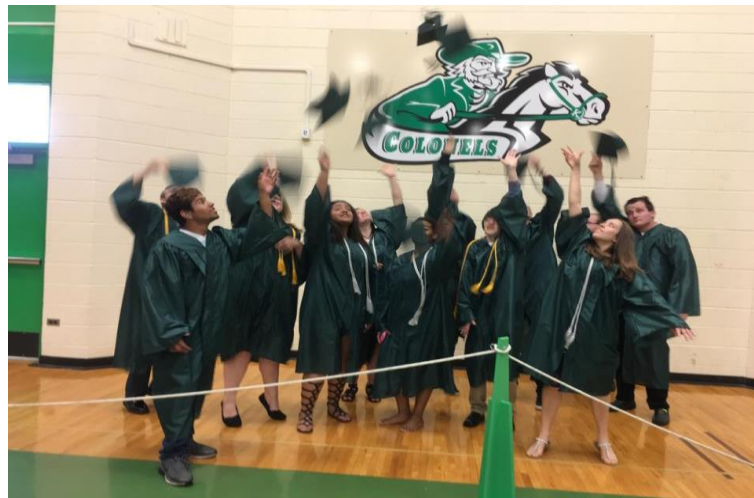
KSD Class of 2017

KSD's graduation ceremony took place on the afternoon of May 25. This year there were 13 graduates and 12 have post-secondary plans. On May 11, staff and students conducted a special ceremony for a senior who was returning home to Russia, where she plans to complete her general education diploma (GED) and then attend college. The plans for the other twelve are as follows: two will attend Gallaudet, three will attend Bluegrass Community and Technical College (BCTC), one will attend Gateway Community College, one will attend beauty school, five will be entering the workforce and one is currently undecided.