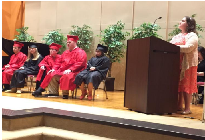
KSB Class of 2017

The celebration continued on May 24 with KSB's graduation ceremony. This year there were five graduates; all of whom have post-secondary work plans. One graduate will work with the Louisville Bats through the Office for the Blind (OFB) work program as a junior equipment manager. Another senior will be working towards attaining employment as a Braille proofreader through the American Printing House. The remaining graduates are working in various capacities such as in a family restaurant, daycare and volunteering in an elementary school.