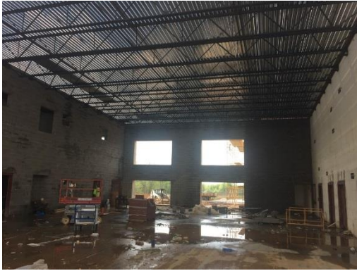
Ground Floor - Cafeteria