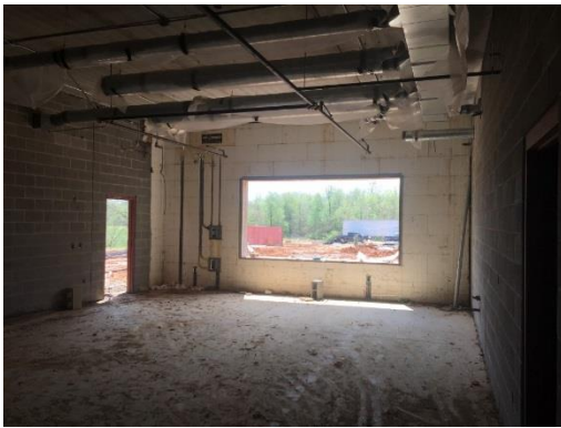
Ground Floor - Preschool