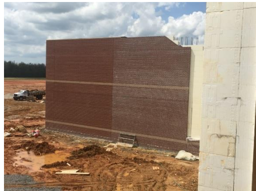
Second Floor – view of east wall of Gym (left portion cleaned, right portion uncleared)