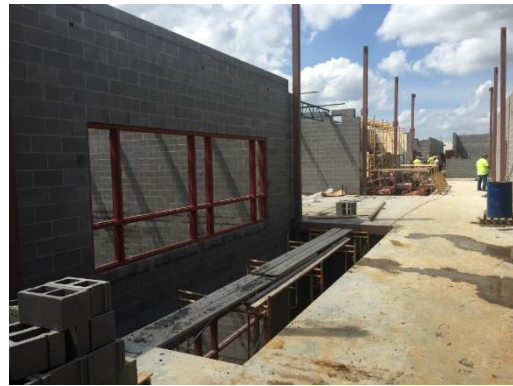
Second Floor – Corridor (window view into front Vestibule)