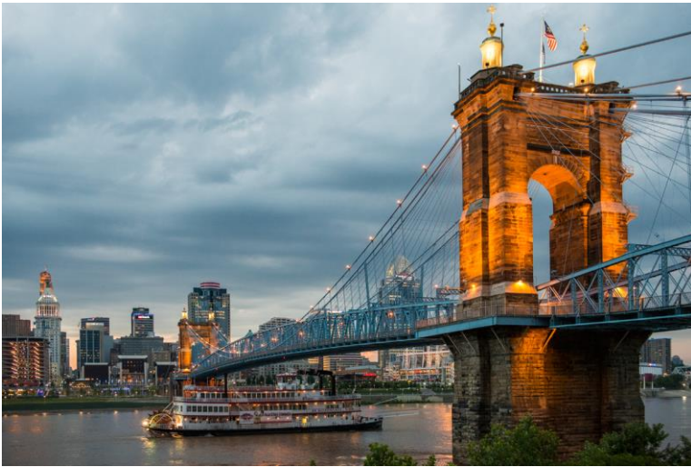
Northern Kentucky 2018-2021