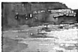
McDowell Elementary main entrance following the May 2009 flood