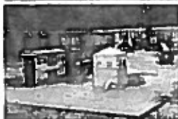
McDowell Elementary playground following the May 2009 flood

Licensed Uses: Pew may use the Photograph for noncommercial purposes in any medium now existing or later invented, including but not limited to in print or on websites.