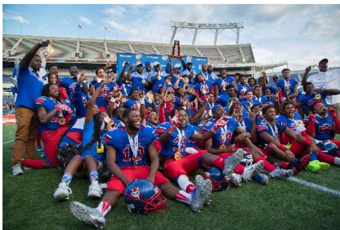
Pahokee won the Class 1A state football championship last month, but will be forced to vacate the title because of an ineligible player.

The Florida High School Athletic Association told the district that Pahokee must vacate the Class 1A state championship it won in December due to its use of an ineligible player.