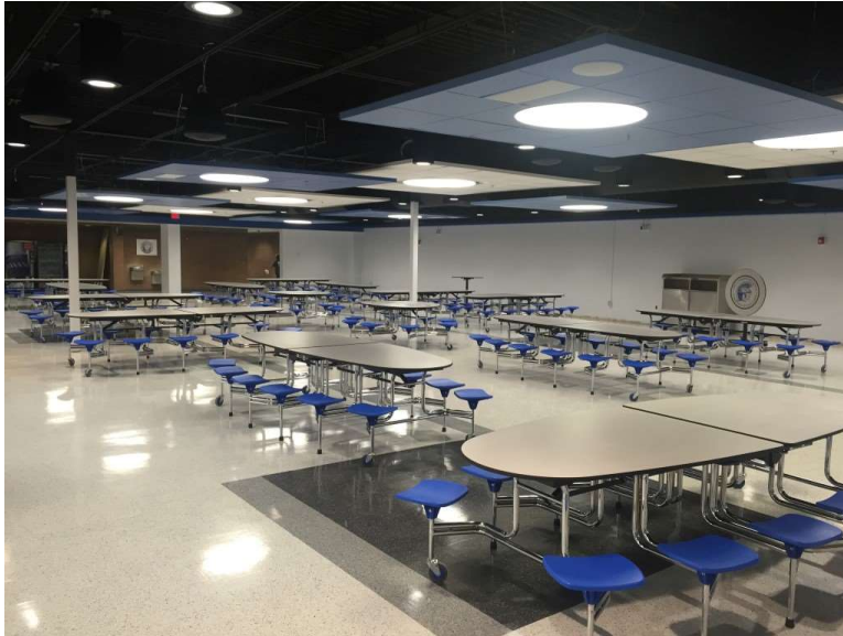
Renovated cafeteria is now occupied by students.