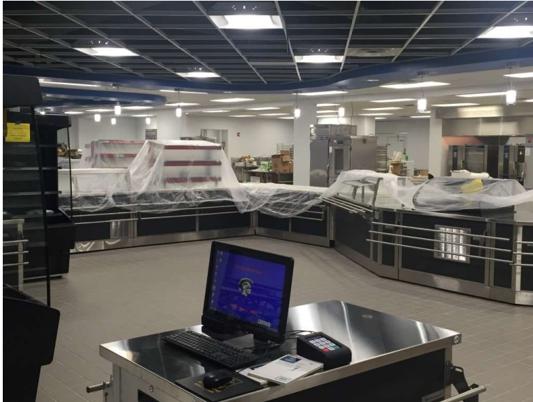
Serving line equipment has been installed and covered prior to student occupancy.