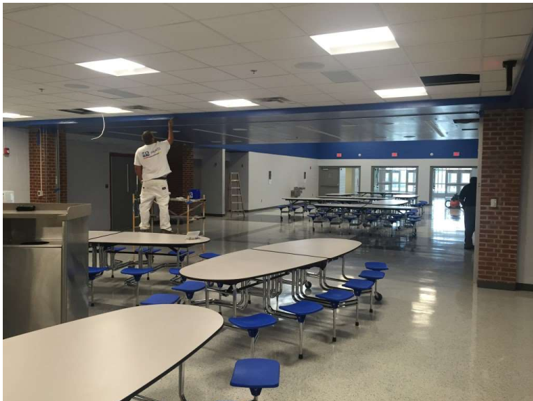
Painters touch up paint prior to students return on August 4 th .