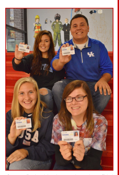
Gateway Regional Academy students show off their ID cards with pride! Forty-one juniors and seniors currently participate in this dual credit program.

The Ludlow Independent School District is committed to fostering a culture of rigor, excellence, and personal accountability by developing meaningful relationships with students, families, and community members to support and empower students to graduate with college and career readiness skills.