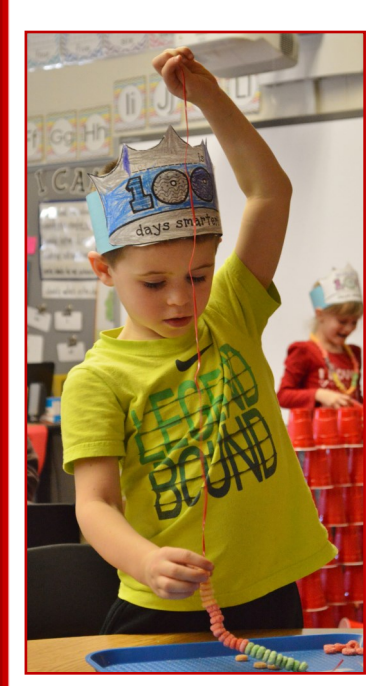
Elementary students celebrated being "100 Days Smarter" on the 100th Day of School. This Kindergarten student counts by 10s to 100.