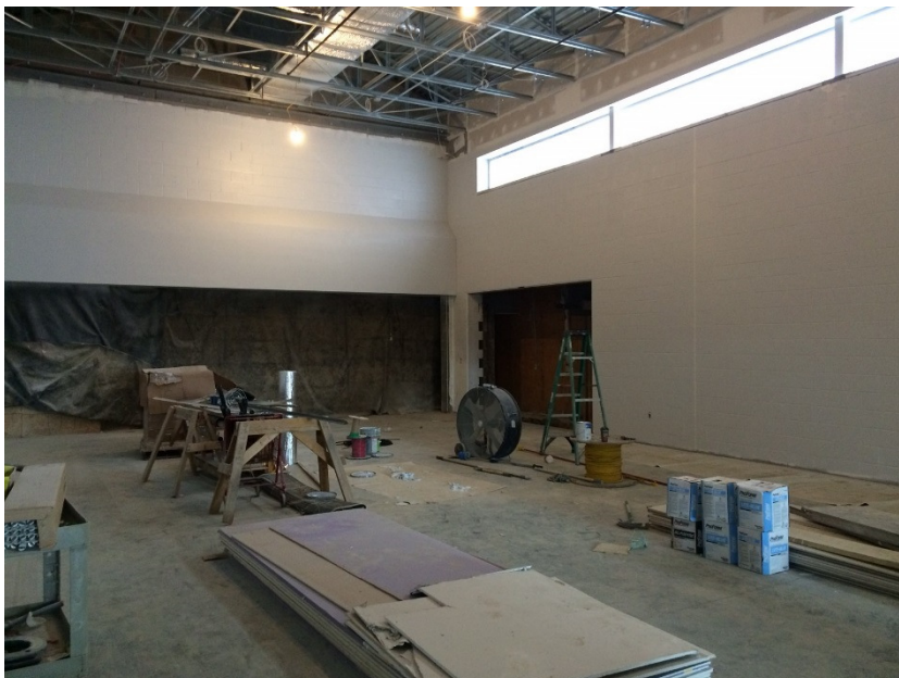
Photo 2: Interior finishes are ongoing at the new lobby. New clerestory allows natural light into the space.