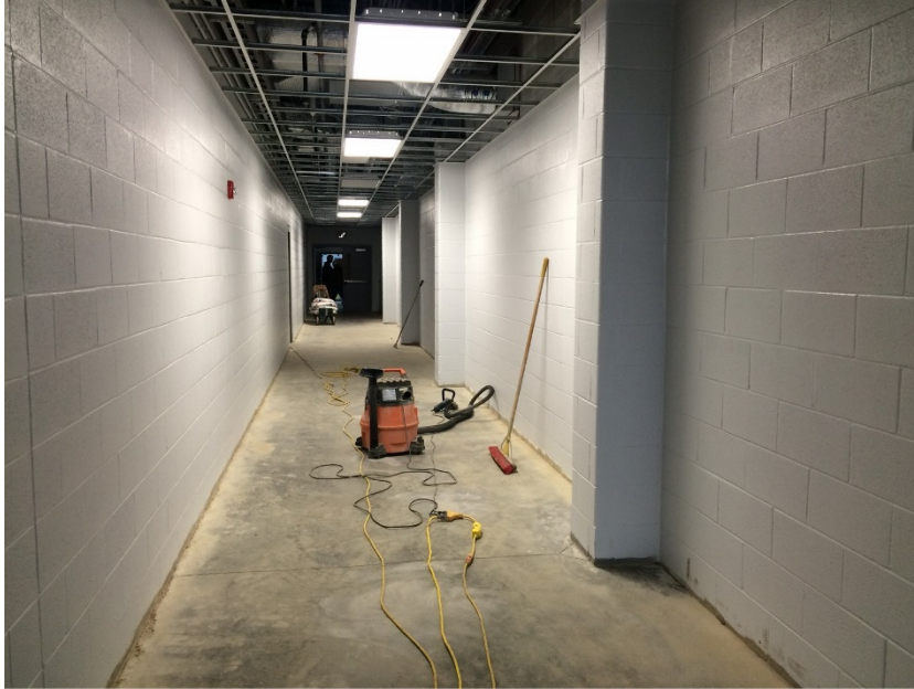
Photo 5: Slab preparation is ongoing at the corridor to the new locker room area.