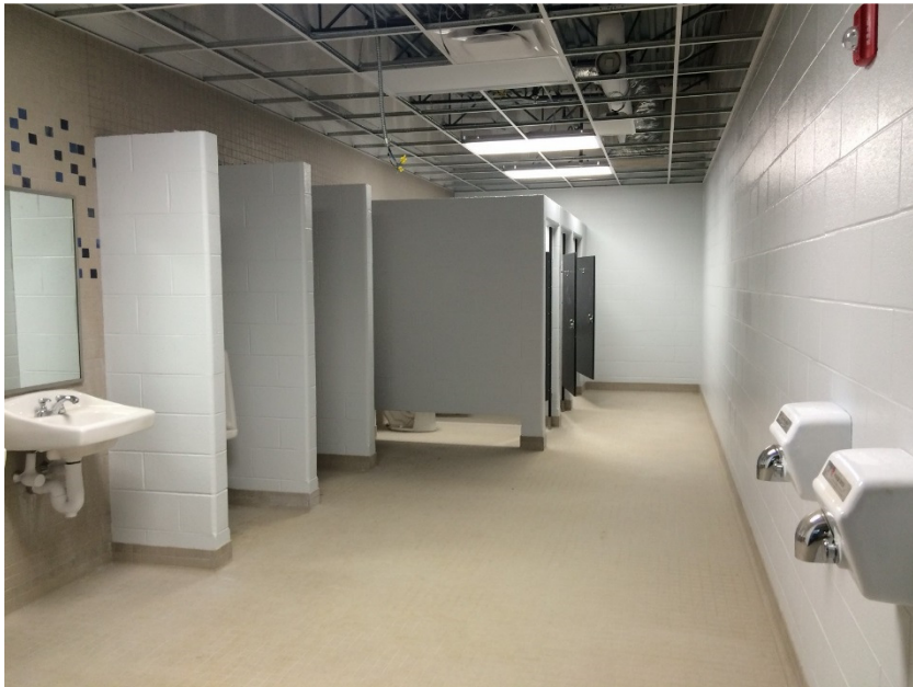
Photo 4: Finishes are ongoing at the new restrooms off the main lobby.