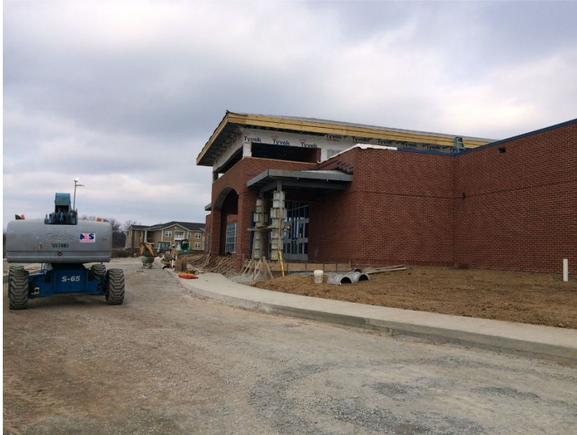
Photo 1: Work is ongoing at the entrance to the new lobby at the rear of the school.