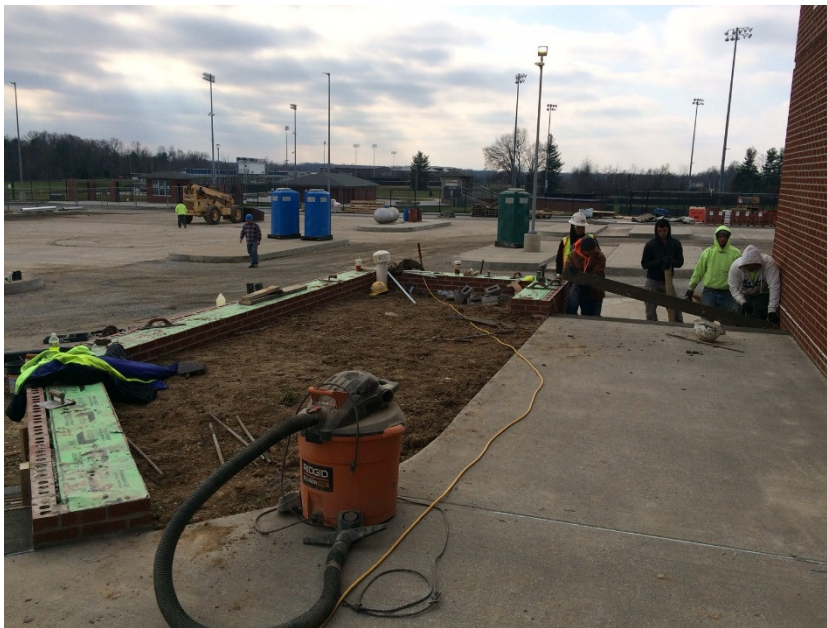
Photo 8: Exterior plaza and egress stairs are being installed. (Beyond) Site work continues in the parking lot.