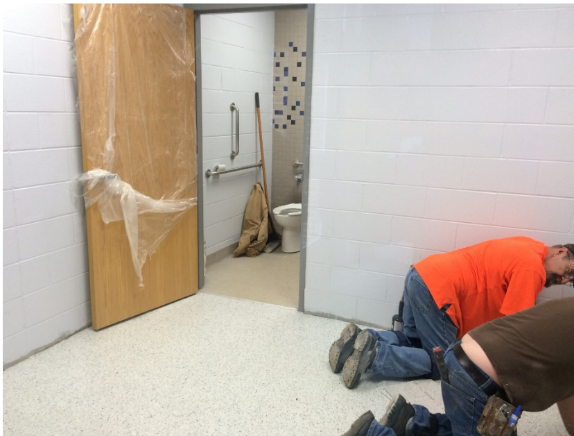
Photo 6: Floor finishes are being installed in the locker room areas.