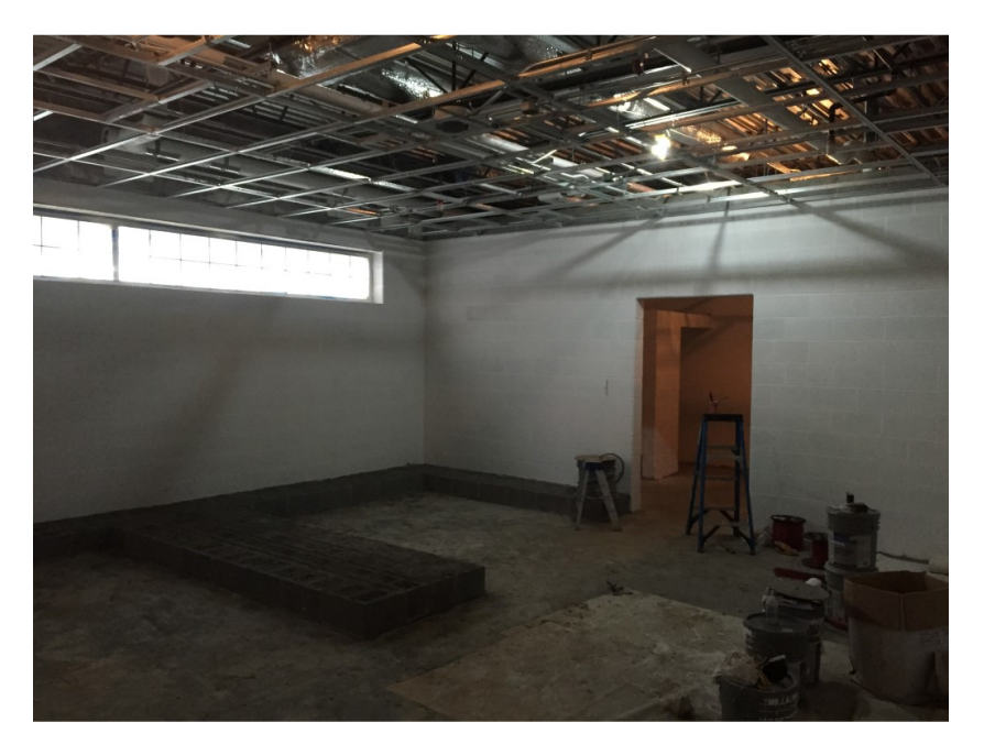
Photo 4: Rough-in work above the ceiling is nearing completion at the new locker room areas. CMU bases are being installed for the new lockers. Block filler (first coat of paint) has begun.