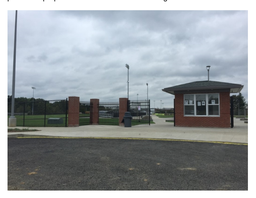
Photo 7: Permanent windows, gates, and fencing have now been installed at the entry to the athletics complex. Masonry olumn caps remain outstanding.