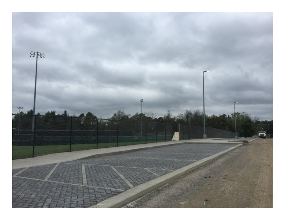
Photo 8: Permeable pavers have been installed north of the athletics complex entry.