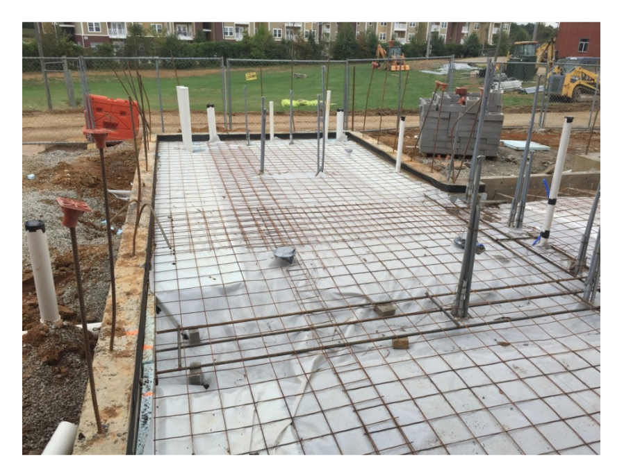
Photo 6: Below slab electric and plumbing is complete. Vapor barrier and slab reinforcement are in place and prepared for new slab at the building addition north of the existing auxiliary gymnasium.