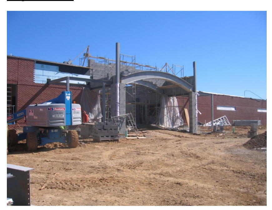
Photo 1: Masonry work and steel erection is ongoing at the new rear entry.