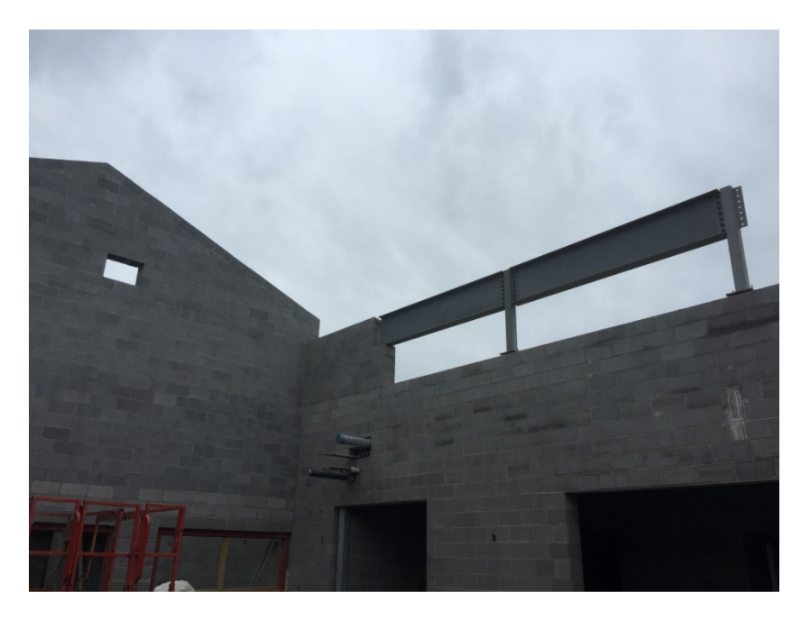
Photo 2: Steel is currently being set above the clerestory in preparation for the light gauge metal truss installation at the roof.