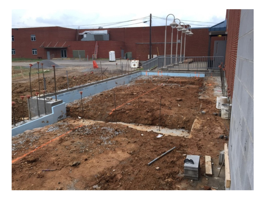
Photo 2: Footings and stem walls have been placed at the building addition north of the existing auxiliary gymnasium.