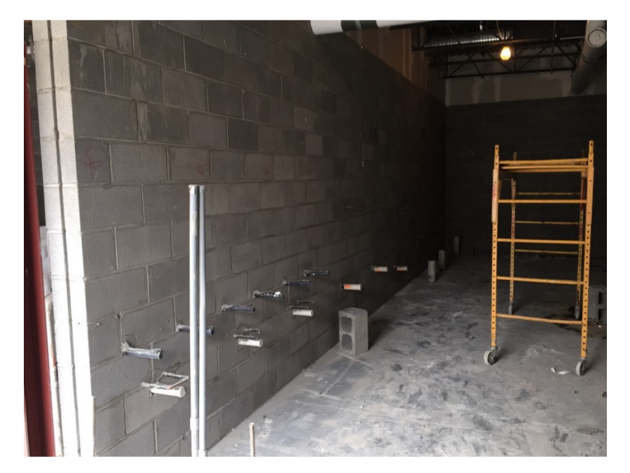
Photo 6: Plumbing rough-in work is ongoing at the New Restrooms off of the New Entry Lobby.