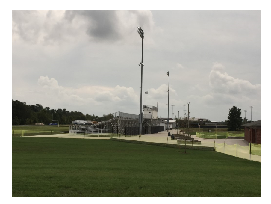
Photo 9: New lawn area between parking lot and new home side grandstands.

Photo 8: New Ticket Booth is in place. Morel is presently waiting for new storefront and glazing for the new ticket booth. Temporary double hung windows have been installed so that the ticket booth can be used by the school.