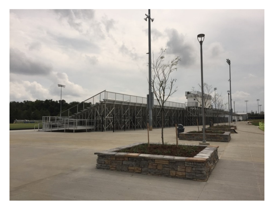
Photo 10: New pedestrian plaza behind the New Home Football Grandstands.