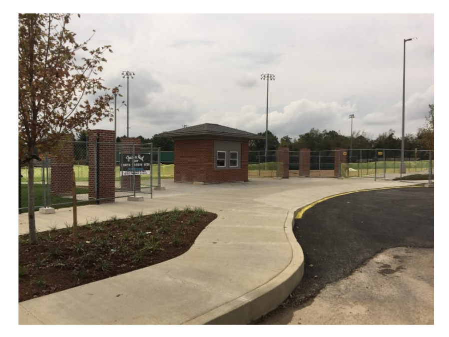
Photo 8: New Ticket Booth is in place. Morel is presently waiting for new storefront and glazing for the new ticket booth. Temporary double hung windows have been installed so that the ticket booth can be used by the school.