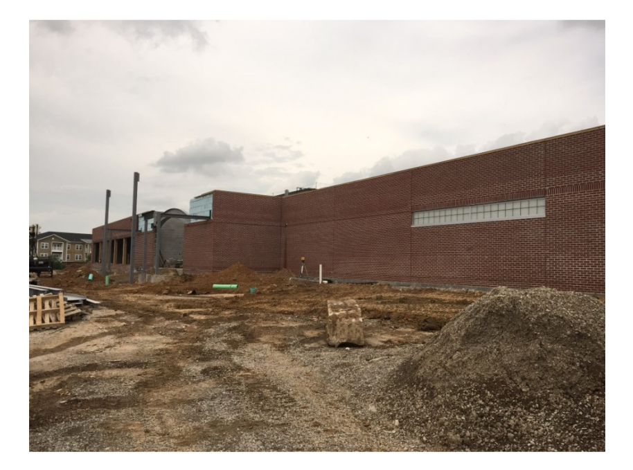
Photo 4: Exterior brick work is nearing completion at the New Locker Room addition. Exterior translucent wall panel has been installed at the locker room areas.