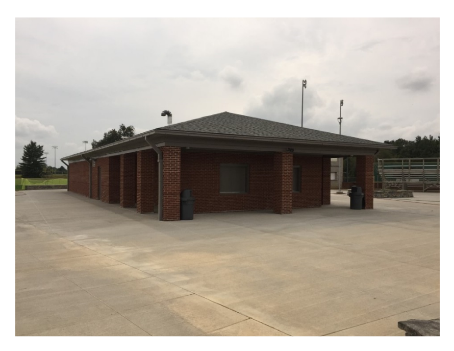
Photo 11: New Concessions and Restroom Building is substantially complete

Photo 10: New pedestrian plaza behind the New Home Football Grandstands.