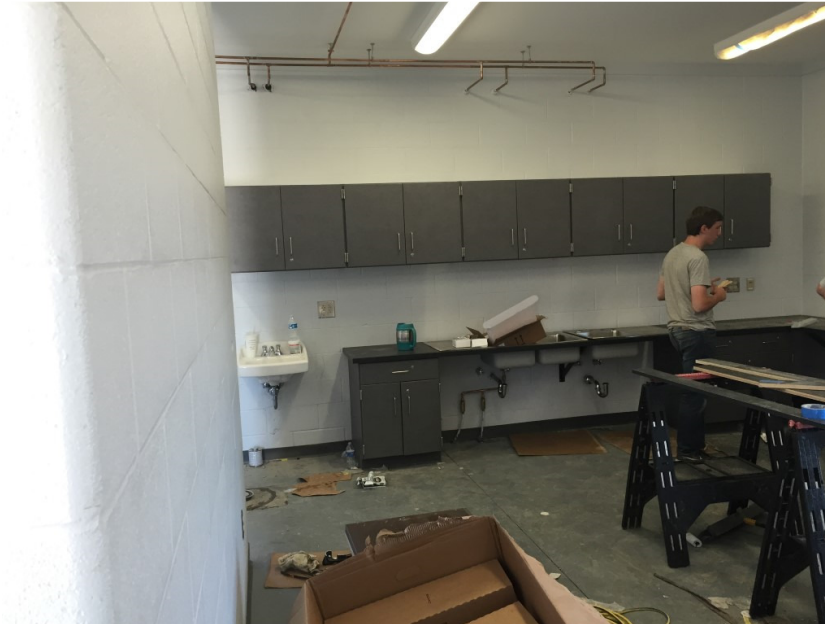
Photo 12: Laminate clad casework and countertops are being installed in the new concessions area at the Central Concessions/Restroom Building.