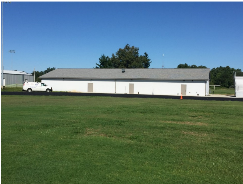
Photo 15: Exterior of Baseball/Football Fieldhouse has been repainted.