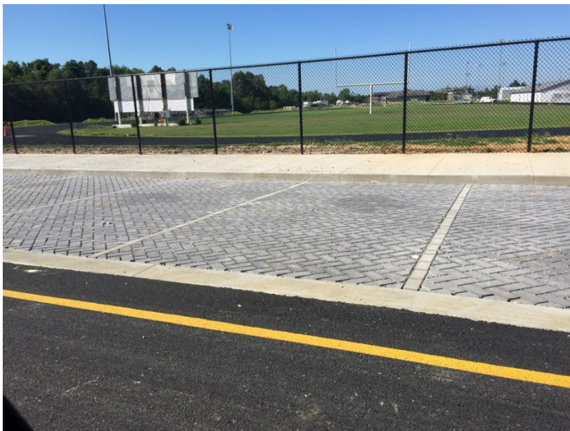
Photo 5: Approximately 70% of the rear parking lot has been completed and striped. Permeable pavers have been installed south of the New Ticket Booth/Athletics Complex Entry.