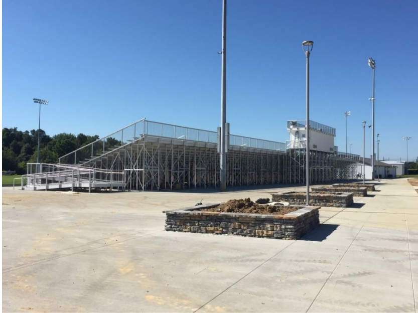
Photo 8: New pedestrian plaza behind the New Home Football Grandstands.