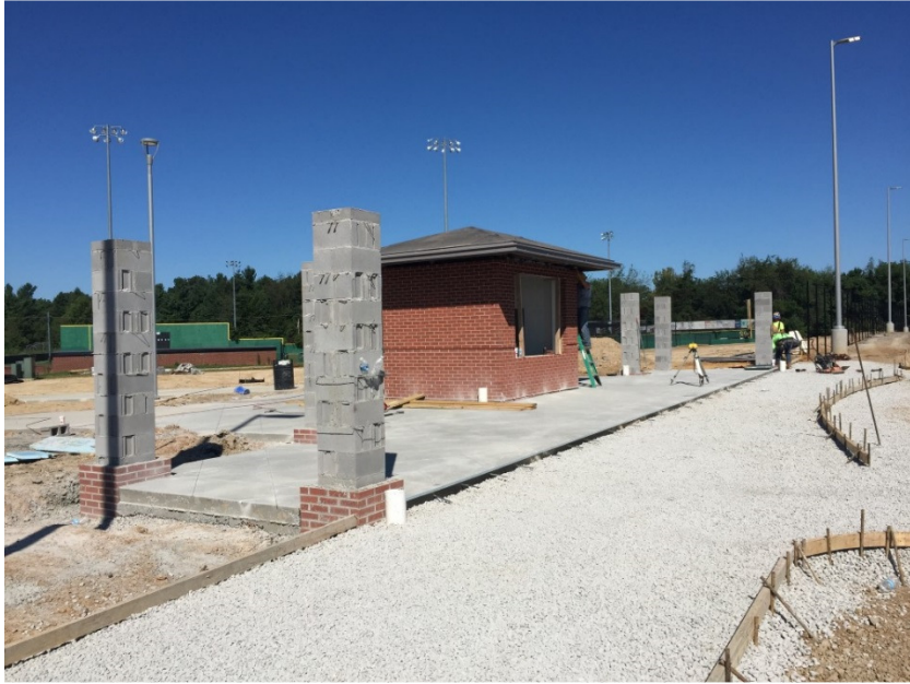
Photo 6: Work is ongoing at the New Ticket Booth/Athletics Complex Entry.