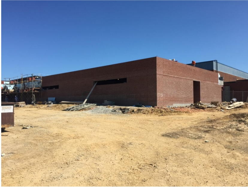
Photo 4: Exterior brick work is ongoing at the New Locker Room addition. Roof structure and deck is in place and work is ongoing at the roof to dry in all new spaces.