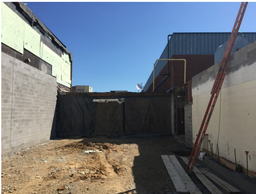
Photo 3: New Rear Entry Lobby looking toward the existing cafeteria.