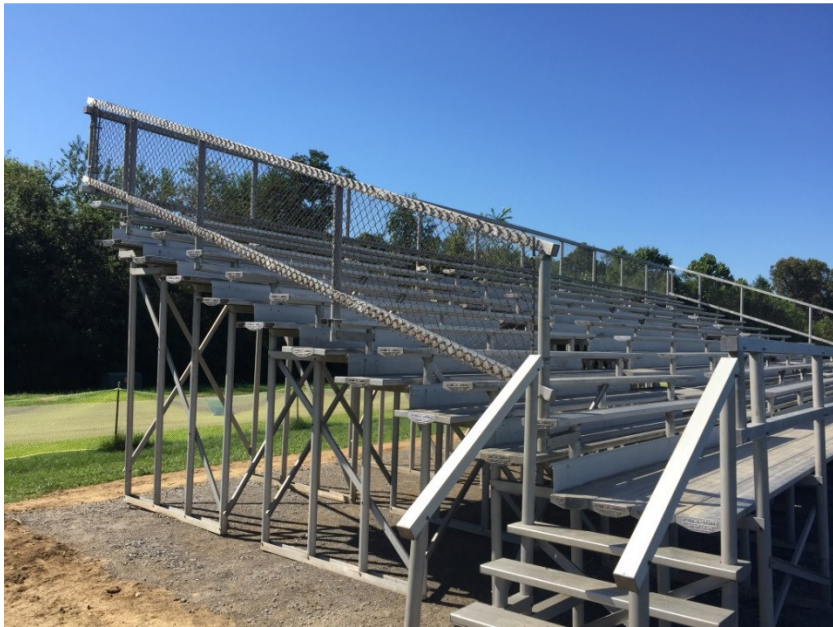
Photo 9: Re-Installation of existing Visitor Grandstands is underway.