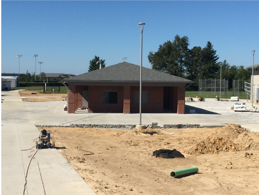
Photo 10: Work continues in and around the New Central Concessions/Restroom Building.