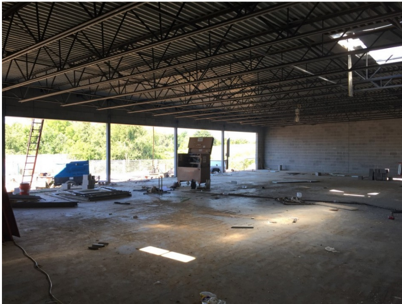
Photo 1: Roof structure and decking is now in place at the Wellness Center (behind the existing Auxiliary Gymnasium).