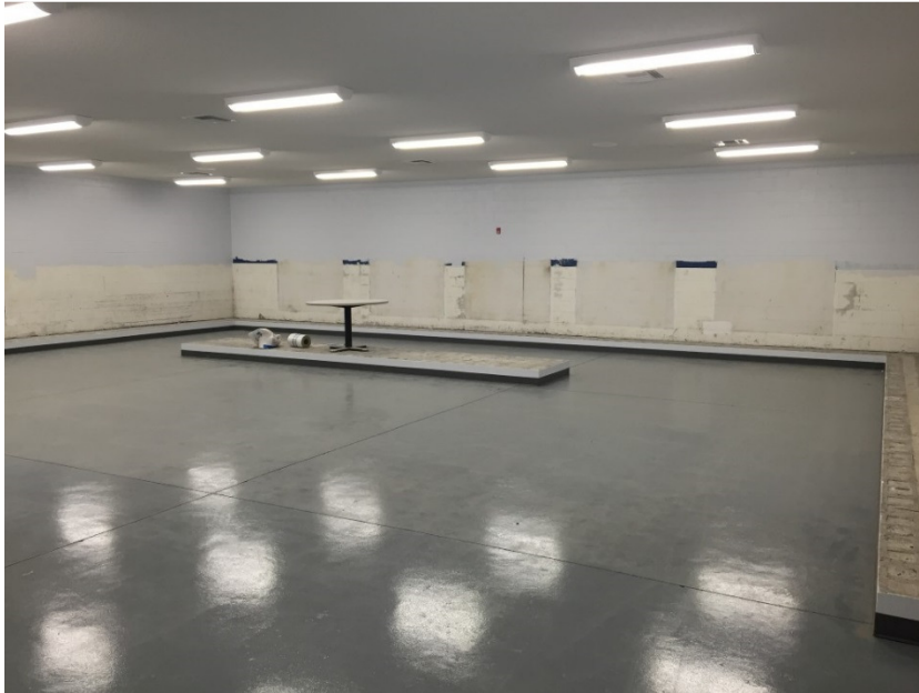
Photo 14: Football Locker Room is nearing completion (pending locker installation).