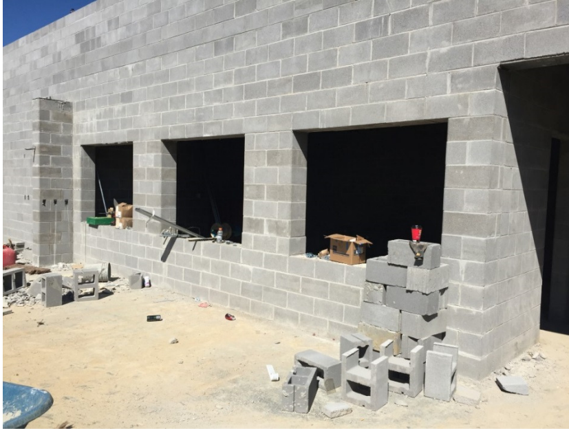
Photo 2: New Concessions Area at the New Rear Entry Lobby. Footings have been placed and masonry work is ongoing.