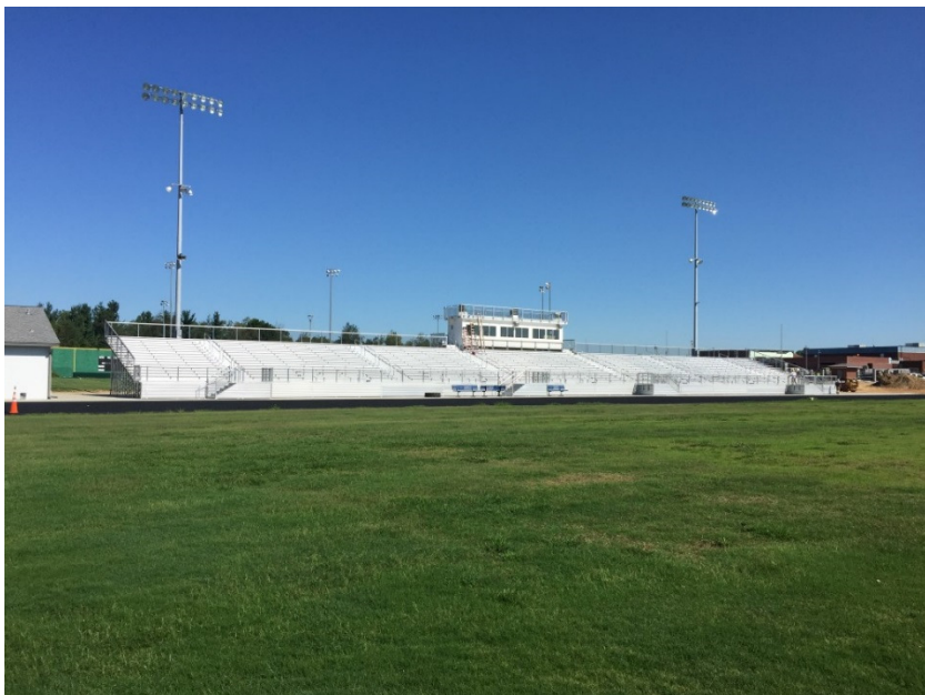
Photo 7: New Home Side Grandstands are nearing completion. Punchlist is being completed and Pressbox is being prepared for occupancy.