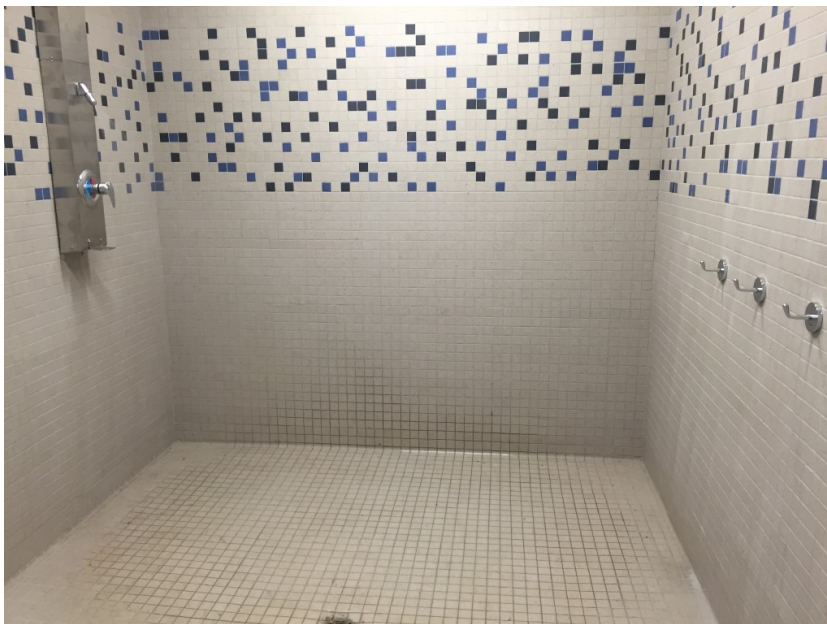
Photo 13: New showers at the Baseball/Football Fieldhouse are complete and plumbing fixtures are being tested.