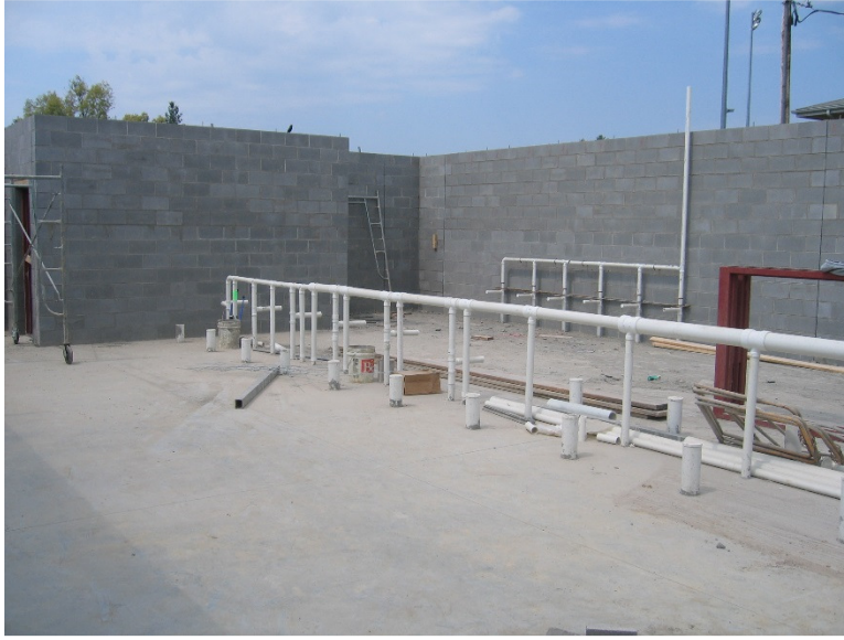
Photo 4: New Concessions/Restroom Building at Athletics Complex – Interior