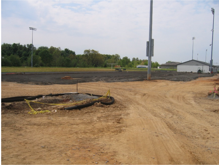
Photo 6: Site grading/site development underway at new home grandstands location.