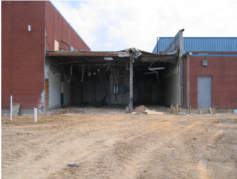
Photo 2: Demolition at existing rear entrance (between existing locker rooms and existing aux. gym).