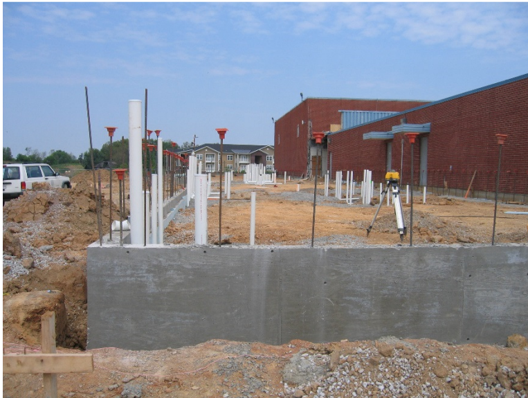
Photo 1: Under slab plumbing work and new foundations at new locker room addition.