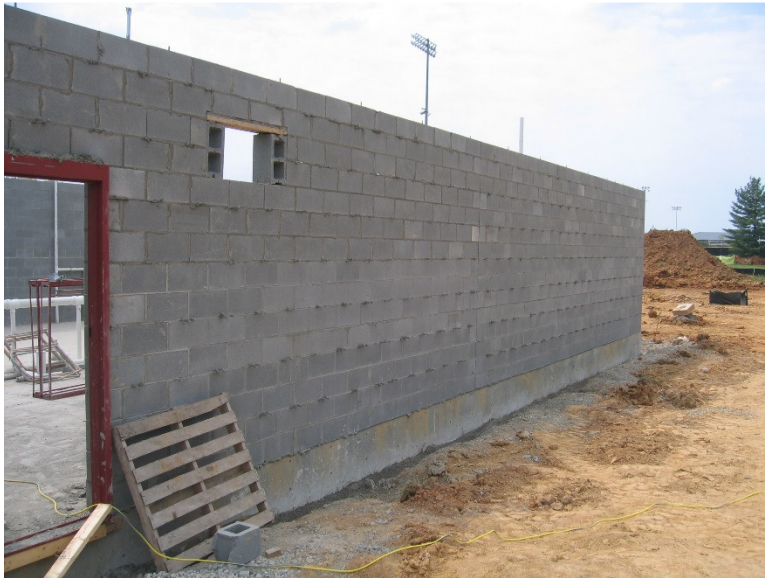
Photo 5: New Concessions/Restroom Building at Athletics Complex – Exterior