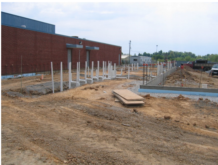
Photo 3: Under slab plumbing work and new foundations at new entrance/public restrooms.