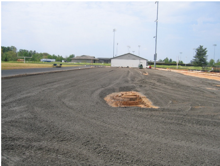
Photo 7: Site grading/site development underway at new home grandstands location.