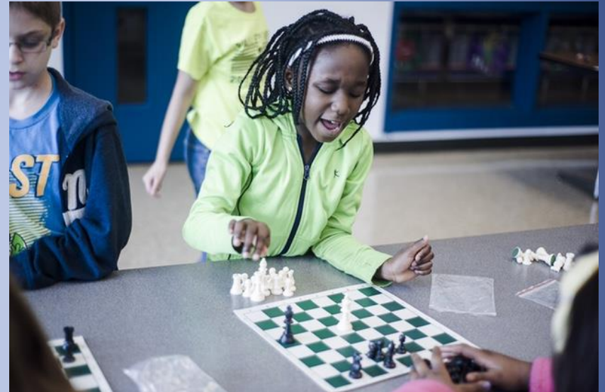
Literacy and Chess