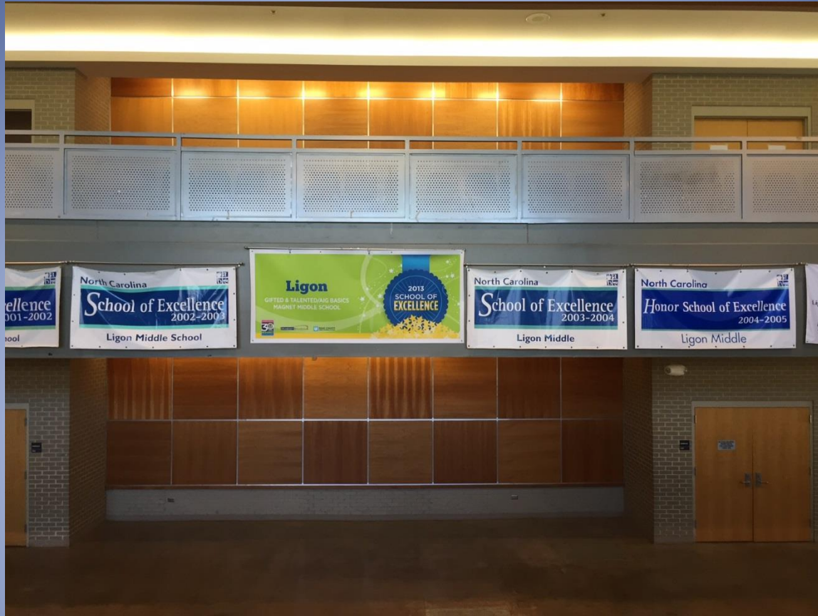
Magnet Schools of America Conference April 22-26, 2015 Raleigh, North Carolina