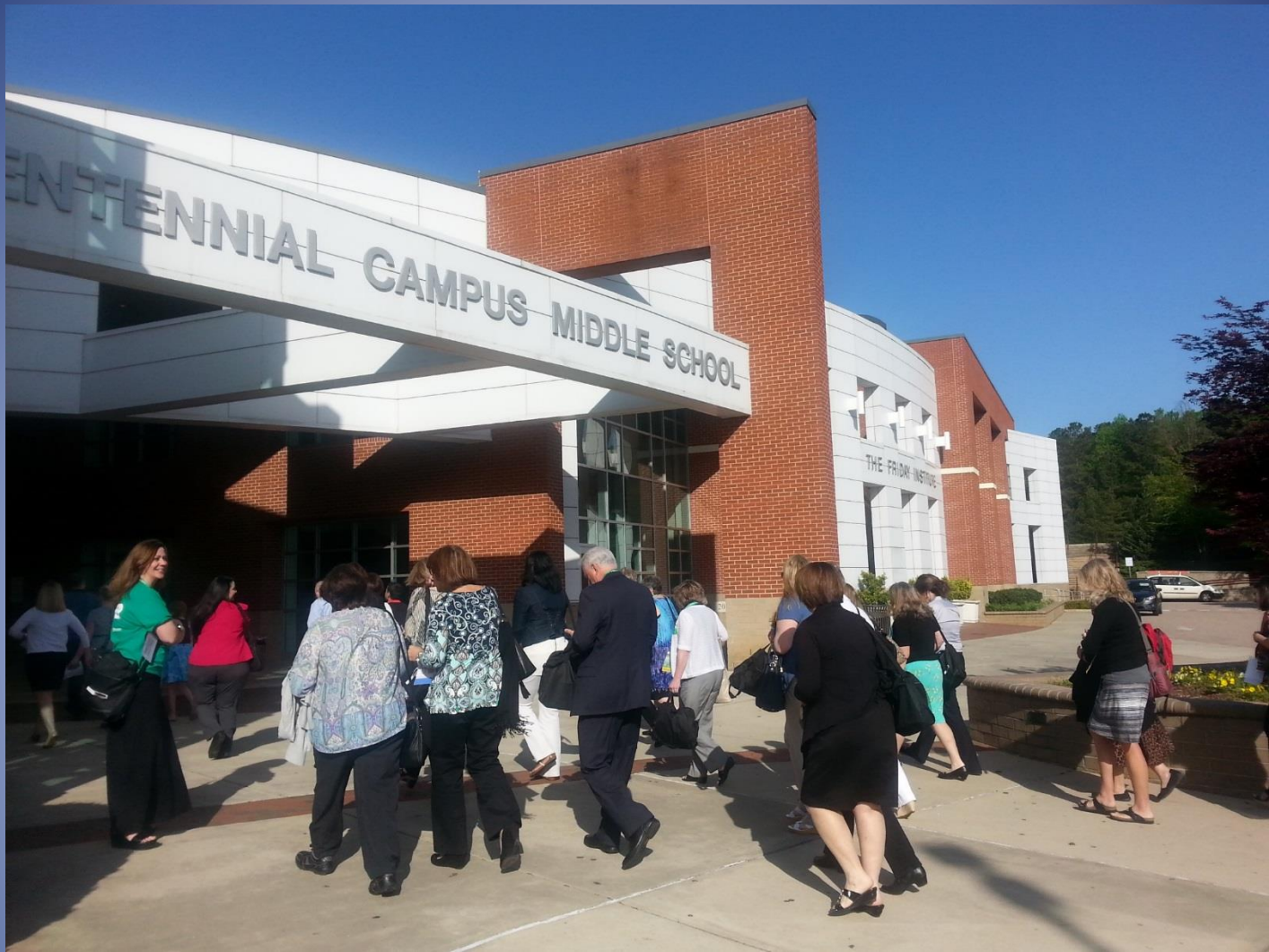
Magnet Schools of America Conference April 22-26, 2015 Raleigh, North Carolina