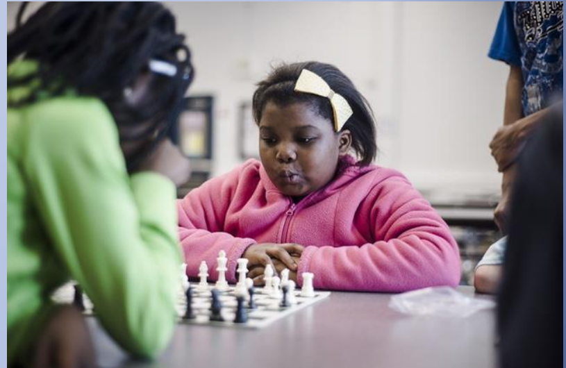
Literacy and Chess