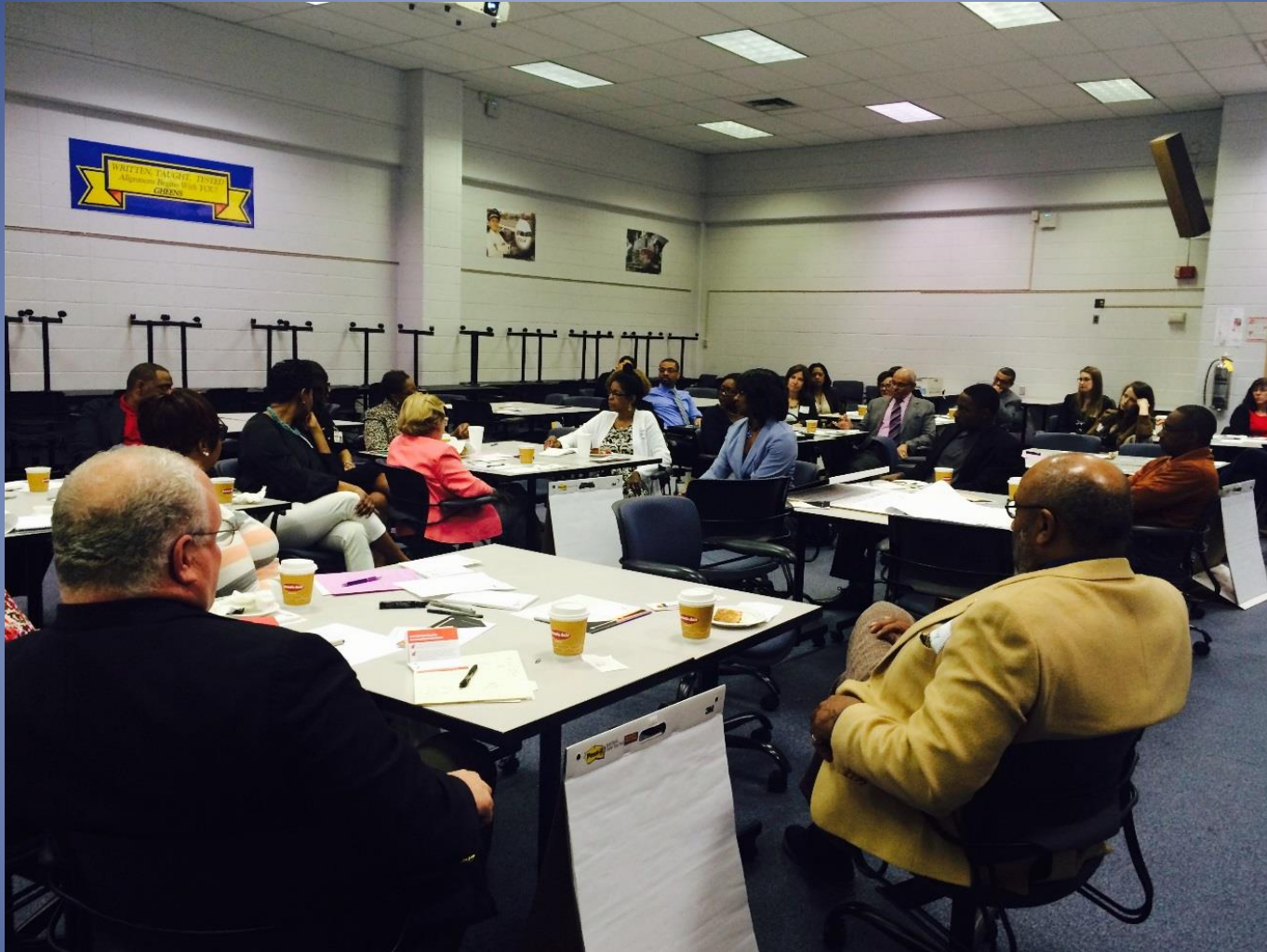
Superintendent's Summit on Minority Recruitment Friday, April 24, 2015