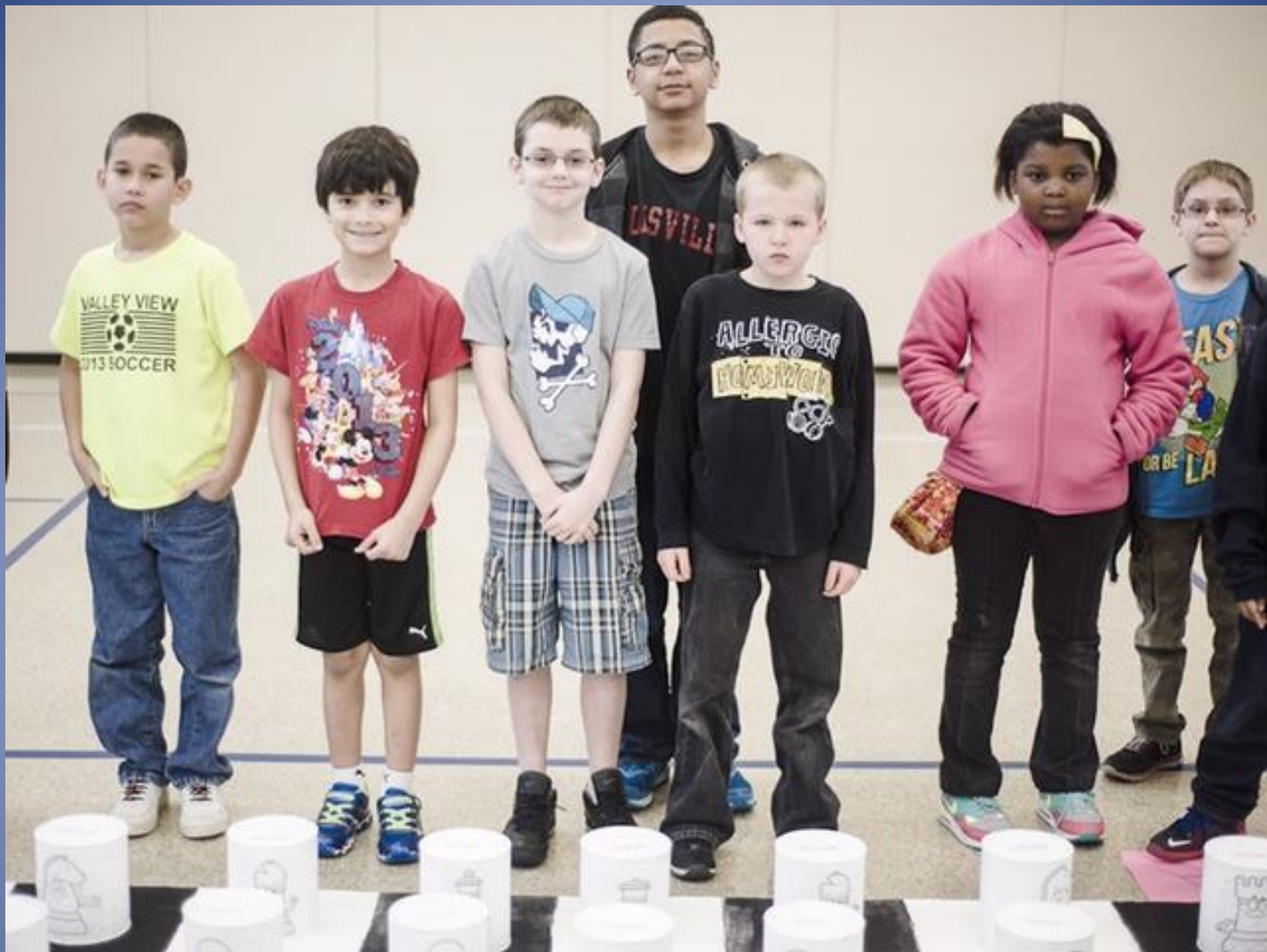
Literacy and Chess Rangeland Elementary School and the California Community Center