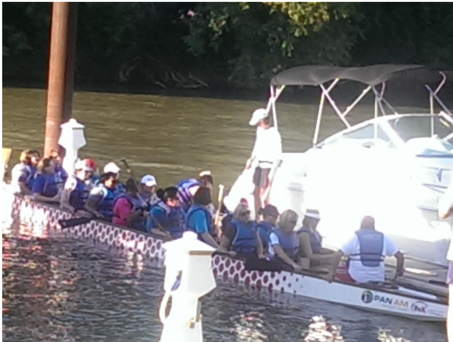
JCPS Dragon Crew