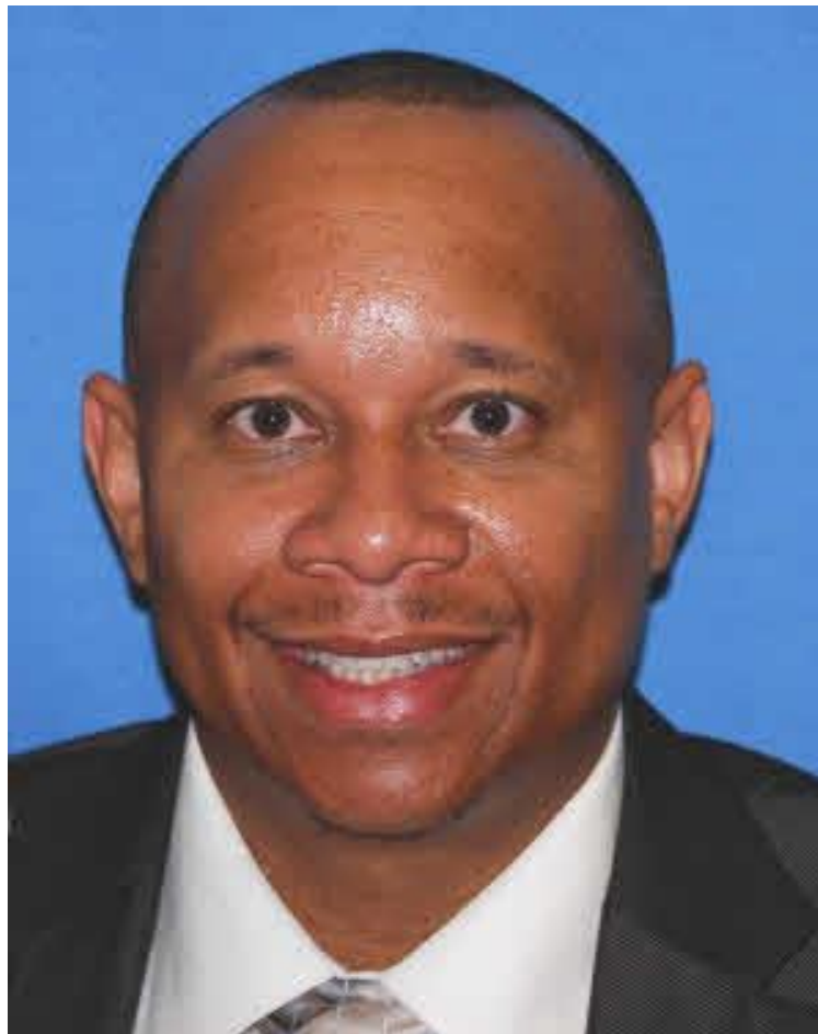
Joseph Wood Indian Trail Elementary School