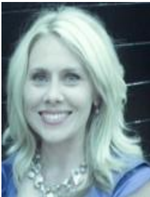
Jamie Wyman Carter Traditional Elementary School