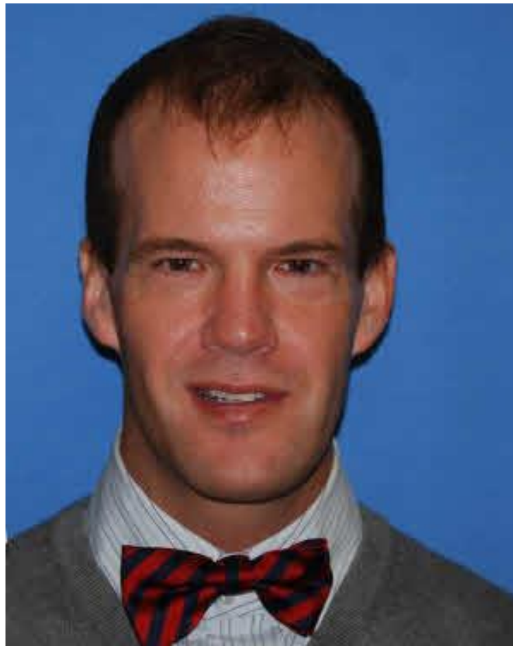
Jack F. Jacobs Bloom Elementary School