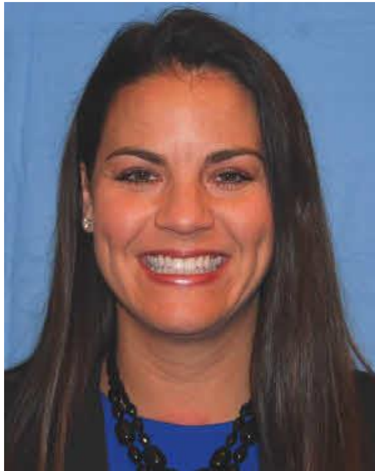
Tracy Barber Dunn Elementary School