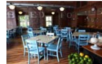
Restaurants We Love: Truck in Bedford