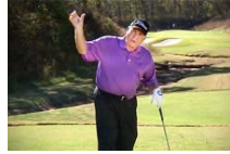
1 Weird Trick, +20 Yards... 12-Time PG... Square to Square Method