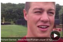
Westchester/Putnam baseball player of the y... Jul 8, 2013