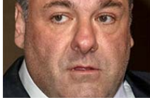
Gandolfini Was 'Walking Time Bomb,...' Newsmax