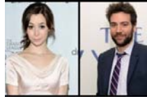
'How I Met Your Mother' Reveals the Mother The Hollywood Reporter