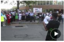
East Ramapo school board law firm ousted Jul 8, 2013