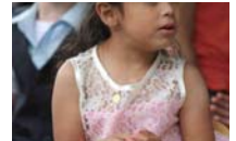
Coleman School graduation in White