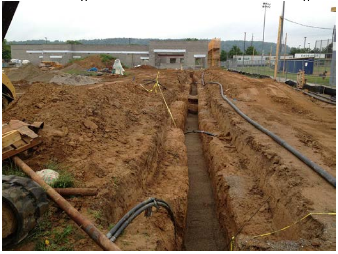
END FIELD OBSERVATION REPORT