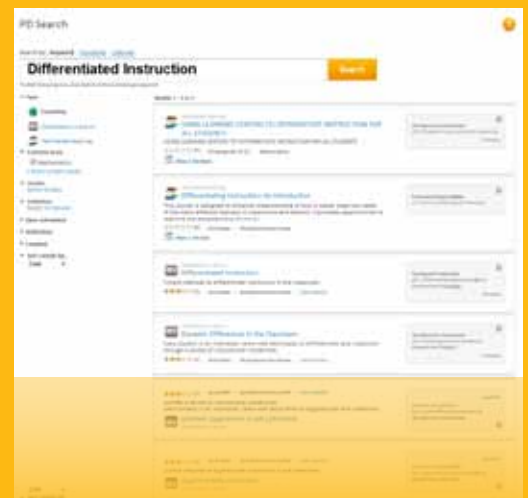
Search the PD data bank by multiple measures, including keyword, standards or date to find resources faster.