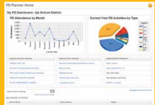
Review multiple measure reports and view recommended PD activities in the My PD Dashboard.