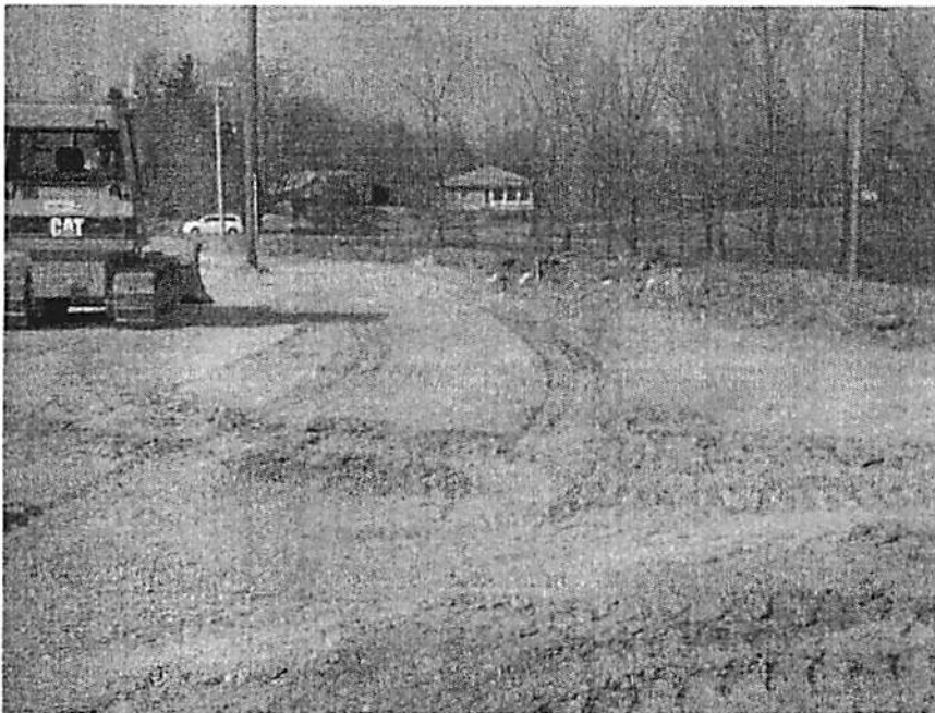
Transition from parking area to road around baseball field showing rutting.