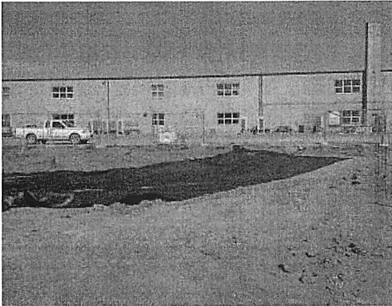
Additional undercut area connecting to existing pavement.