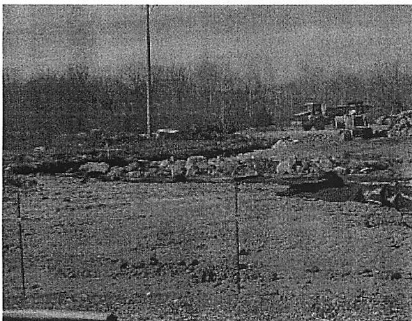
Larger material being placed in first lift.