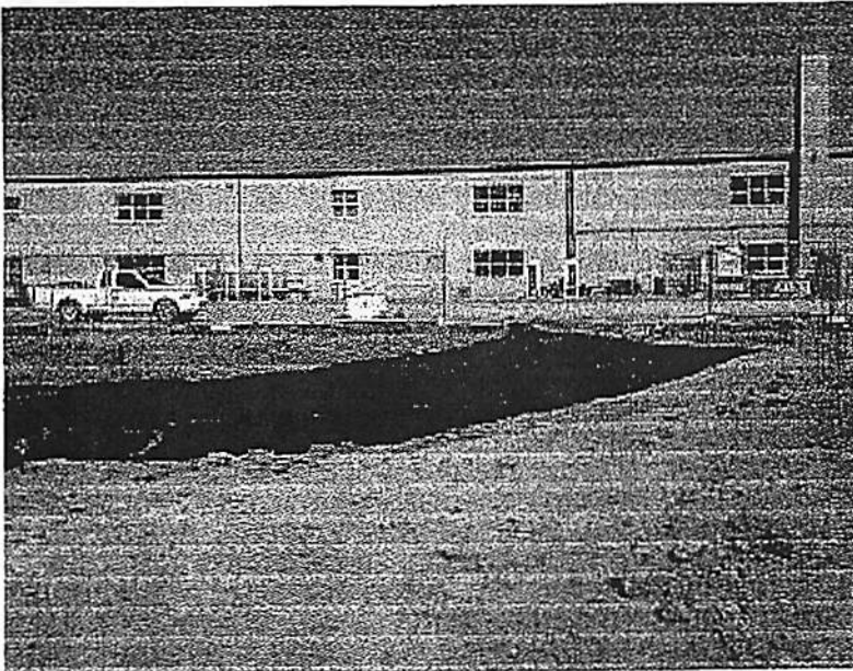
Additional undercut area connecting to existing pavement.