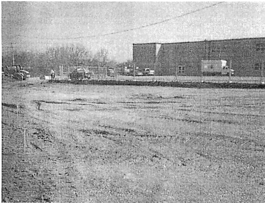
Parking area showing evidence of pumping and rutting.