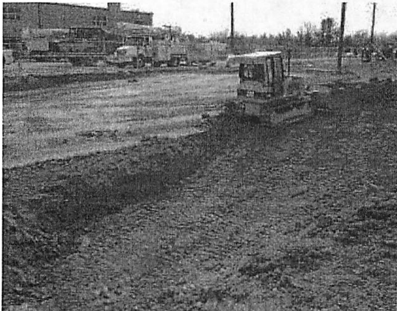
Large area of parking that failed proofroll being undercut.

AEI was on site to observe undercutting of areas that failed proofrolling the previous week. The area was undercut an average of 24" with the contractor cutting one area slightly deeper in an effort to drain any moisture that may become trapped in rubberized concrete. This area can be seen in photo documentation. After the areas were undercut geotextile fabric was placed prior to stabilizing. Larger pieces of material were brought in for the first lift and were capped off with finer material prior to rolling with a tamping foot. An additional area not previously proofrolled showed evidence of pumping and rutting where the new pavement was connecting to the existing pavement. The same undercut was recommended for this area. It was then repaired in the same manner as other unsuitable areas. The approximate undercut was 55 cubic yards prior to fabric and fill placement.