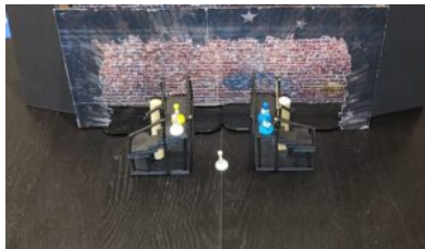
10A henry ford playoff above