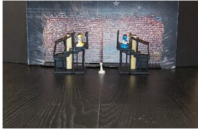
10A henry ford play off elev