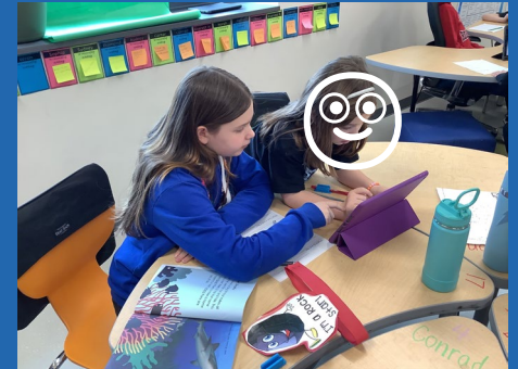
Wren - Empathetic Collaborator