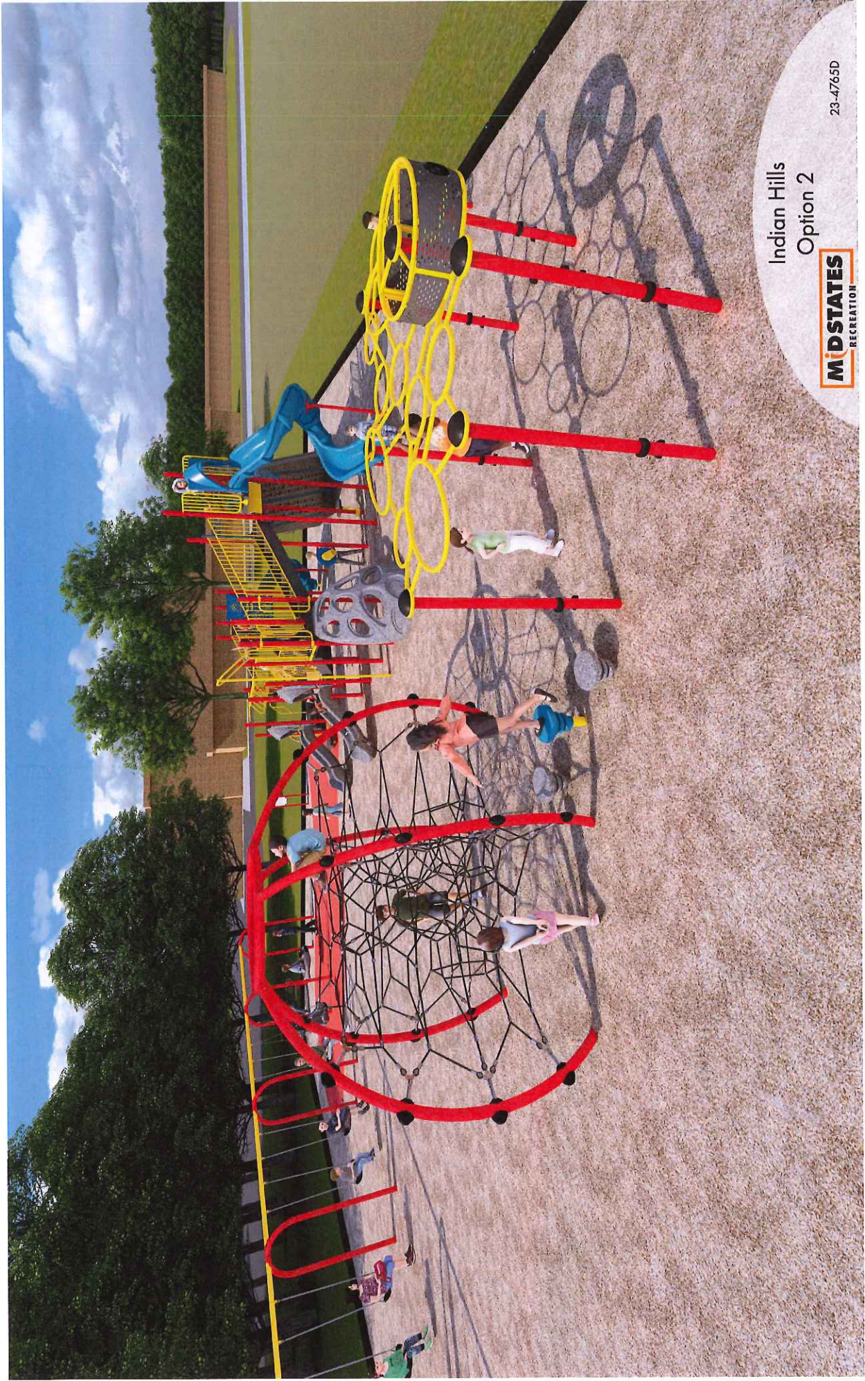
Indian Hills Option 2