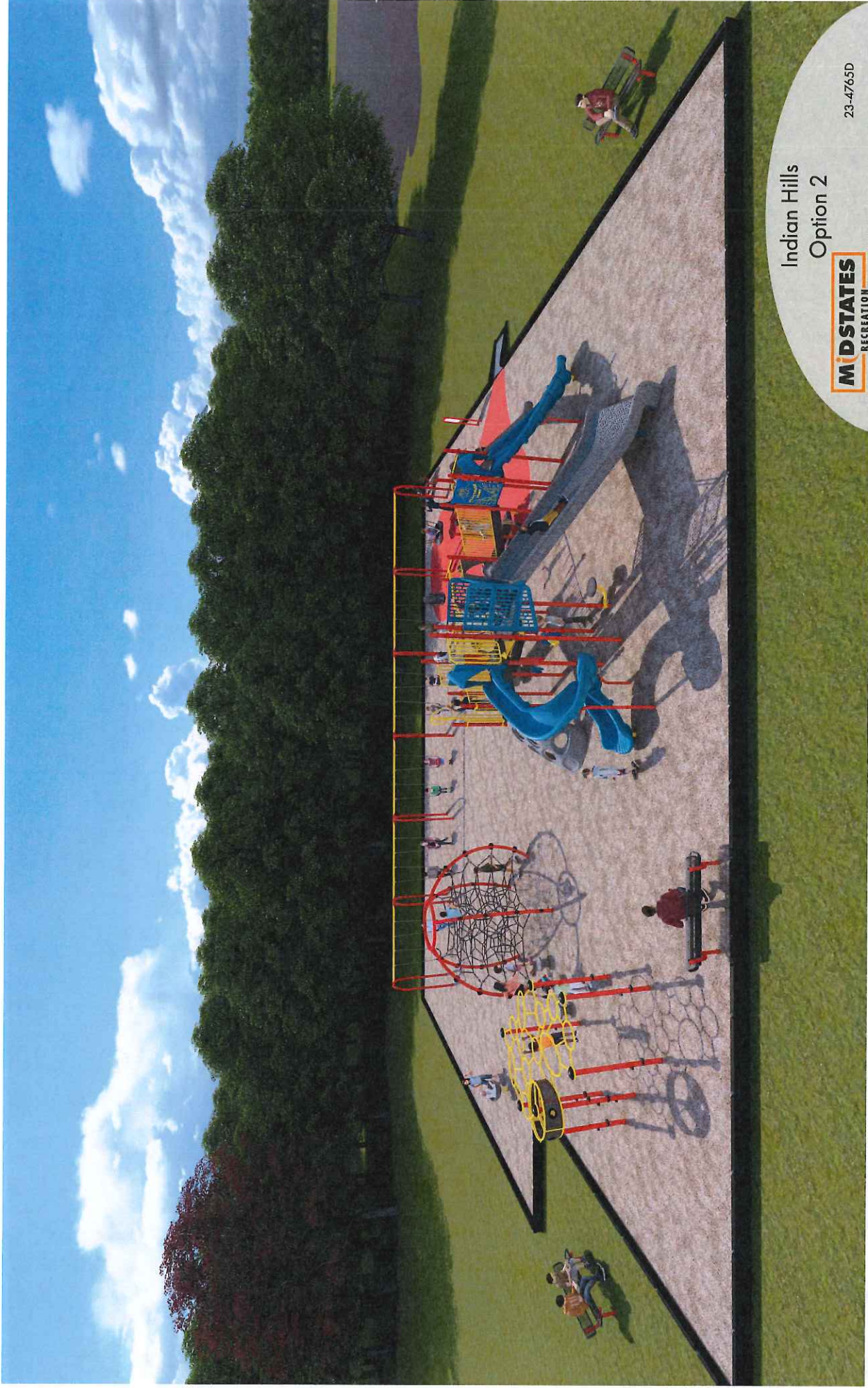
Indian Hills Option 2