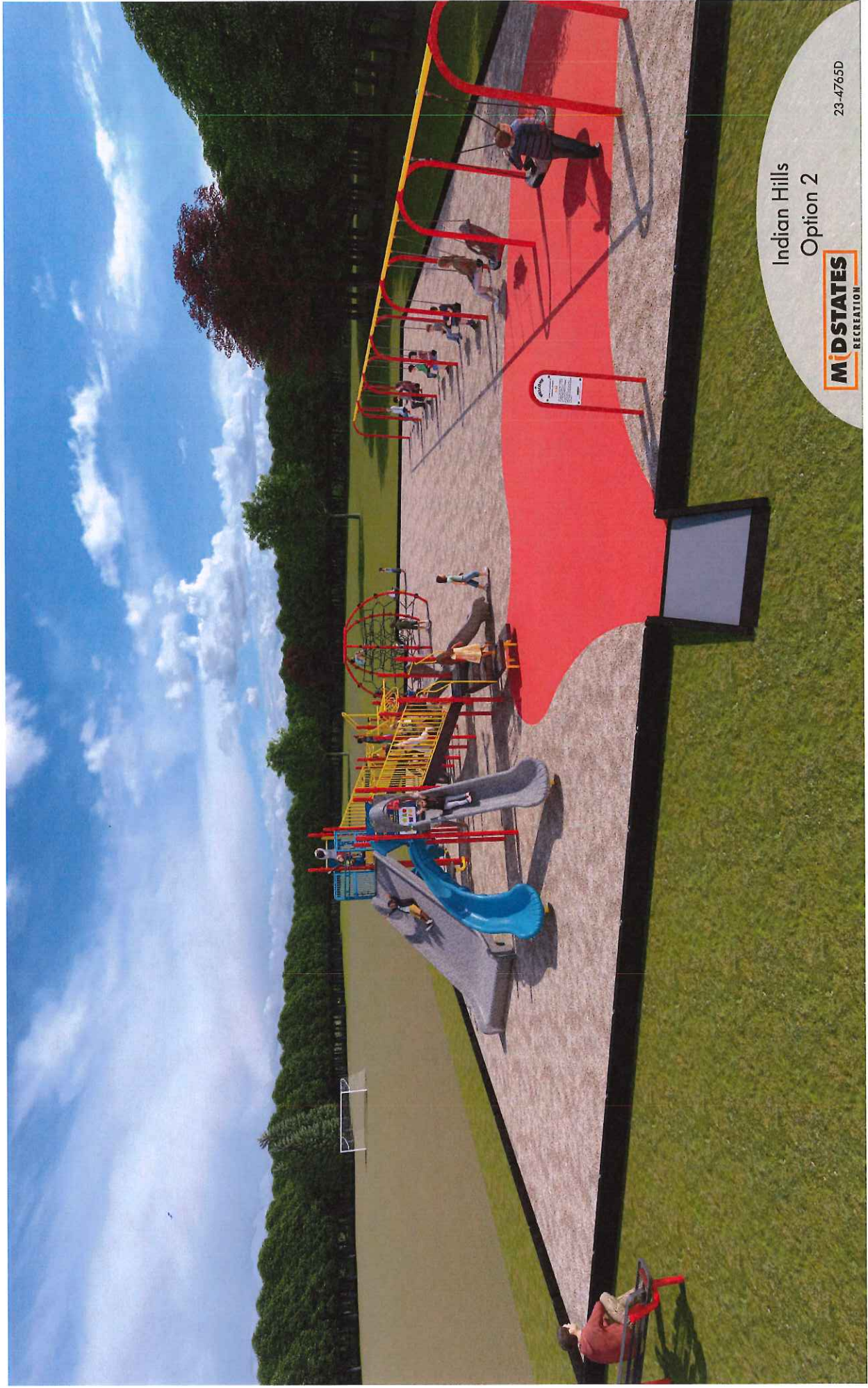
Indian Hills Option 2