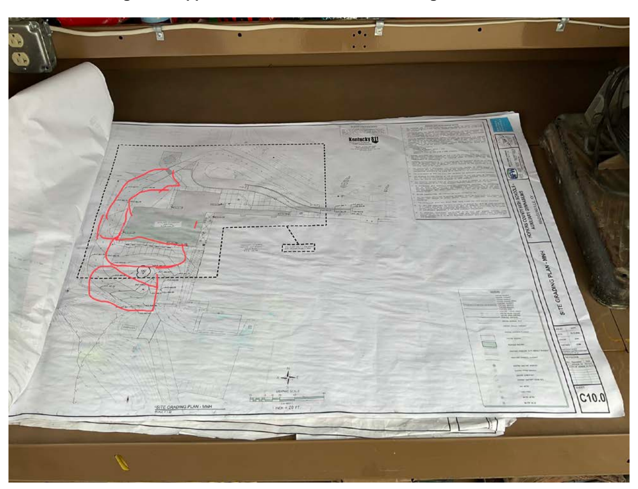
Figure 1: Approximate Area of Unsuitable Subgrade Material

Inspector: Thomas Ervin Starting time: 5:00 AM Ending time: 3:00 PM