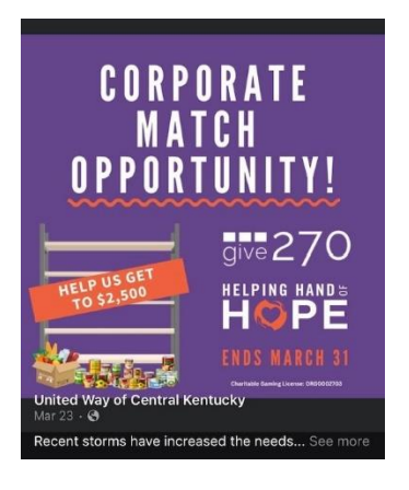
Support of HHH's Fundraising Campaign