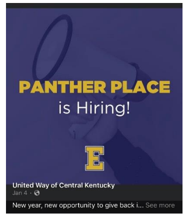
Panther Place Job Oportunity